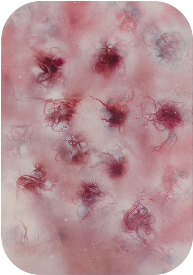
Body Dispersed 5 2017, Mixed media on paper, 116 x 85 cm