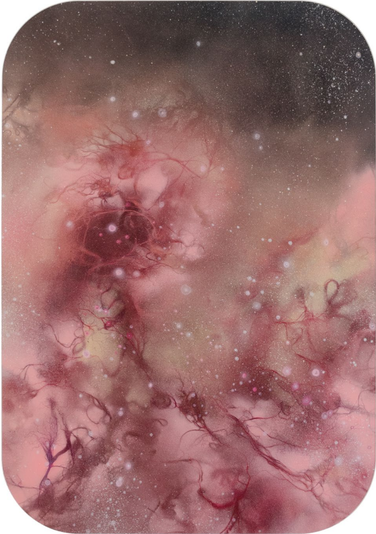
Body Dispersed 1 2017, Mixed media on paper, 116 x 85 cm