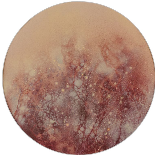
Inner World 1 2017, Mixed media on paper, 43.5 x 54 cm

The creative impetus for the artworks featured in Open Space stemmed from my experience doing an ongoing residency at St Andrews War Memorial Hospital (Brisbane). For many years my art practice focused on expressing music and other sound concepts through visual counterparts. This path diverged when I was given the rare opportunity to see directly inside the human body in surgery as well as studying medical imaging. Seeing the human body turned inside out was both confronting and strangely alluring.