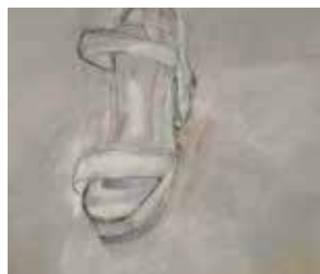
Image: 'Blue moon + not me with a thing that looks like a flower' 35x46cm