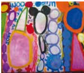
Image: Thinking of dreaming, Melbourne iron lace, as usual.... , 2015, Acrylic/Paper, 40x50cm