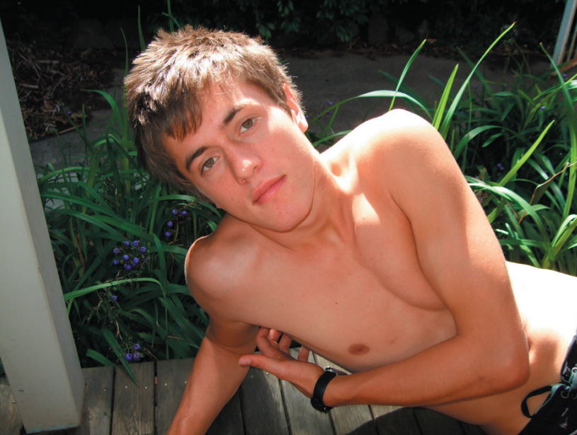
TOP: Golu 19, 2010; ABOVE: Cal 17, 2009. Digital prints on Hahnemuhle paper, dimensions: image size 42.2 x 56.27cm, paper size: 49.2 x 63.27cm