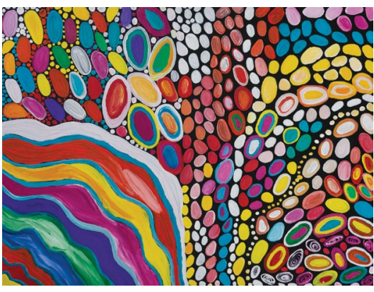
Corals At My Father's Country 2018 Acrylic on canvas, 90 x 120 cm