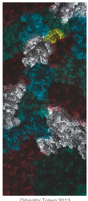
Dibirdibi Totem 2012 Acrylic on canvas, 137 x 61 cm