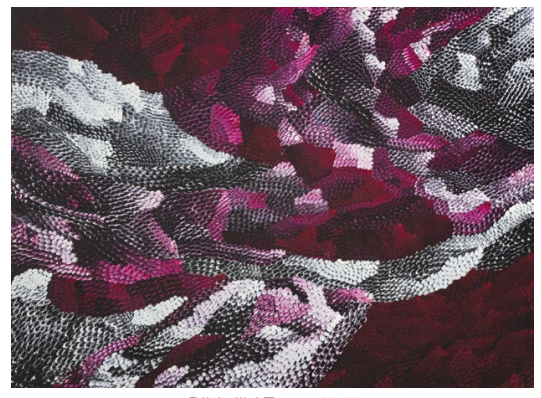
Dibirdibi Totem 2011 Acrylic on canvas, 121 x 91 cm