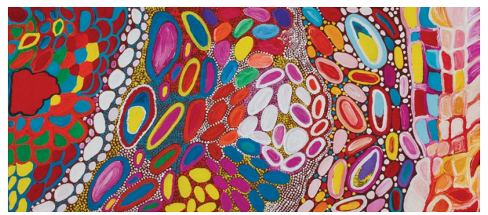
Corals At My Father's Country 2018, Acrylic on canvas, 60 x 135 cm