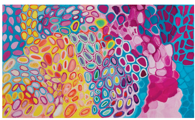
My Country 2018, Acrylic on canvas, 90 x 150 cm