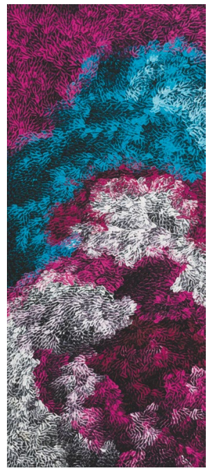
My Country 2017 Acrylic on canvas, 137 x 61 cm