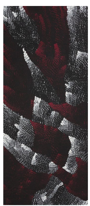
Dibirdibi Totem 2012 Acrylic on canvas, 137 x 61 cm