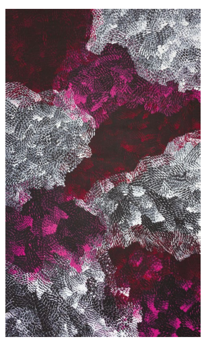
Dibirdibi Totem 2012 Acrylic on canvas, 151 x 91 cm