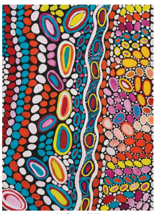
My Country 2018 Acrylic on canvas, 121 x 91 cm