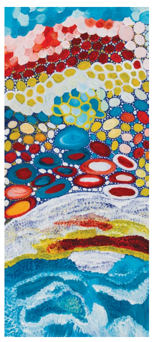
My Father's Country 2017 Acrylic on canvas, 137 x 61 cm