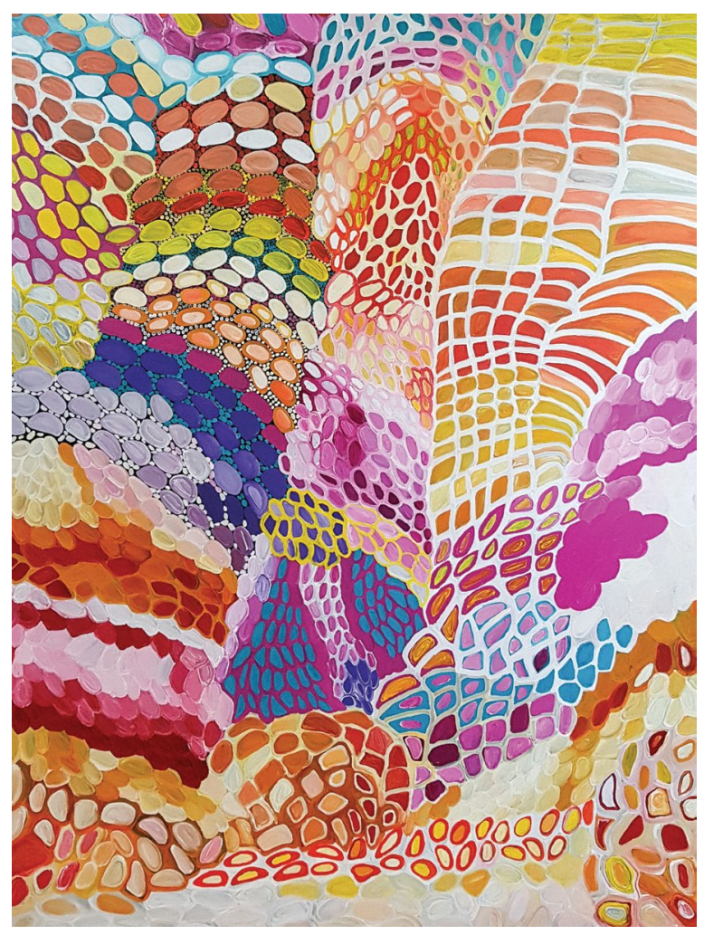
Nyinyilki - My Mother's Country 2018, Acrylic on canvas, 197 x 152 cm

front image: My Country 2018, Acrylic on canvas, 197 x 196 cm