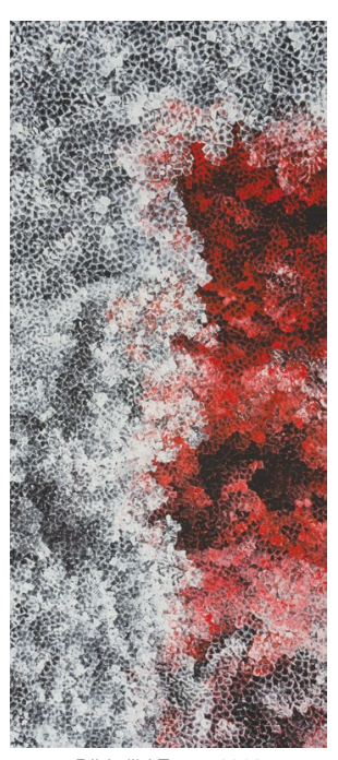
Dibirdibi Totem 2013 Acrylic on canvas, 137 x 61 cm