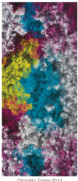
Dibirdibi Totem 2014 Acrylic on canvas, 137 x 61 cm