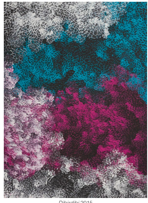
Dibirdibi 2015 Acrylic on canvas, 121 x 91 cm