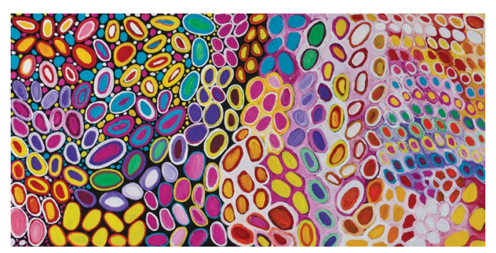
Corals At My Father's Country 2018, Acrylic on canvas, 75 x 150 cm