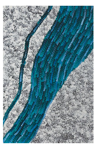
Dibirdibi Totem 2013 Acrylic on canvas, 91 x 61 cm