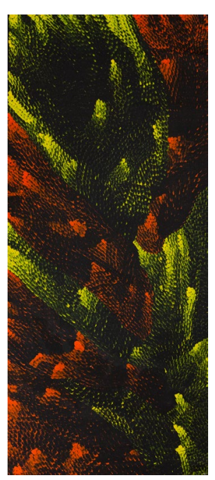
Dibirdibi Scales 2015 Acrylic on canvas, 137 x 61 cm