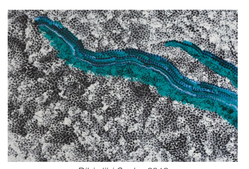
Dibirdibi Scales 2013 Acrylic on canvas, 91 x 61 cm