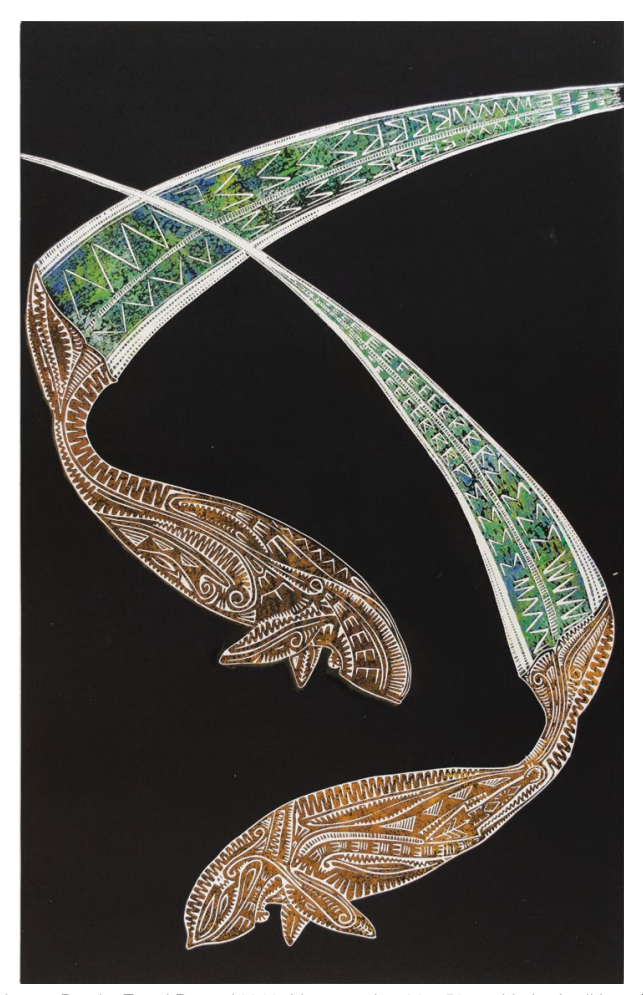
Solomon Booth, Zagul Dungal 2018, Linocut print, 80 x 50cm, Limited edition of 5