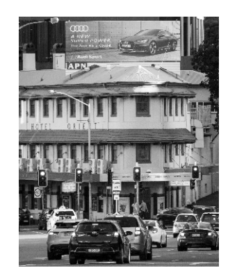
18/ "Orient Hotel Traffic"

2018 8" x 10" (20.3cm x 25.4cm) Palladium Print