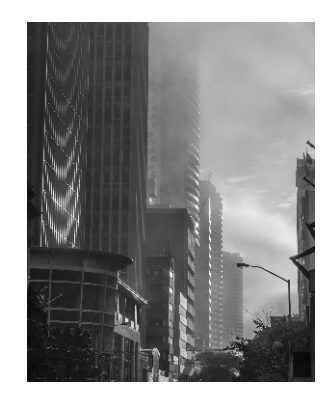
16/ "Misty City" 2018 8" x 10" (20.3cm x 25.4cm) Palladium Print