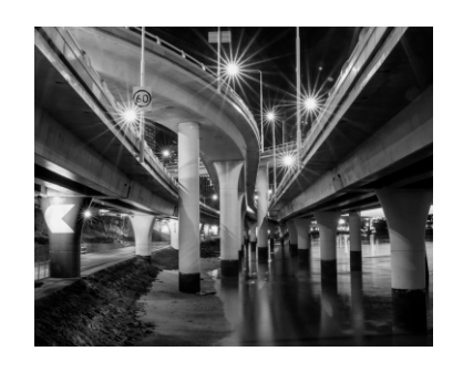
19/ "Under the Expressway" 2018

10" x 8" (25.4cm x 20.3cm) Palladium Print