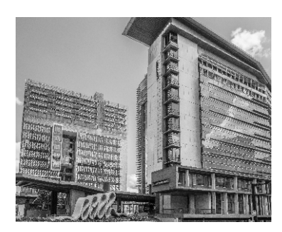
17/ "Court Precinct" 2018 10" x 8" (25.4cm x 20.3cm) Palladium Print