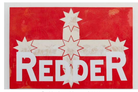
Redder (gum blossoms) 2019 Acrylic paint & vinyl lettering on carved ply 70 x 105 cm

Red Redder White and Blue is a series of works based on the Eureka stockade flag. An image as Australian as the Cronulla riots and the Don Dale detention centre. The series references two American artists – Jasper Johns and Ed Ruscha. Johns through images and symbolism of flags. Ruscha through the use of hard and soft edges, text and in "ReddeR" a palindrome. I have used carved images of native flowers and overlain with the Eureka Stockade flag and text in an attempt to portray the dichotomy of pride in one's country and unease with jingoism and patriotism.