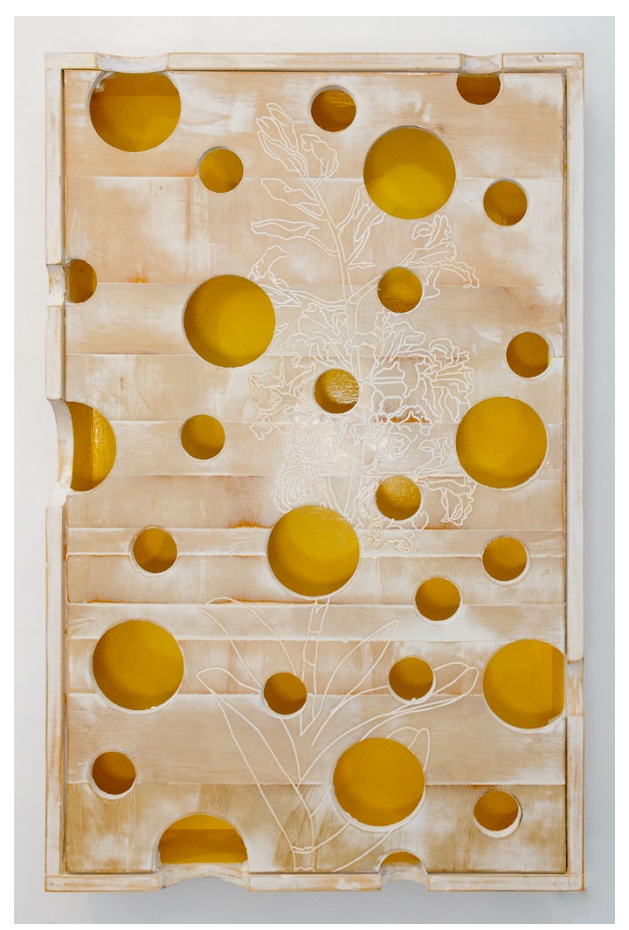
Dappled Golden Orchard, a conversation with Sydney Parkinson and Yayoi Kusama. 2019 Acrylic & enamel paint on carved ply & pine box 94.5 x 61 cm

front image: **Blinky Bill's Plea 2019* **Acrylic & enamel, aerosol and airbrush with vinyl lettering on carved ply 64.5 x 87 cm