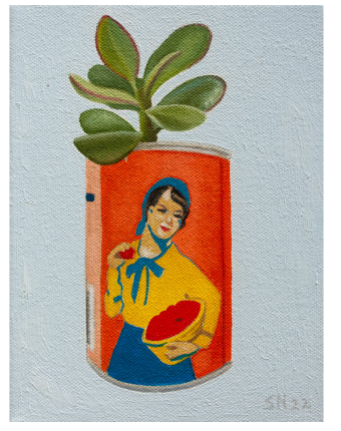
Succulent in a Tin (Red) 2022 Oil on canvas, 20 × 15 cm