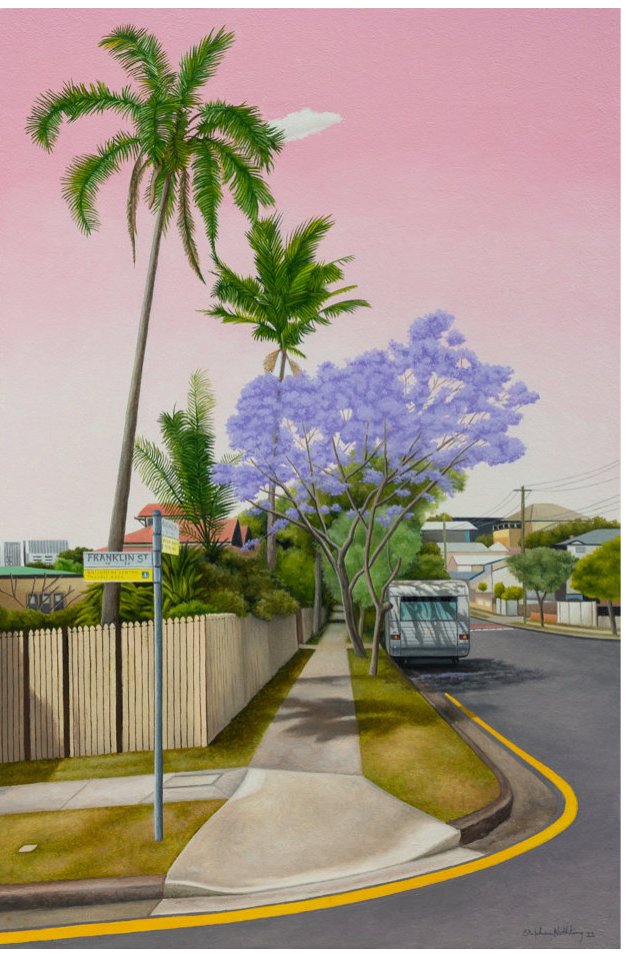
4th October, Brighton Road 2022, Oil on board, 90 × 60 cm