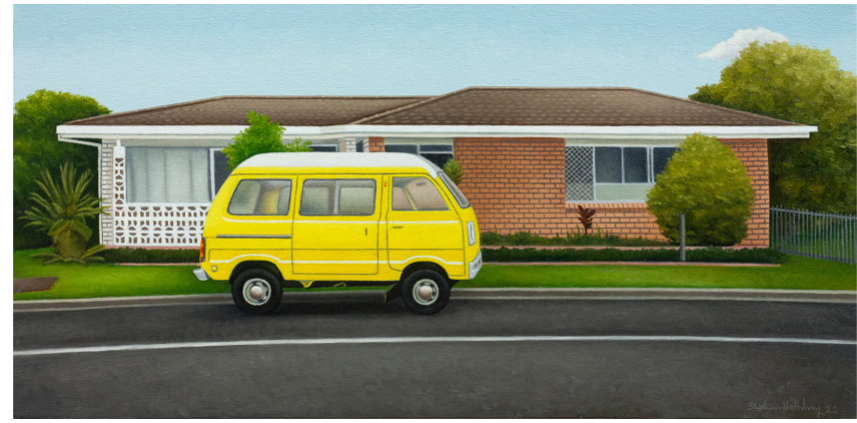
Holiday House, Caloundra 2022, Oil on canvas, 37.5 × 76 cm