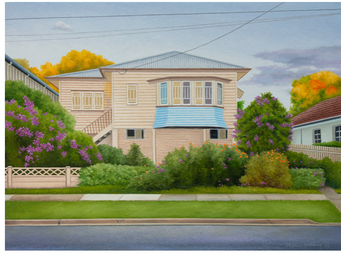
Colour on the Corso 2022, Oil on board, 45 × 60 cm