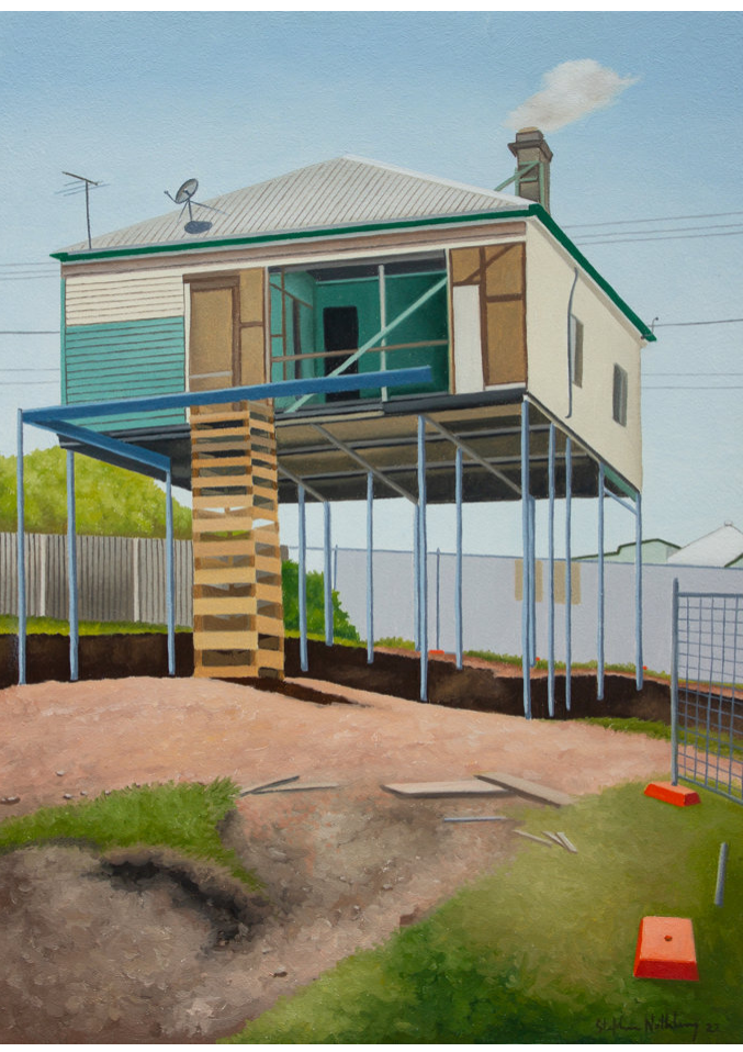
Uplifted on Lindon Street 2022, Oil on board, 60 × 45 cm