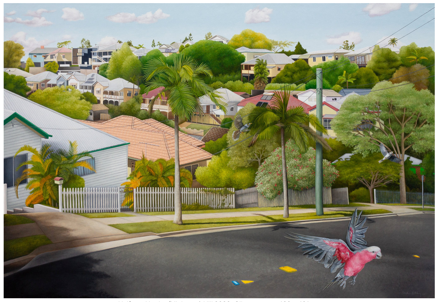
Halfway Up the (Highgate) Hill 2022, Oil on canvas, 130 × 191 cm