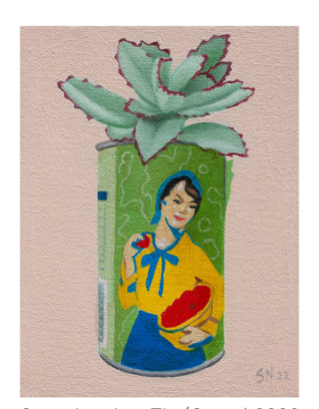
Succulent in a Tin (Green) 2022 Oil on canvas, 20 × 15 cm