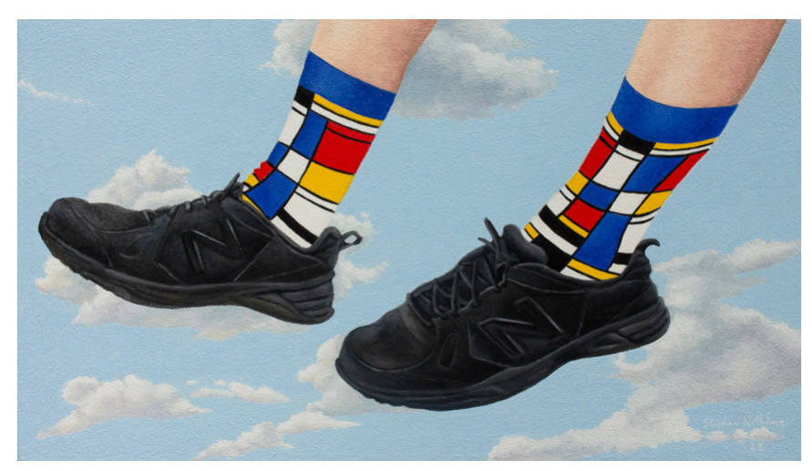
Self Portrait in my Mondrian Socks 2022, Oil on board, 34 × 60 cm