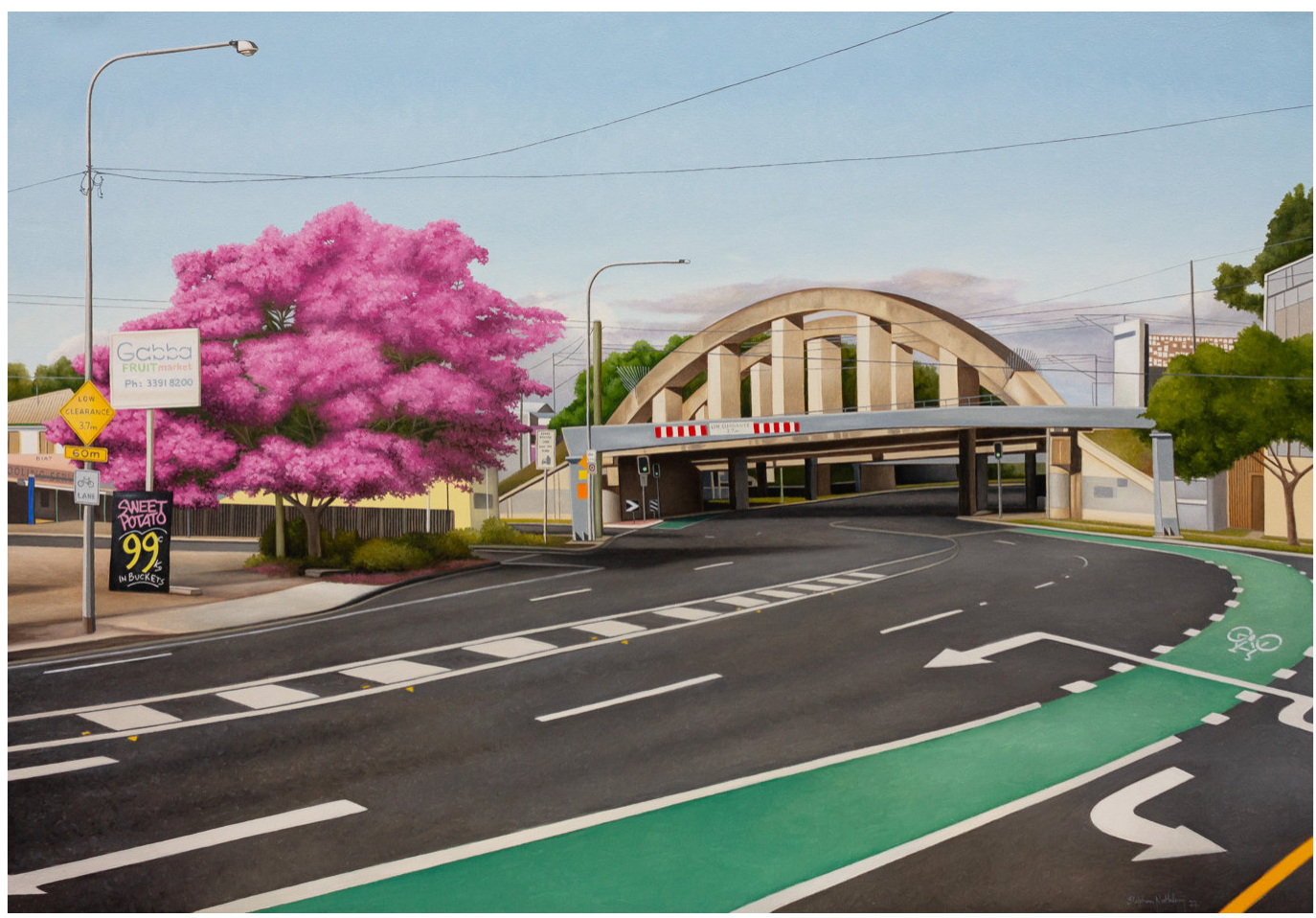
Annerley Road Trip 2022, Oil on canvas, 110 × 160 cm