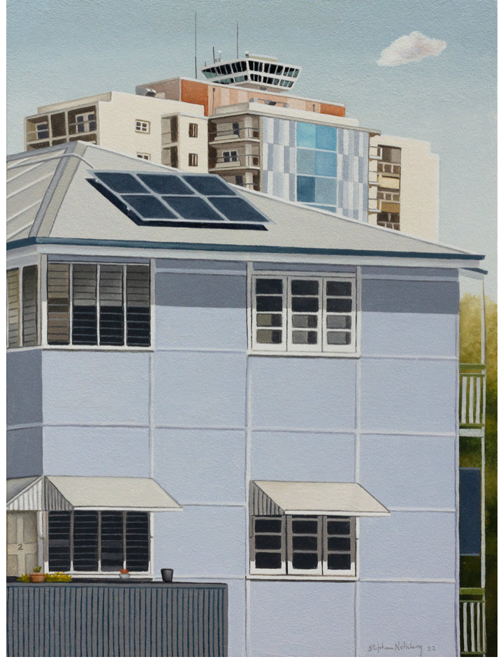
Flats on Flats 2022, Oil on board, 60 × 45 cm