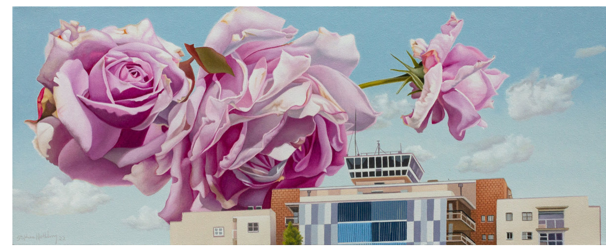
Lookout! 2022, Oil on canvas, 36 × 90.5 cm