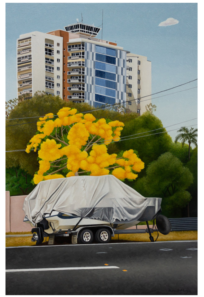
The Ark 2022, Oil on board, 90 × 60 cm