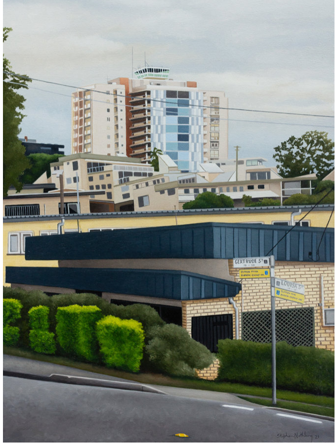
A More Modern View 2021 Oil on canvas, 77.5 × 57.5 cm