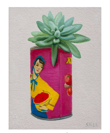
Succulent in a Tin (Pink) 2022 Oil on canvas, 20 × 15 cm