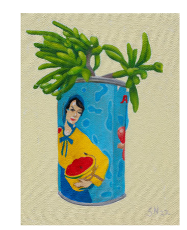
Succulent in a Tin (Blue) 2022 Oil on canvas, 20 × 15 cm