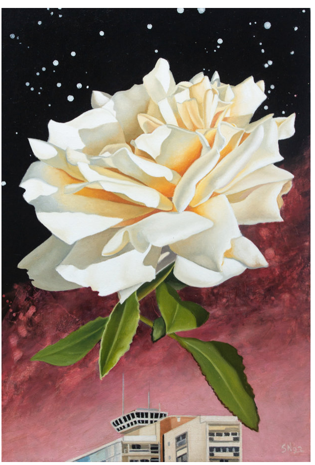
High Rise Rose 2022 Oil on canvas, 45 × 30 cm