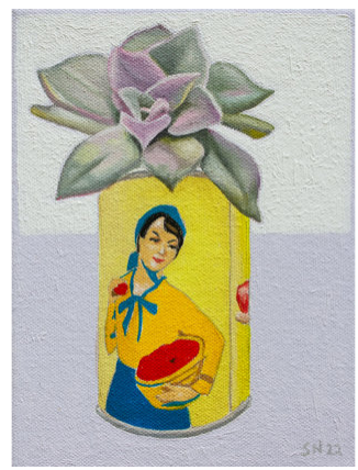
Succulent in a Tin (Yellow) 2022 Oil on canvas, 20 × 15 cm