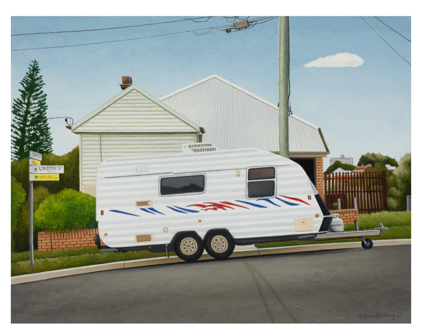
The White House (before it changed), Linden Street 2021 Oil on canvas, 50.5 × 66 cm