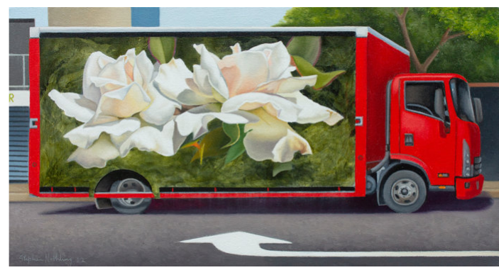
Red Rose Truck on Melbourne Street 2022, Oil on canvas, 30 × 55 cm