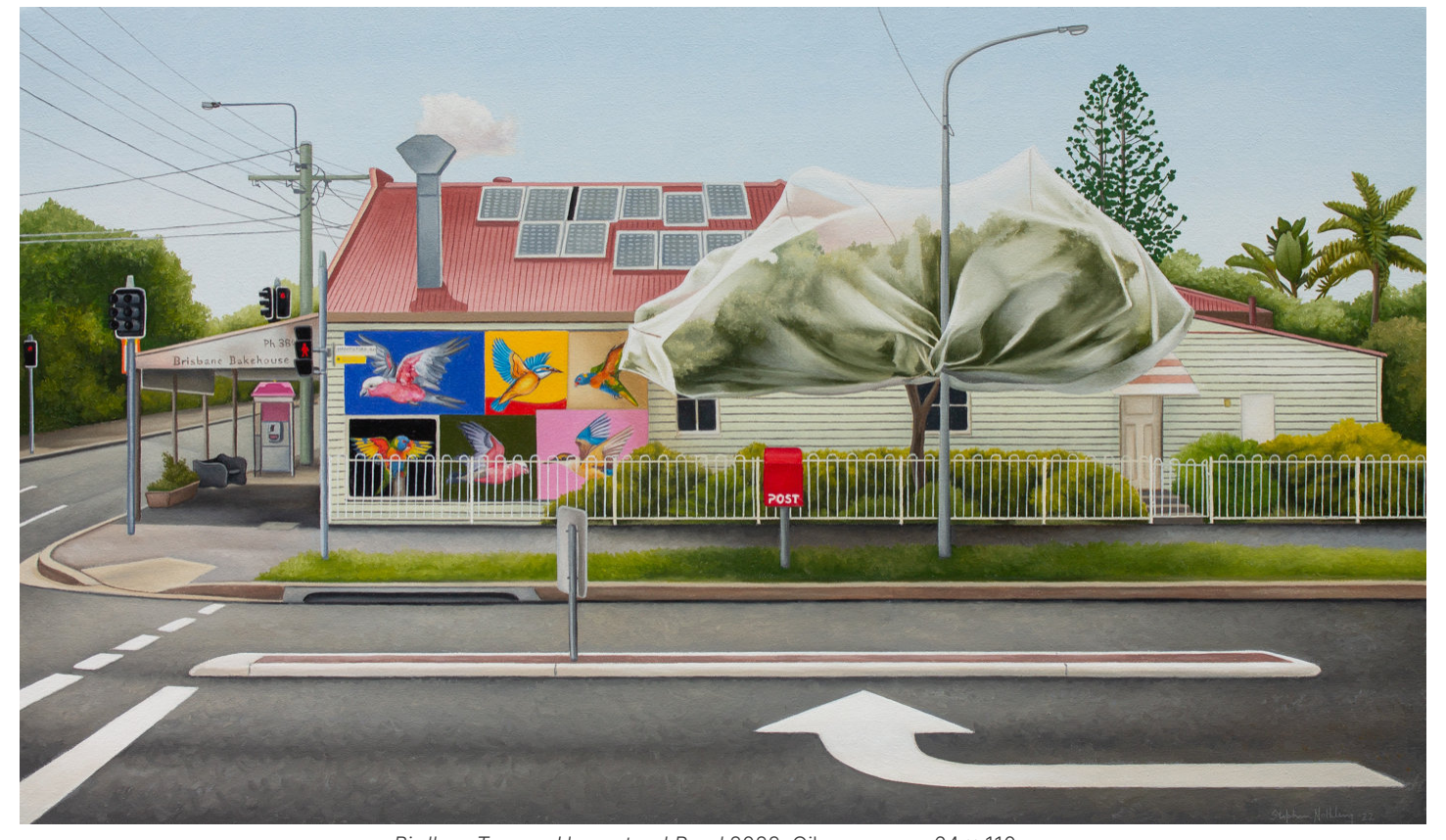
Birdless Tree on Hampstead Road 2022, Oil on canvas, 64 × 110 cm