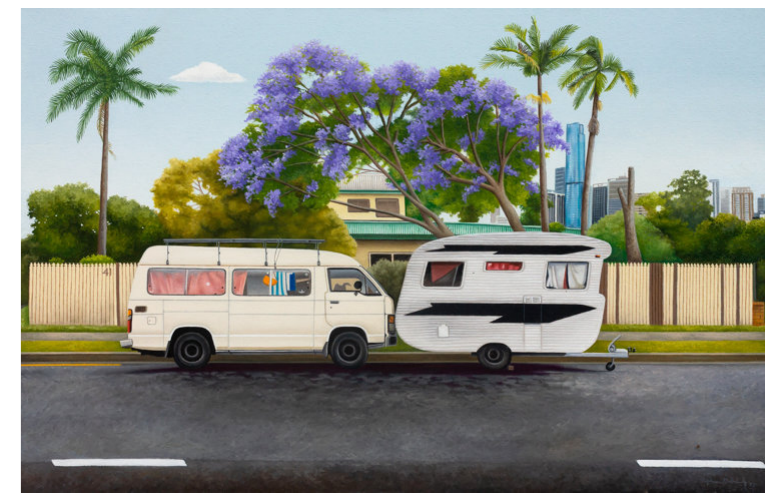
The Bright Side of the Road, Brighton Road 2021, Oil on canvas, 66 × 100 cm