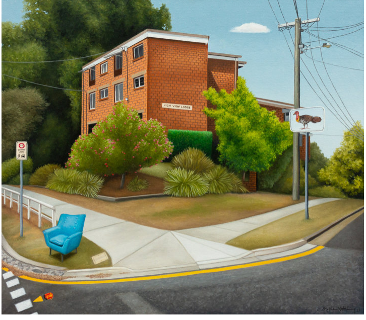
Shared Zone, Cnr West & Gertrude Street 2021 Oil on canvas, 66 × 76 cm