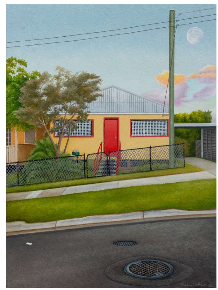
Late Afternoon on Mabel 2022 Oil on board, 60 × 45 cm