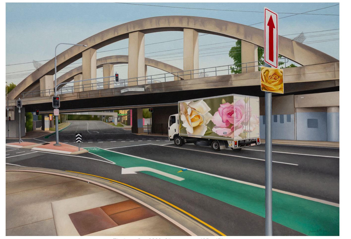
The Long Run 2022, Oil on canvas, 105 × 151 cm