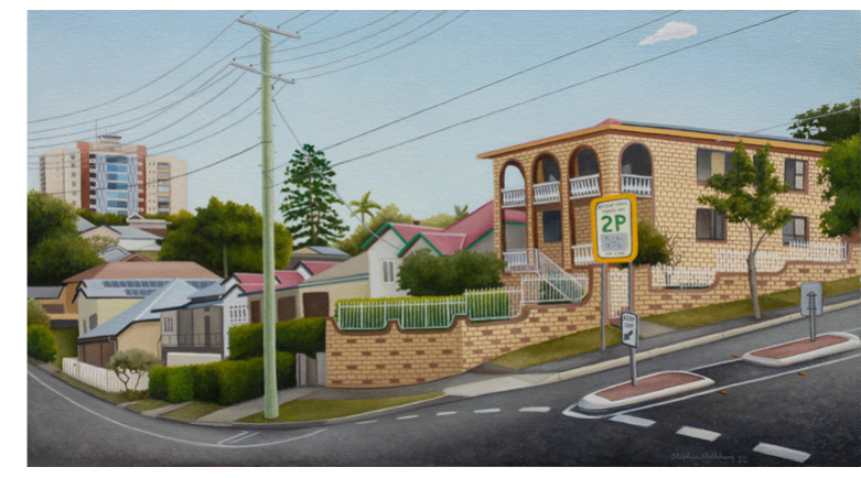
Northwest along Gloucester Street 2022, Oil on canvas, 40.5 × 73.5 cm