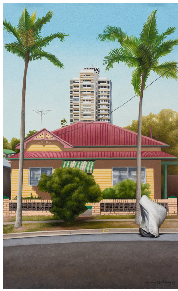
Not Going Anywhere Soon, Blakenay Street 2021 Oil on canvas, 76 × 48 cm