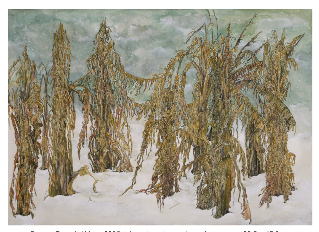
Banana Trees In Winter 2023, Ink, watercolour and acrylic on paper, 32.5 × 45.5 cm

Oubaitori (おうばとり) - is a Japanese idiom. Cherry blossoms, plum, peach, and apricot. Each flower blooms and fruits in its own time, people also grow and bloom at their own pace. Living in Queensland and in context with my personality, banana trees seem better suited.