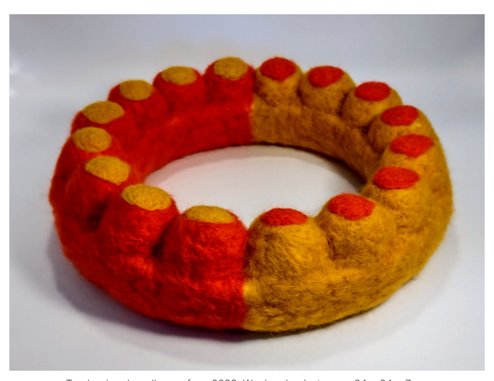
Tandoori and mudhoney form 2022, Wool and polystyrene, 24 × 24 × 7 cm

Casselle Mountford's soft tactile sculptures are created using felted merino wool. Their rounded fluidity and exuberant, vibrant colour combinations exude a playful, joyous harmony. The tactility of these sculptures reflect her interest in handmade textile processes.