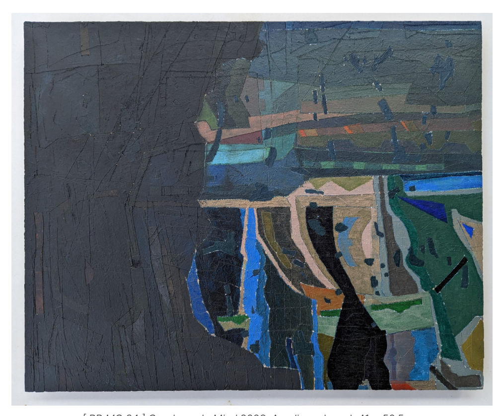
[ BB MC 84 ] Goodness In Mind 2023, Acrylic on board, 41 × 50.5 cm