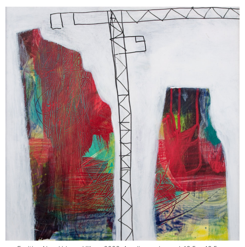
Exciting New Urbane Village 2023, Acrylic on plywood 43.5 × 43.5 cm