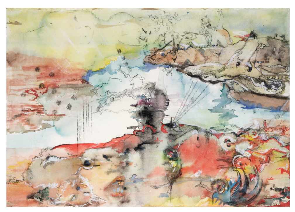
Facing the Past, Looking Beyond the Present:: dreamscaping towards a brighter future 2023, Watercolour, gouche, charcoal & pastel on paper, mounted on board, 41.5 × 58.5 cm