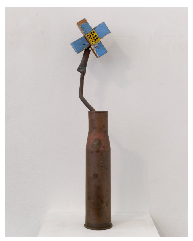
Peace Flower (For Ukraine) 2022, Found object assemblage, 41 × 9 × 8 cm