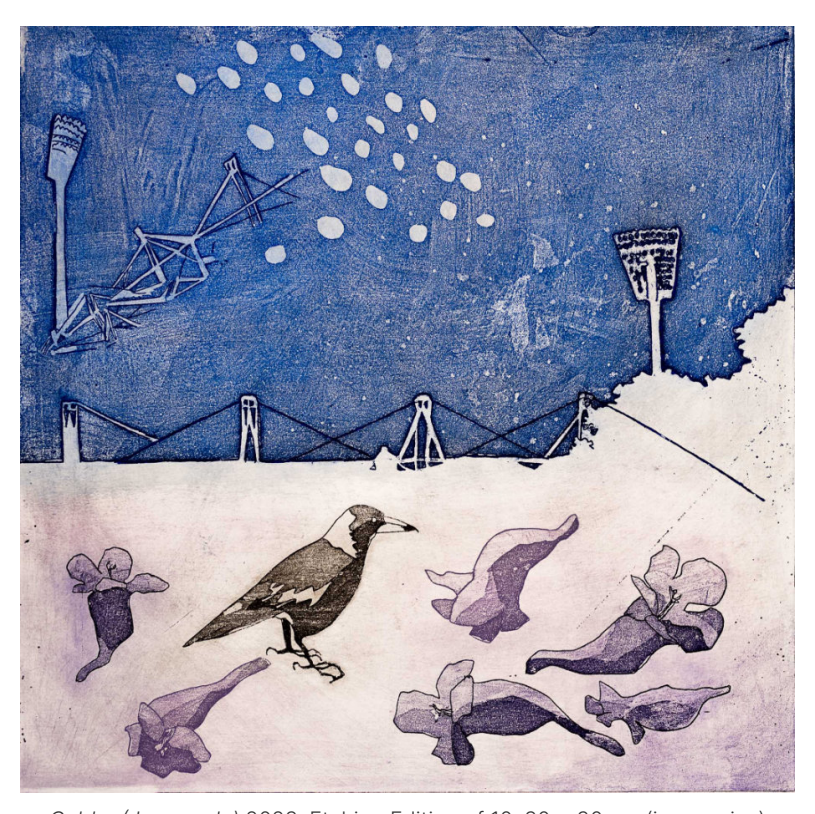
Gabba (Jacaranda) 2023, Etching Edition of 10, 30 × 30 cm (image size)

Kay's "Gabba" series original prints are etchings created in 2023 utilising the Gabba, summer flowers and Queensland's blue sky as main motifs. Kay has also added a magpie to one of the prints as they are a favourite wild bird of hers which are commonplace in Brisbane's suburbs.