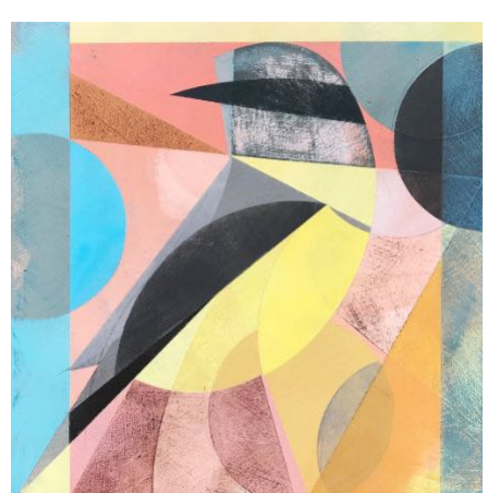
Eastern Yellow Robin, 2023