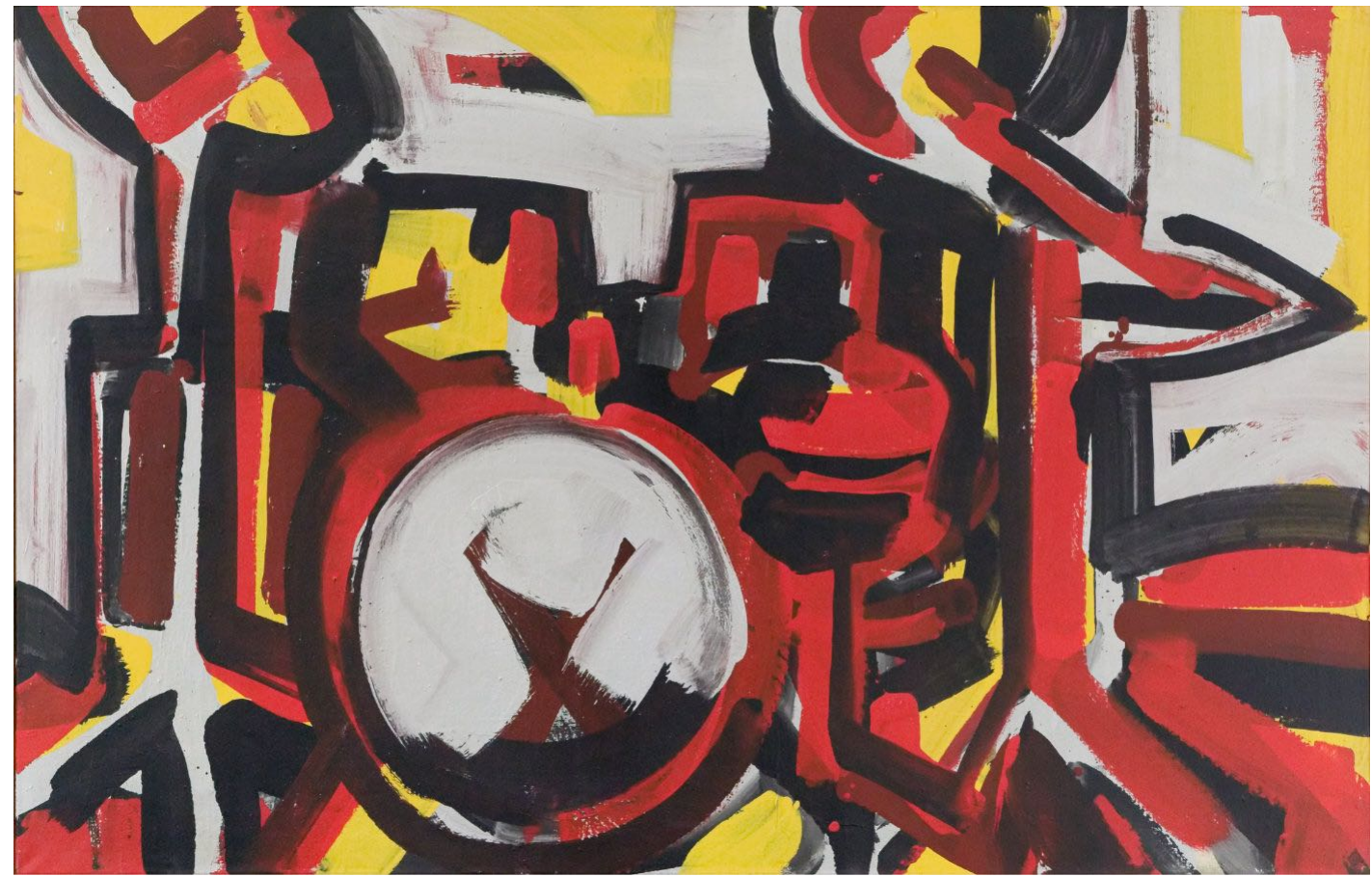
Red 5 piece drum kit, 2007