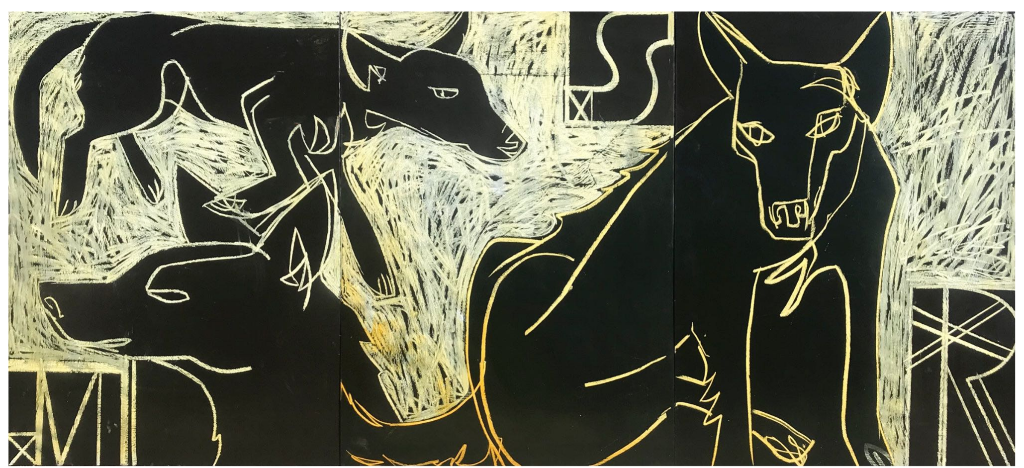
Dogs are Red (3 panels), 2006