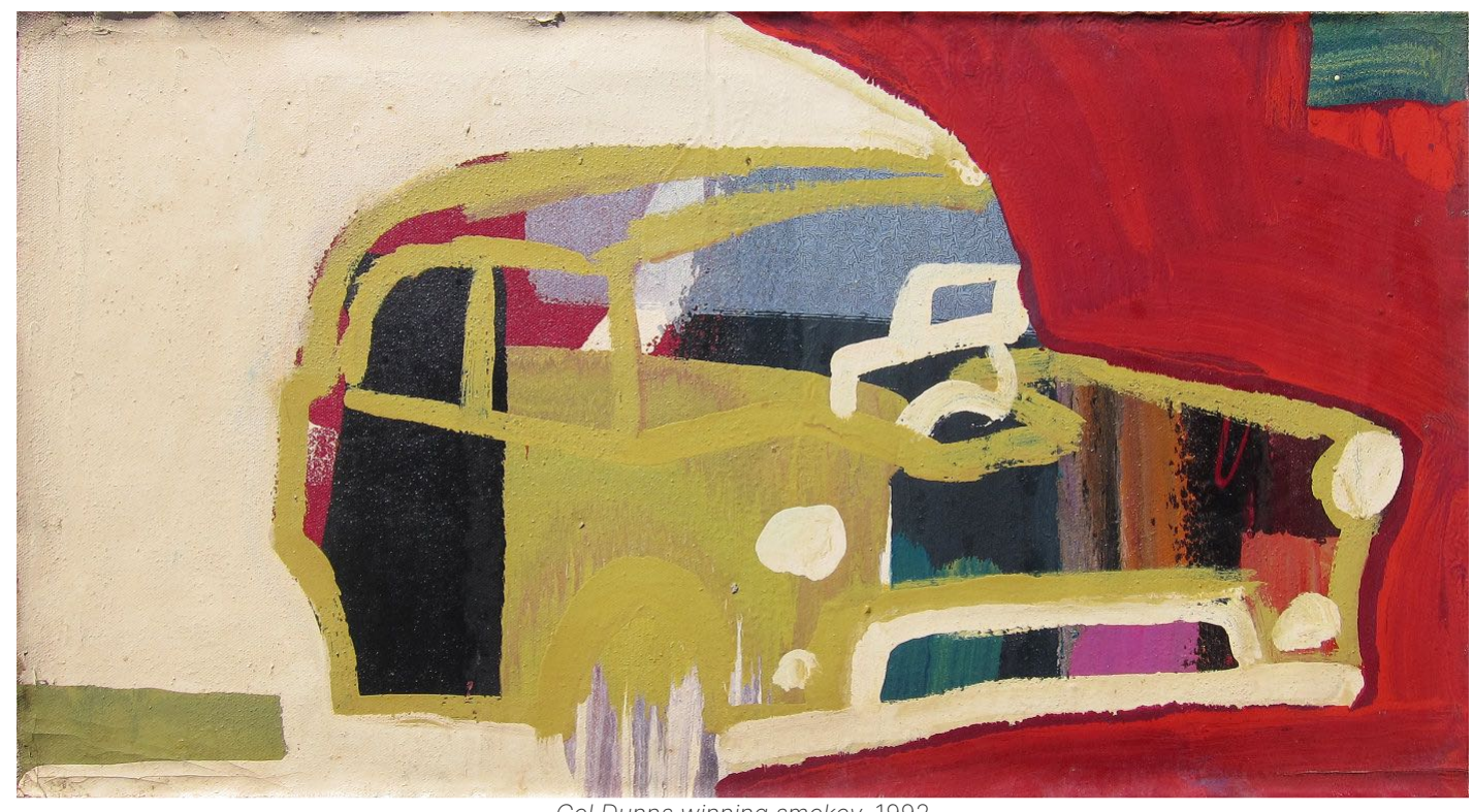
Col Dunns winning smokey, 1992