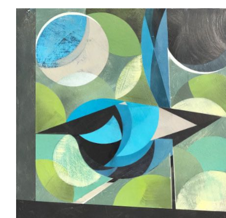
Superb fairy-wren, 2023