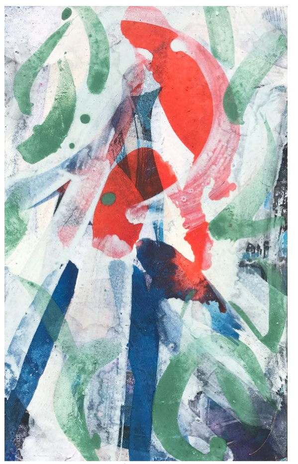
Pair of parrots, 2023