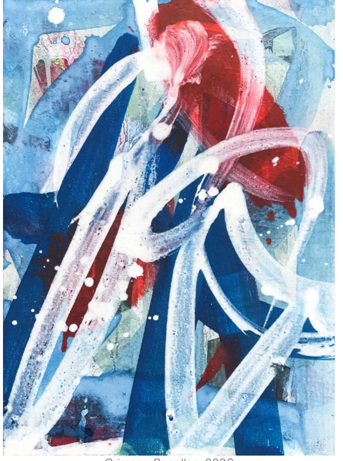
Crimson Rosellas, 2023