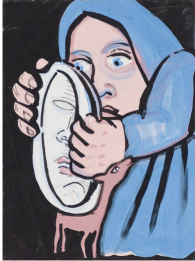
Ash Wednesday Earthenware tile 20 × 15 cm