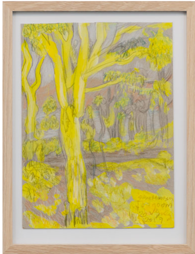
Yellow Trees of Toogoom Pencil and acrylic on card 35 × 27 cm

front image: SEX-DEATH Mask #1 , BRT clay, underglaze, glaze, earthenware, 26 × 14 × 9 cm