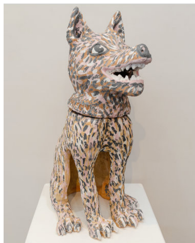
Monumental – Fella BRT clay, underglaze, earthenware 65 × 31 × 36 cm