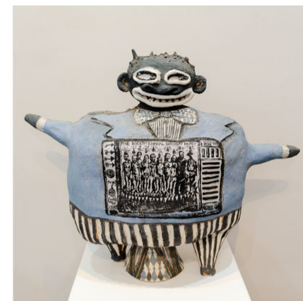
Bicentennial Birthday Party BRT clay, underglaze, earthenware & carbon transfer, 53 × 69 × 26 cm