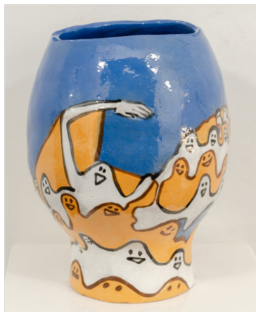
Mexican Wave – Boab Pot BRT clay, underglaze, gloss earthenware 40 × 32 × 32 cm

out of a constantly engaged imagination grappling with the vicissitudes of everyday mundanity and its moments of extremes. In a sense there is as much fire in the passion for the making as there is in the heat of the kiln, grit in the clay body as in the telling of the images and objects made, gumption in the relentless keeping-going as in the working of the medium and then the colour, a spectrum of glazes matt and shiny to match a forthright view of the world delivered with an uncanny twist of style. But there is also the reflective – the curious crowd of little people looking at public art, her collections of glazed iPods and tablets,