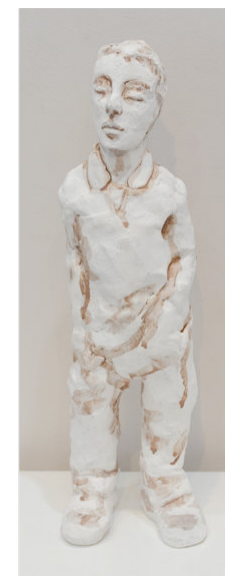
Looking at the Apple – Figure 1 BRT clay, underglaze, earthenware 38 × 12 × 9 cm