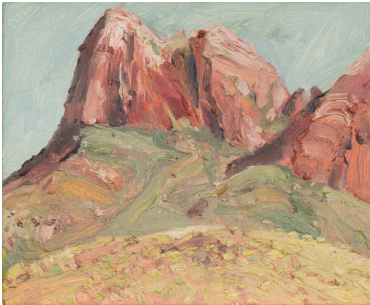
Haasts Bluff, NT 2014, Oil on board, 25 x 30 cm

Looking at this group of works by Peter Hudson immediately took me back to a trip to Haasts Bluff where we painted together in 2013. Peter has totally captured the duality of the place, both severe and serene, the intensity of colour but also the intensity of the greys, the vastness but also the intimacy. It was obvious for me when we were there but it is beautifully restated in the work just how much passion and respect Peter has for this country and its first peoples. He treads softly but is able to get inside the landscape and put this connection onto the canvas. Each work is individually and lovingly brought to life through this intense experiencing, allowing the viewer to also share in his intimate interaction with a place that means so much to him. ~ Euan Macleod 2014