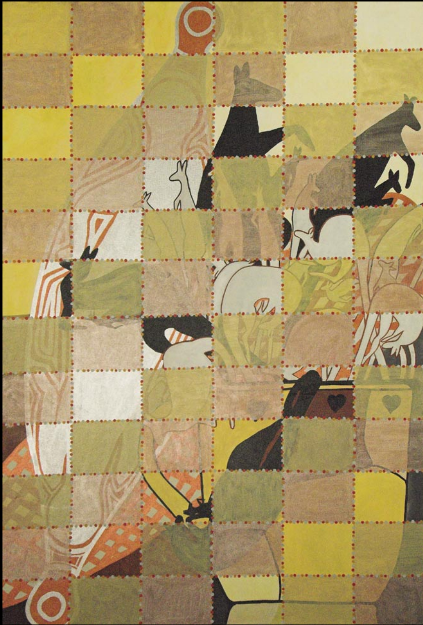
Marshall Bell Preston / Bell 2006 183 x 121 cm acrylic on canvas