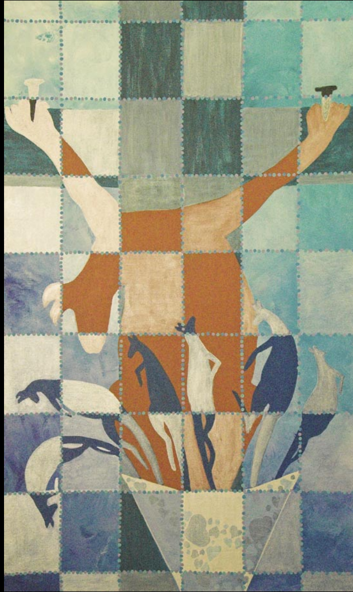
Marshall Bell Twilight 2006 151 x 91 cm acrylic on canvas