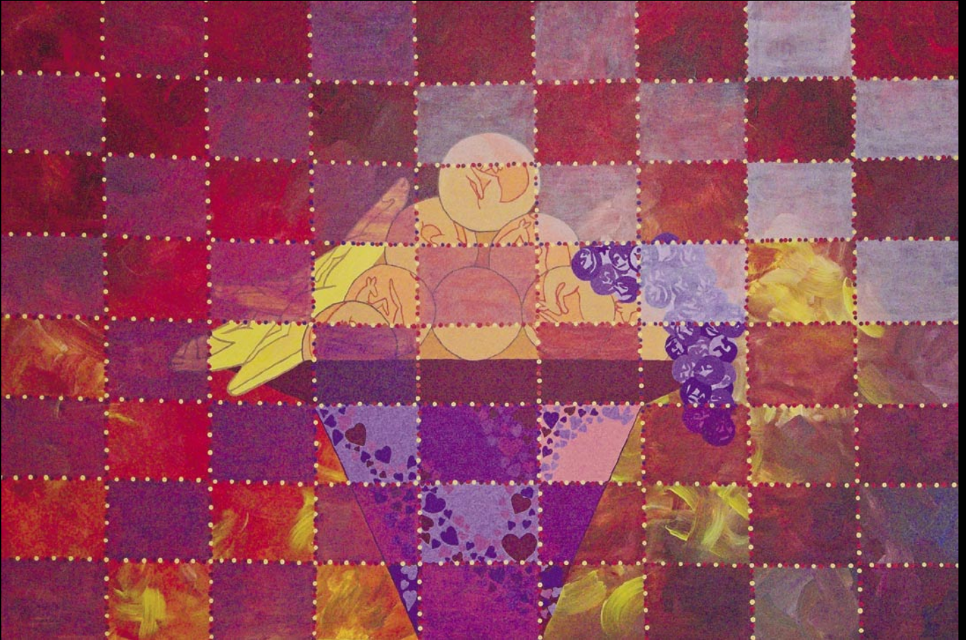
Marshall Bell Still Life, Bowl of Fruit 2006 121 x 183 cm acrylic on canvas