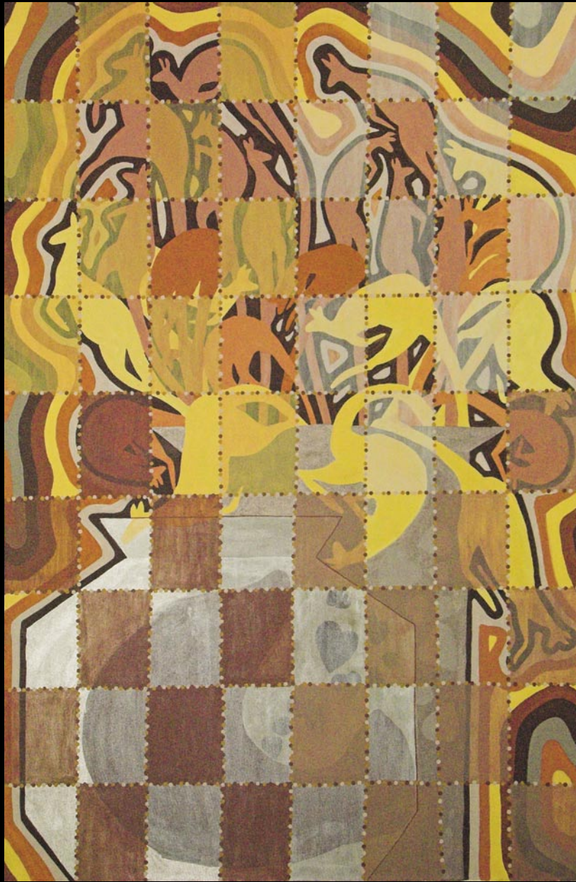
Marshall Bell Big Fish 2006 183 x 121 cm acrylic on canvas