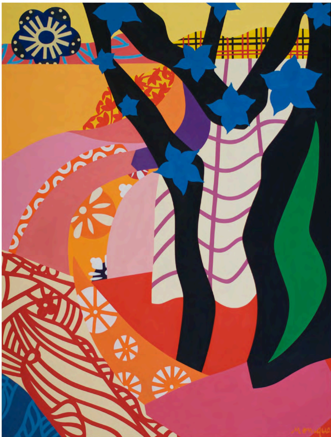
"EL TEMPLADO " (The Tree of Temperance) Oil on canvas, 70 x 100 cm, 2014