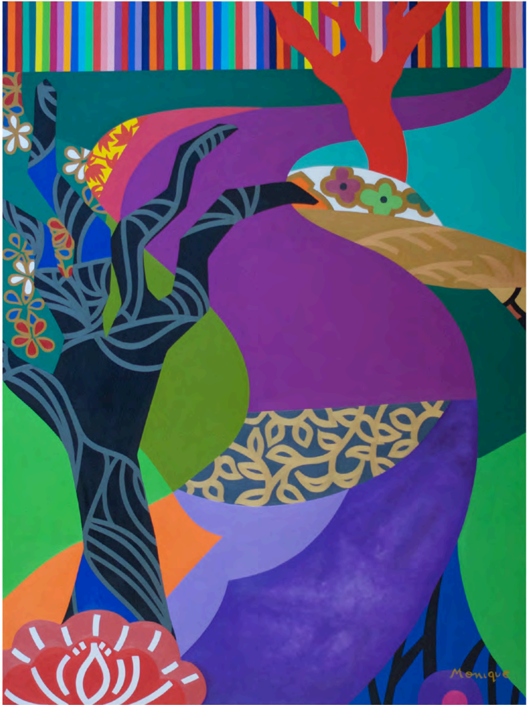
"EL DILIGENTE " (The Tree of Diligence) Oil on canvas, 70 x 100 cm, 2013