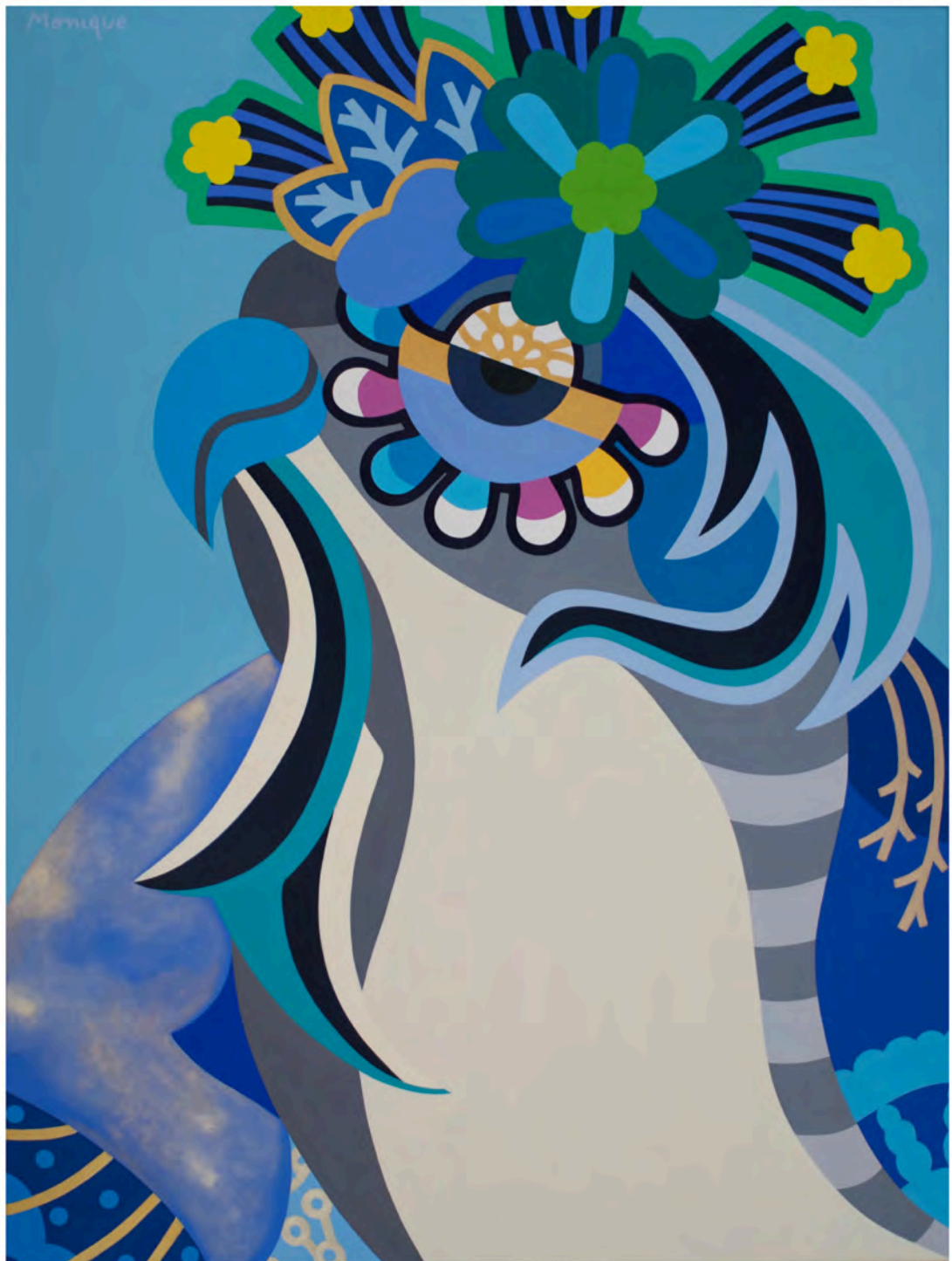
"LA PEREZOSA" (The Lazy Parrot) Oil on canvas, 70 x 100 cm, 2015