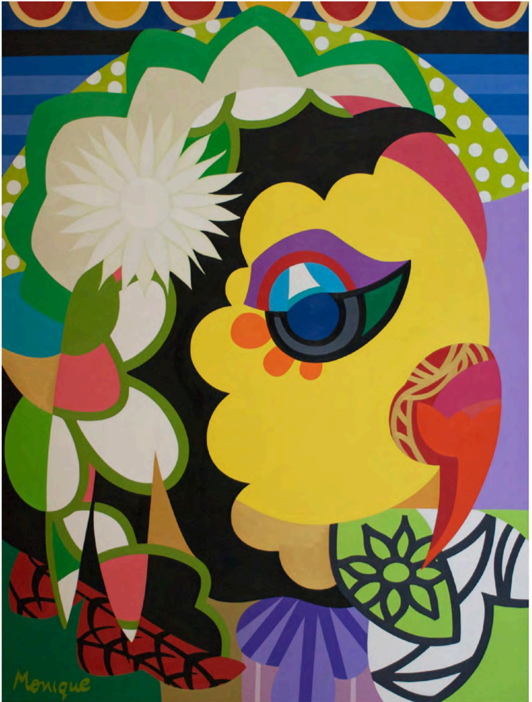
"LA SOBERBIA" (The Proud Parrot) Oil on canvas, 70 x 100 cm, 2014