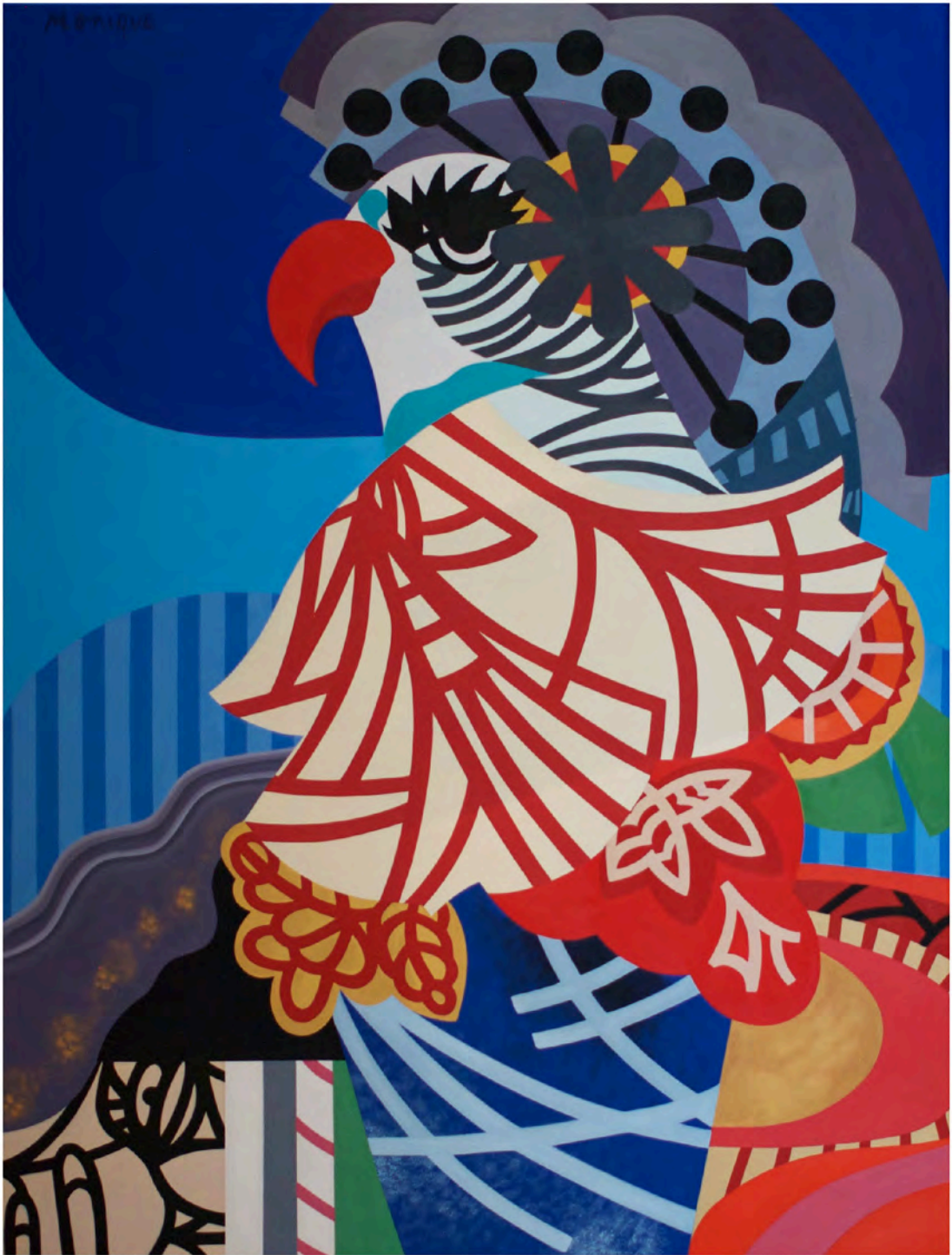
"LA ENVIDIOSA" (The Jealous Parrot) Oil on canvas, 70 x 100 cm, 2014