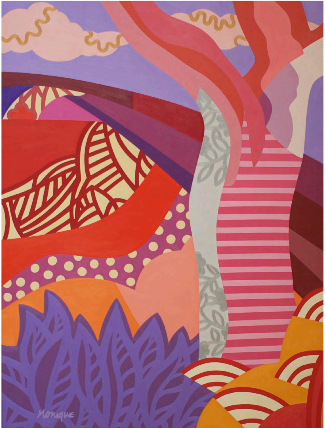
"EL HUMILDE" (The Tree of Humility) Oil on canvas, 70 x 100 cm, 2015