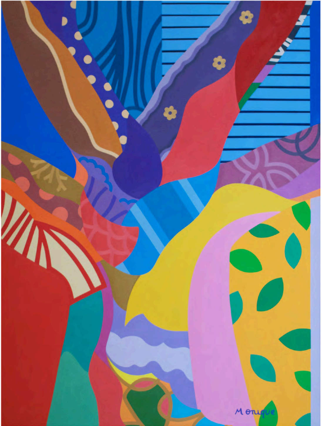
"EL PACIENTE" (The Tree of Patience) Oil on canvas, 70 x 100 cm, 2015