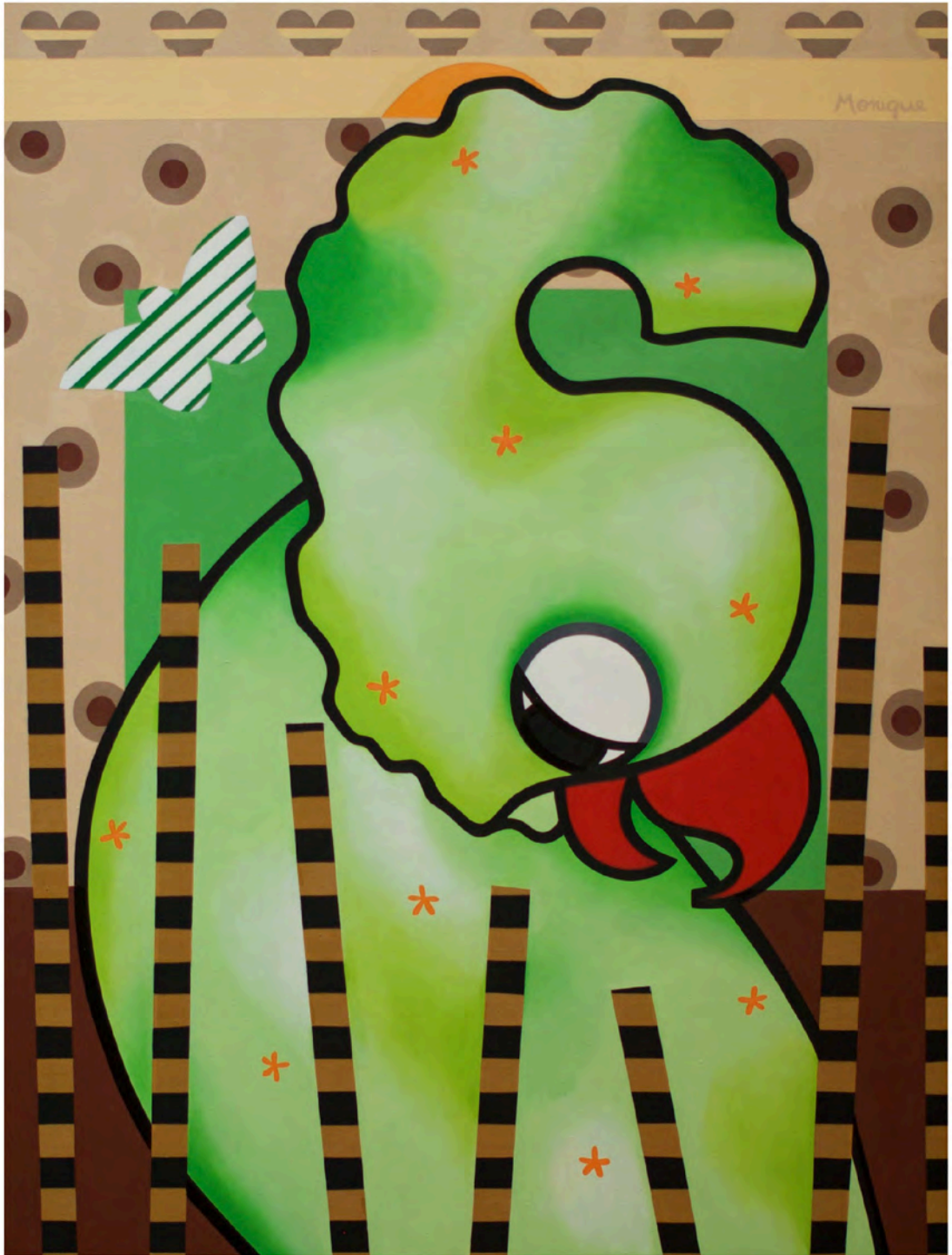
"LA TACAÑA" (The Stingy Parrot) Oil on canvas, 70 x 100 cm, 2015