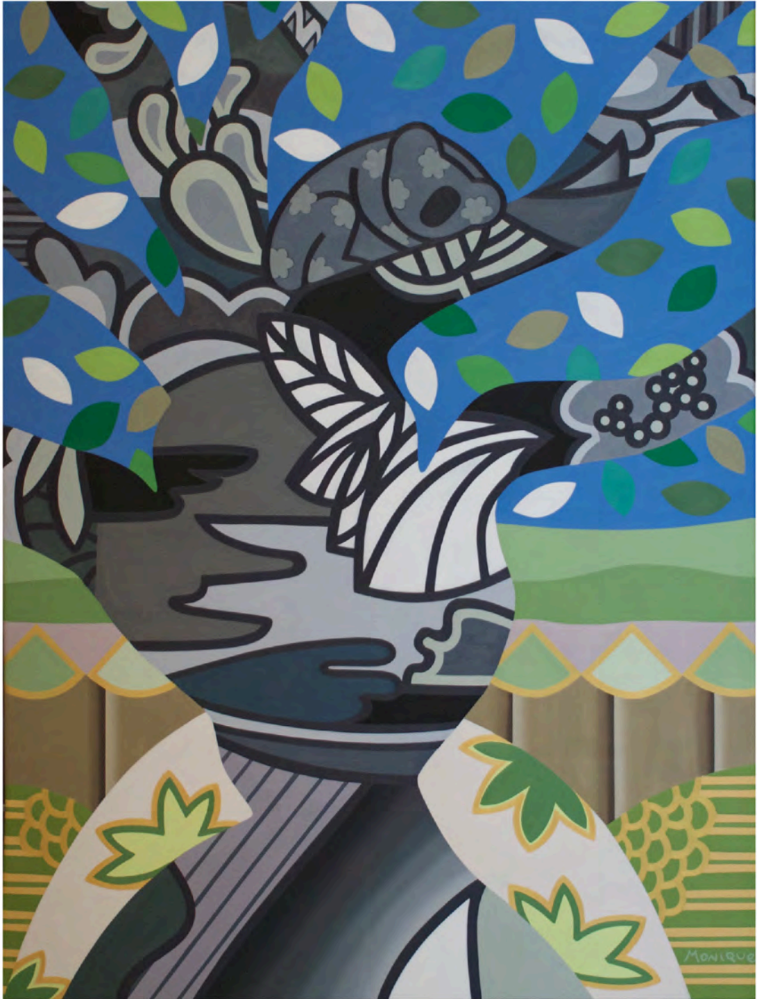
"EL GENEROSO" (The Tree of Kindness) Oil on canvas, 70 x 100 cm, 2016