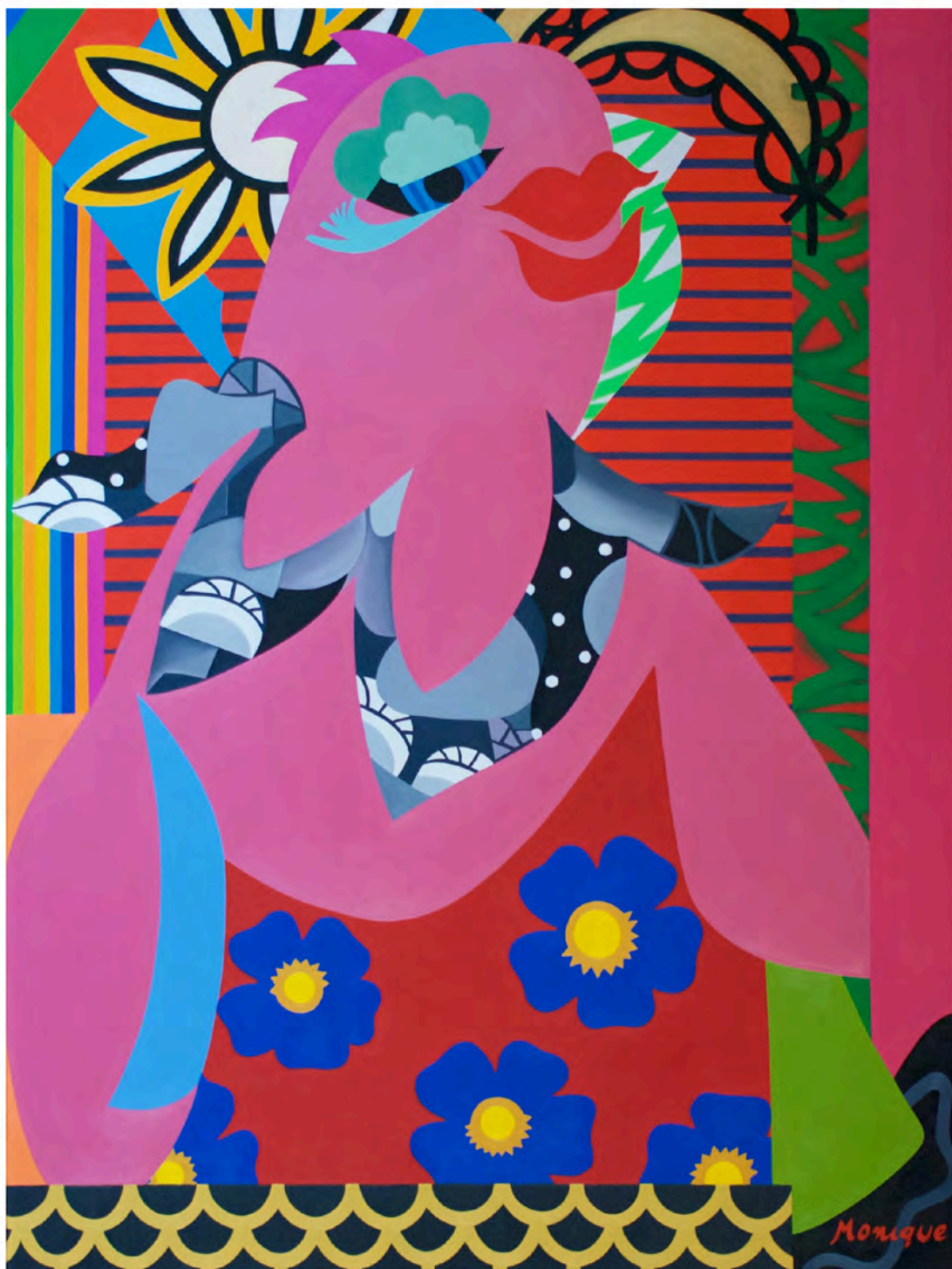
"LA GLOTONA" (The Glutton Parrot) Oil on canvas, 70 x 100 cm, 2013