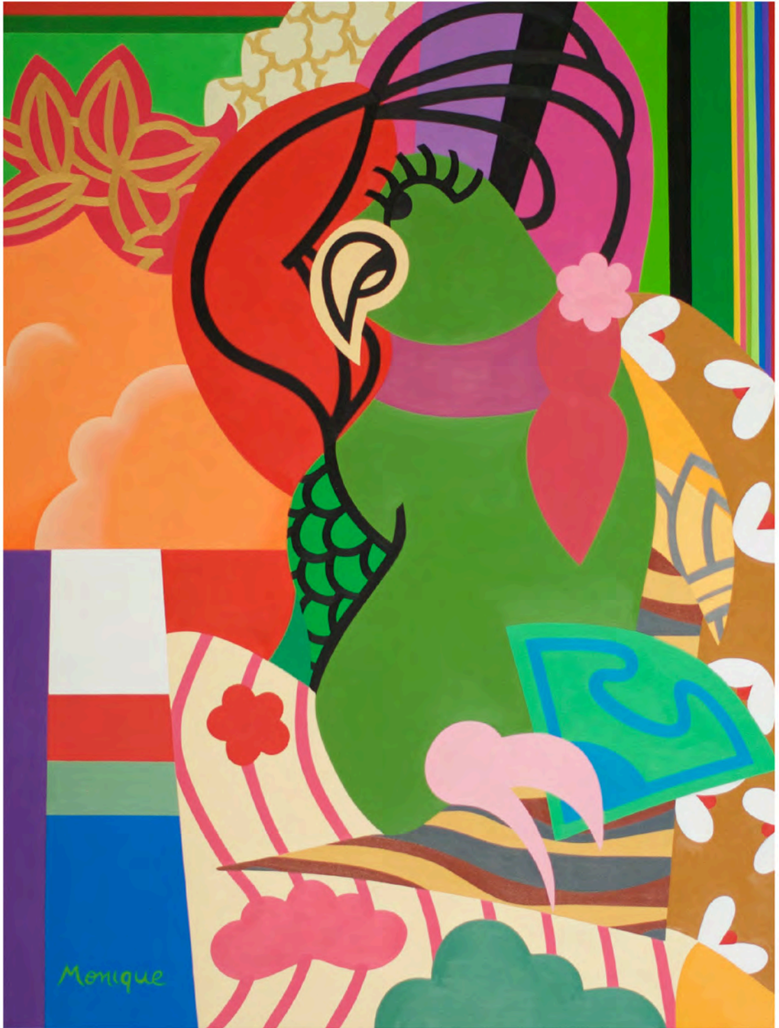
"LA COLÉRICA" (The Wrathful Parrot) Oil on canvas, 70 x 100 cm, 2014