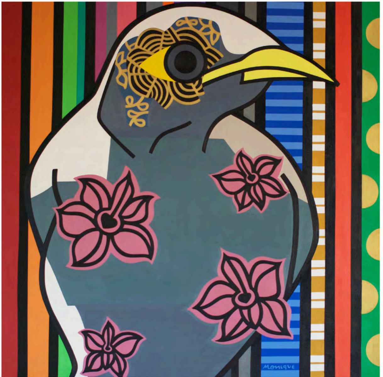
"Sr. Mainer, el portero" (Mr. Miner, the bouncer) Oil on canvas, 100 x 100 cm, 2016