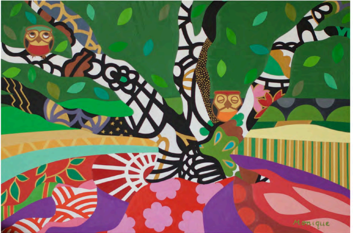
"EL ARBOLITO DE LA SABIDURÍA " (The Wisdom Tree) Oil on canvas, 91,5 x 61 cm, 2014