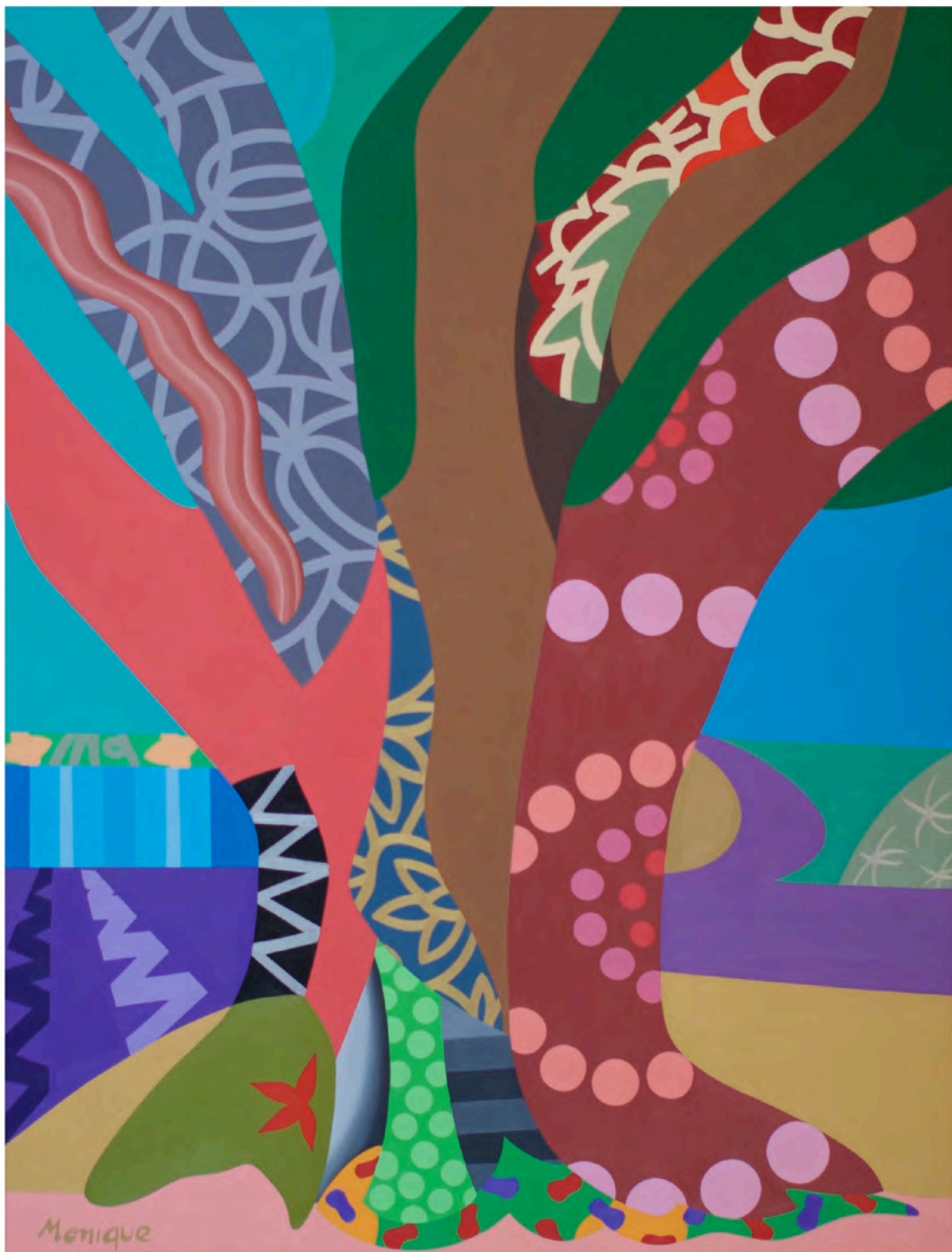
"EL CARITATIVO " (The Tree of Charity) Oil on canvas, 70 x 100 cm, 2014