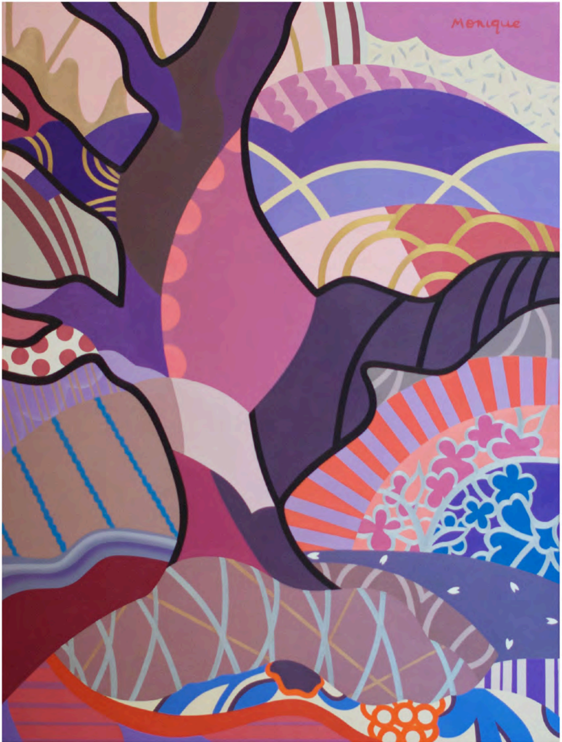
"EL CASTO" (The Tree of Chastity) Oil on canvas, 70 x 100 cm, 2016