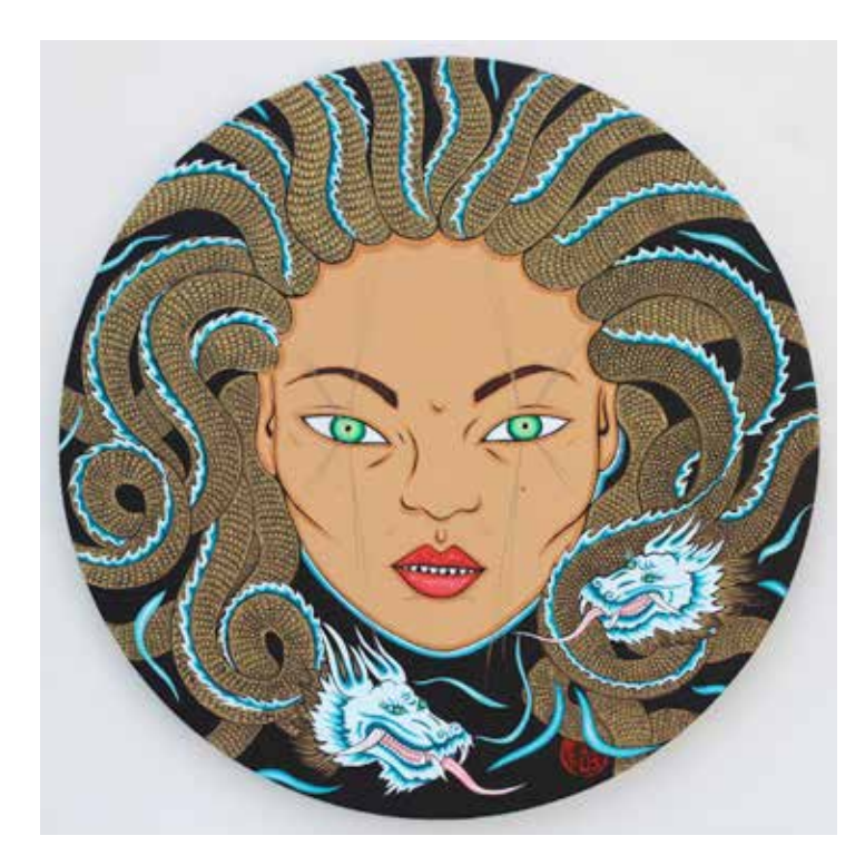
Kate Beynon Transfigured Gorgon (from the Trans-Mythic Woman Warrior series) 2012, acrylic paint and Swarovski crystals on carvas.

historically in history, myth and poetry. "Medusa became the only mortal among three Gorgon sisters. The adjective gorgos (gorq'j) means 'terrible', 'fierce', and 'frightful'."4 For Beynon, the Gorgon Medusa is cast into the gaze of multicultural Australia and the world. She is a hybrid figure capable of seeing and perceiving; she has the power to meet that gaze, to deconstruct, to subsume and to overthrow objectification, misogyny, and all forms of prejudice/discrimination/ hatred with anti-bigotry powers that "turn only bigots to stone". In this phrase and gesture, the artist reveals the racist potential in contemporary life. Transfigured Gorgon may symbolically represent the migrant or the subaltern, or any marginalised hybrid being, whose very existence is as threatening, "terrible, fierce or frightful" as the mythical Medusa, to those in society frightened by the experience of "other",