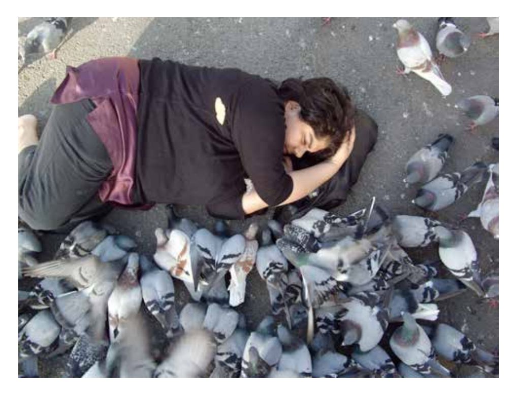
Sonia Khurana Logic of Birds 2006 (video still), single-channel video, 2 min (looped).

as landscape". We view the figure with the "logic of birds" in a gendered space that is integrative and inclusive. Khurana describes this portrayal of her body explaining,