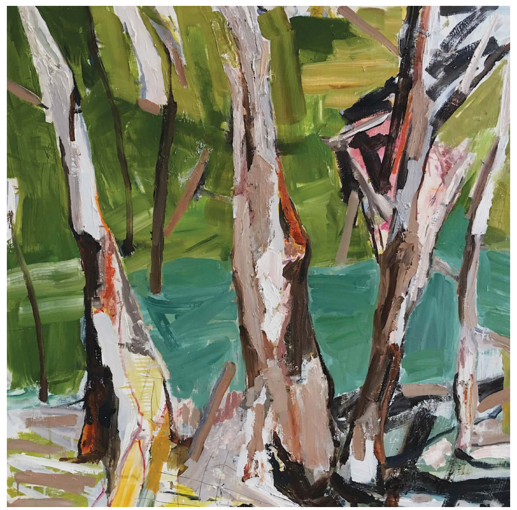
Paperbark Stand, Oil & mixed media on board, 93 x 93cm

Exhibition Dates 29 August – 23 September 2017