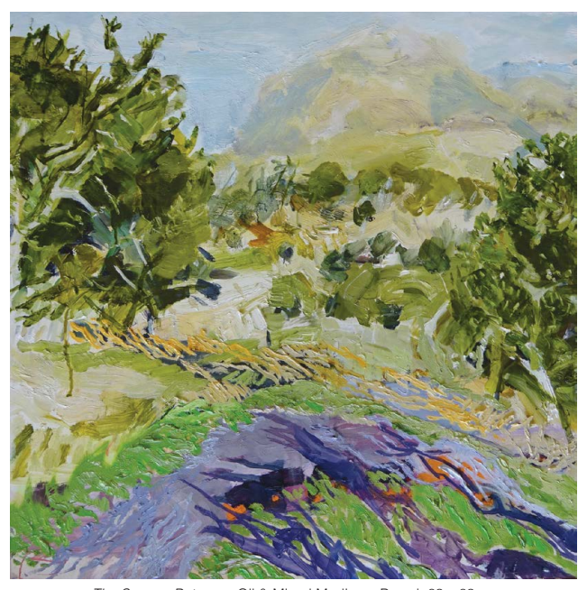
The Spaces Between, Oil & Mixed Media on Board, 62 x 62cm