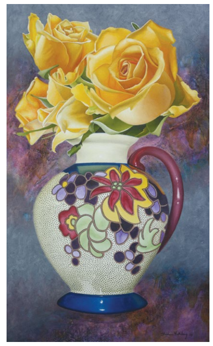
The Gold Standard 2017 Oil on canvas, 75 x 45 cm