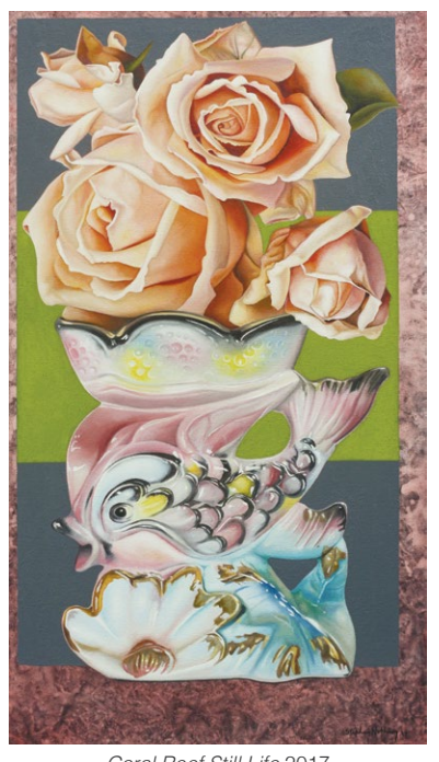
Coral Reef Still Life 2017 Oil on canvas, 88 x 50 cm