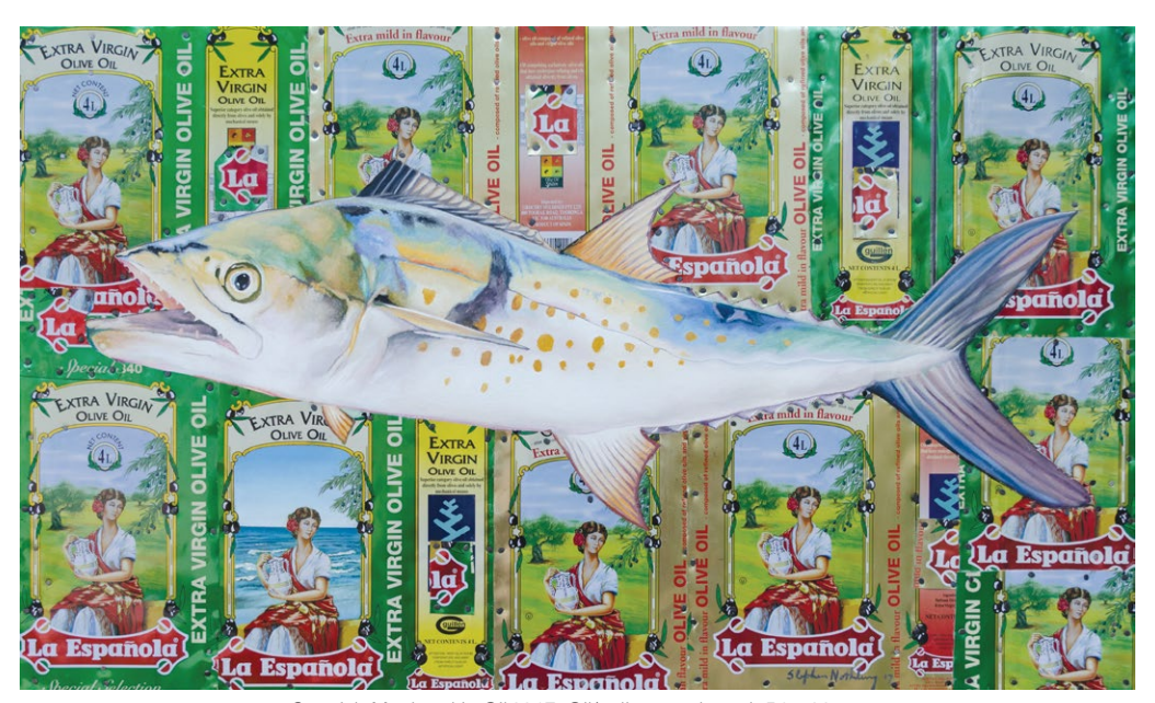
Spanish Mackerel in Oil 2017, Oil/collage on board, 54 x 90 cm

613 Stanley Street Woolloongabba Qld 4102 Australia Tue–Fri 9am–5pm Sat 9am–3pm ~ +61 7 3891 5551 ~ email@wag.com.au