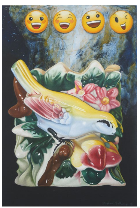
Memorandum of Understanding 2018 Oil on board, 60 x 40 cm