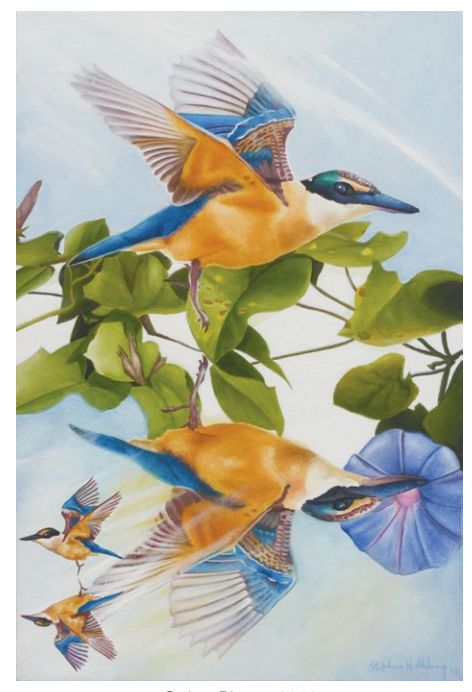
Going Places 2018 Oil on board, 60 x 40 cm