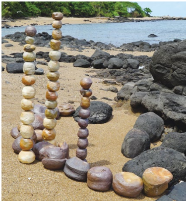
Erub Artists Sai Sai Le (people of the fishtraps) 2018 Ceramic 120 x 120 x 240cm

Many of the basalt rock formations on the island have significance in human legends as the people appear to merge with their surroundings as humans and the rock of the island become one. This is evident in the