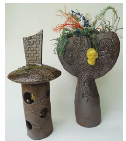
Jimmy Kenny Thaiday Ares Le Era Weku (Warriors' Anger) 2018 Ceramics, natural fibres, ghost net 50 x 30 x 16cm