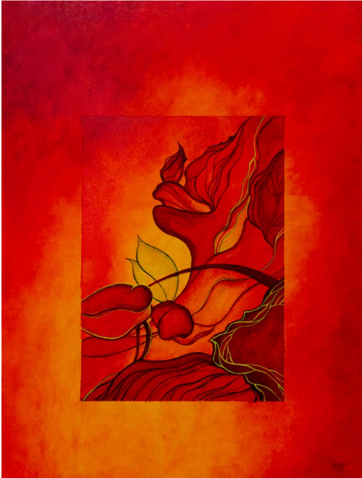
4. Penelope Grills Cooktown Orchid No.2 2018 Oil on Ampersand Gessobord™ 30 x 23 cm $350 (framed)