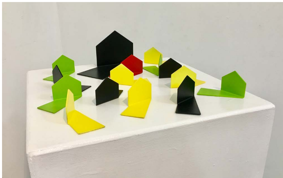
Sara Manser Small Houses 2018 Steel and acrylic paint 4.5 (H) x 8.5 (W) x 5.5 (D) cm $65 each