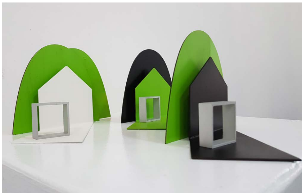
Sara Manser Are we there yet!? ( House and Hillock ) 2018 Steel, aluminium, acrylic paint and magnets 12.5 (H) x 16 (W) x 11 (D) cm $190 each