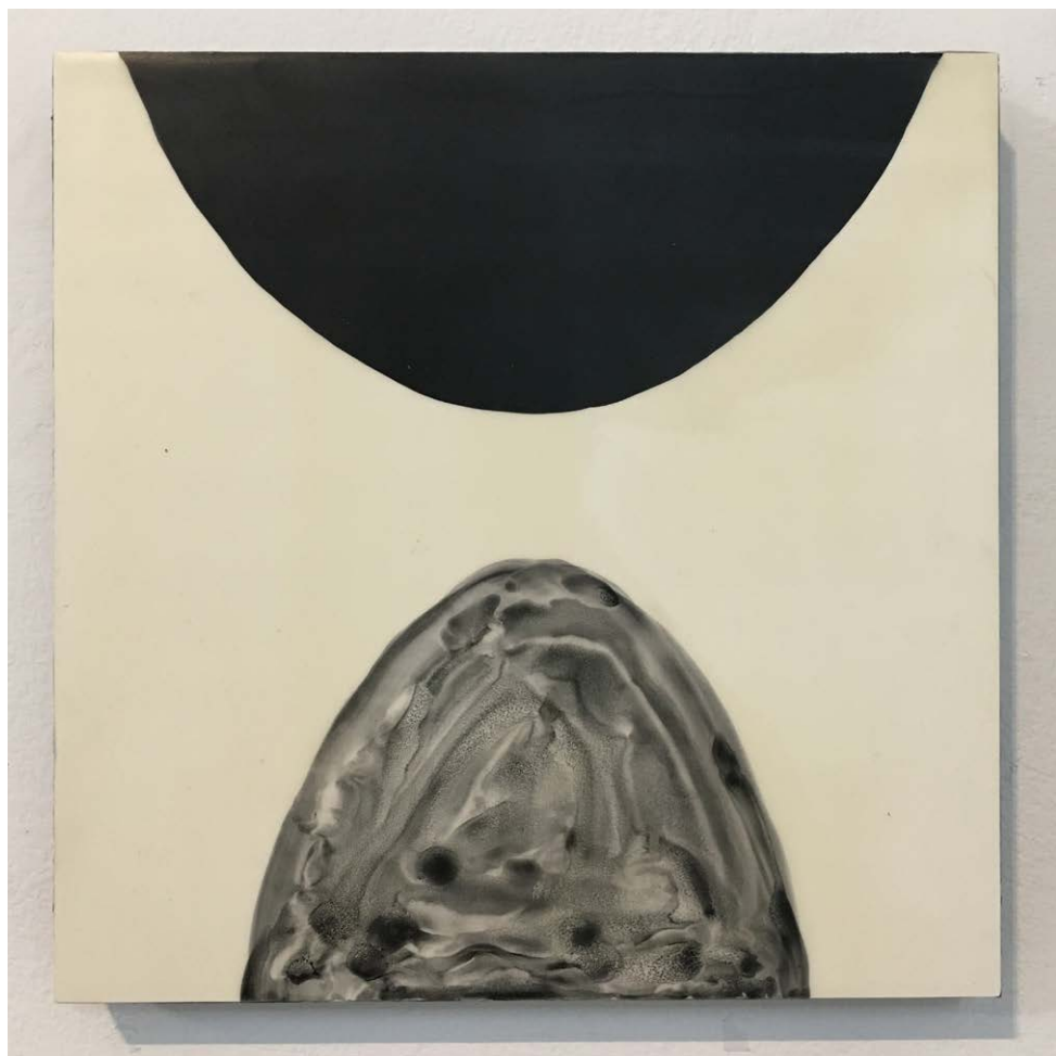
Sara Manser This is us 2018 Watercolour, ink and wax on Ampersand Claybord panel. 20 x 20 cm $210