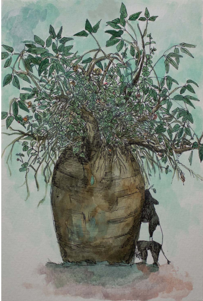
6. Kazumi Daido Lantanas in Boab tree pot 2018 Ink and watercolour on paper 25 x 17.5 cm $110 (unframed)