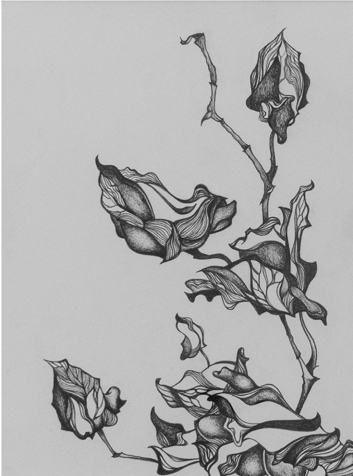
6. Penelope Grills Cooktown Orchid No.4 Study 2018 Pencil on gessoed watercolour paper 30 x 23 cm $300 (framed)