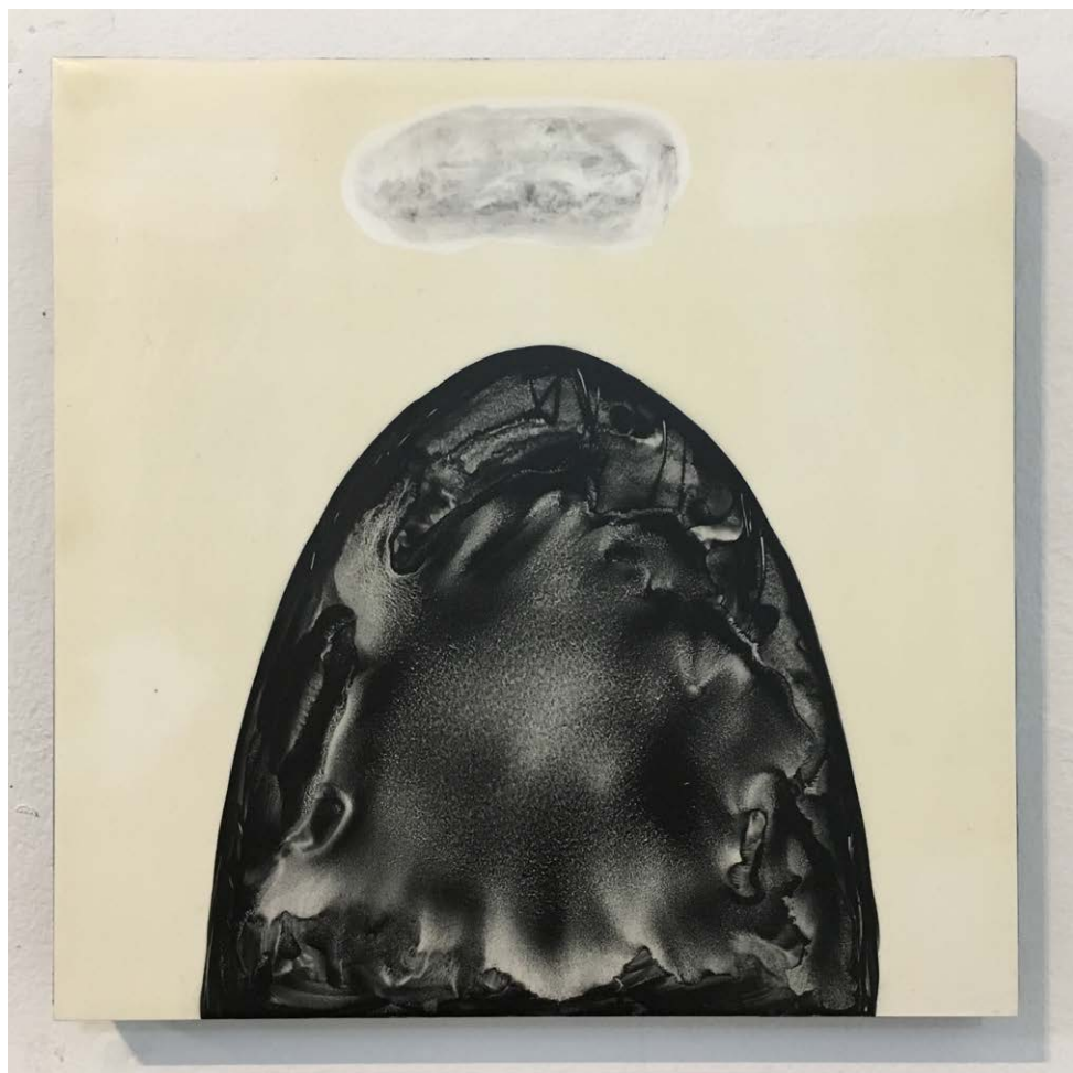
Sara Manser Alone 2018 Watercolour, ink and wax on Ampersand Claybord panel 20 x 20 cm $210