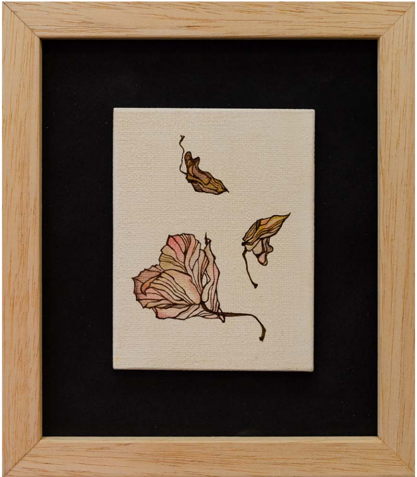
7. Penelope Grills Cooktown Orchid No.6 2018 Oil on board 10 x 7.5 cm $160 (framed)