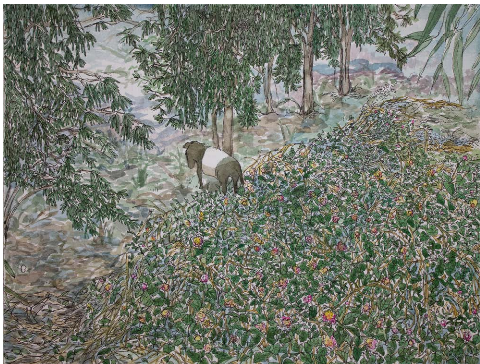
1. Kazumi Daido Lantanas and Baku Cow (Milk wood) 2018 Ink and watercolour on paper 25 x 35 cm $220 (unframed)