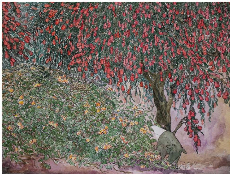
4. Kazumi Daido Lantanas and Baku Cow (Bottle Brush) 2018 Ink and watercolour on paper 25 x 35 cm $220 (unframed)