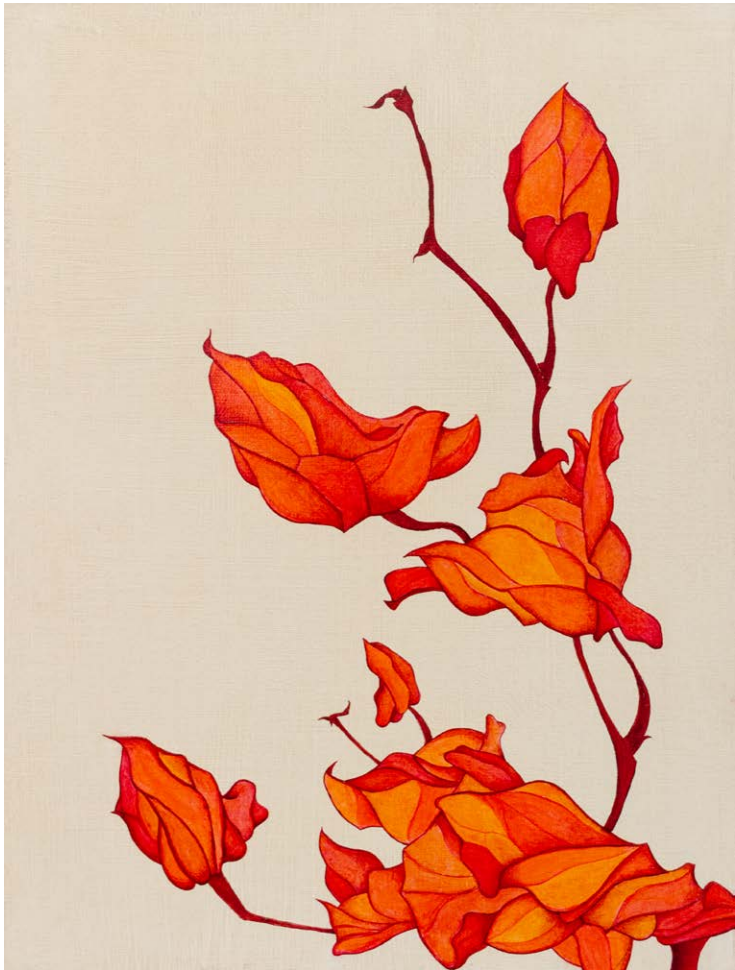
2. Penelope Grills Cooktown Orchid No.4 2018 Oil on Ampersand Gessobord™ 30 x 23 cm $350 (framed)