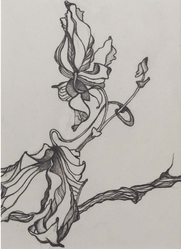
1. Penelope Grills Cooktown Orchid No.5 Study 2018 Graphite on paper 12.6 x 17.3 cm $100 (framed)