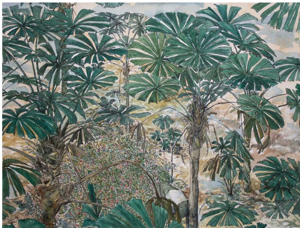
3. Kazumi Daido Lantanas and Baku Cow (Australian Fan Palm 1) 2018 Ink and watercolour on paper 25 x 35 cm $220 (unframed)