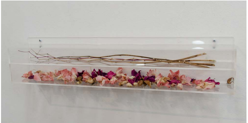
9. Penelope Grills Moth Orchids 2018 Varnished flowers in acrylic box 11 x 55 x 9cm $200