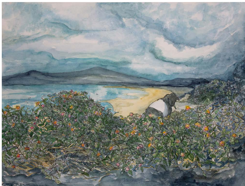
2. Kazumi Daido Lantanas and Baku Cow (Beach) 2018 Ink and watercolour on paper 25 x 35 cm $220 (unframed)