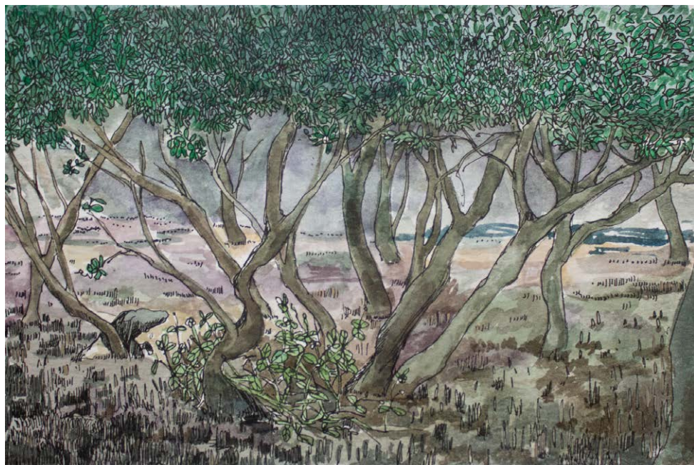
7. Kazumi Daido Lantanas and Baku Cow (Grey Mangrove) 2018 Ink and watercolour on paper 17.5 x 25 cm $110 (unframed)