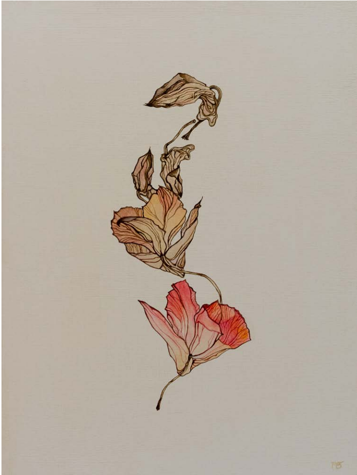
8. Penelope Grills Cooktown Orchid No.3 2018 Oil on Ampersand Gessobord™ 30 x 23 cm $350 (framed)