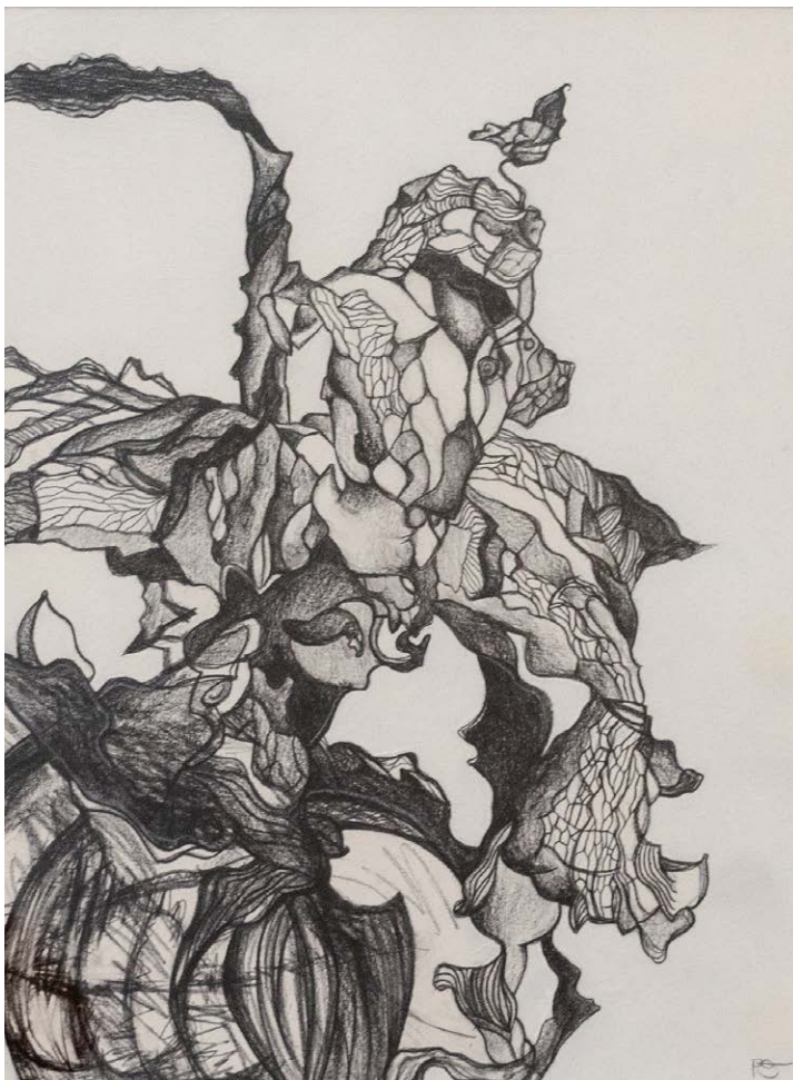
5. Penelope Grills Cooktown Orchid No. 1 Study 2018 Pencil on gessoed watercolour paper 30 x 23 cm $300 (framed)