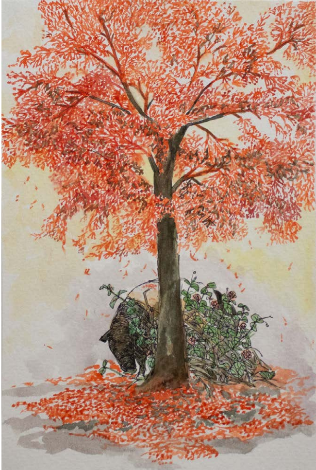
8. Kazumi Daido Lantanas and Baku Cow (Flame Tree) 2018 Ink and watercolour on paper 25 x 17.5 cm $110 (unframed)