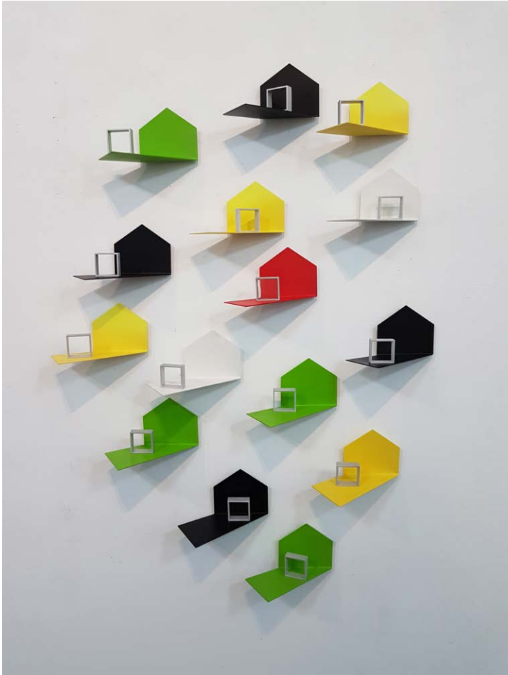
Sara Manser YOU ARE HERE 2018 Steel, aluminium, and acrylic paint 15 pieces, each 9 (H) x 17 (W) x 11 (D) cm $155 each