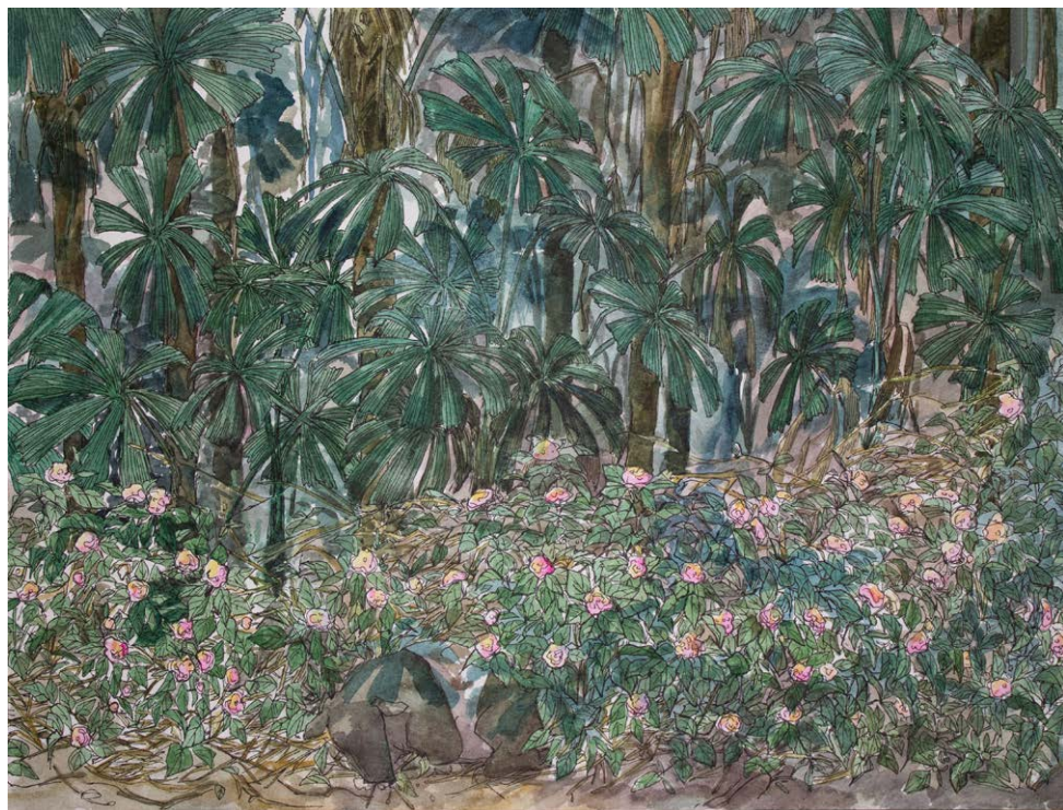
5. Kazumi Daido Lantanas and Baku Cow (Australian Fan Palm 2) 2018 Ink and watercolour on paper 25 x 35 cm $220 (unframed)