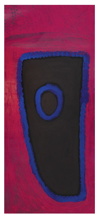
#206-18 My Father's Country 2018 Acrylic on canvas, 137 x 61 cm