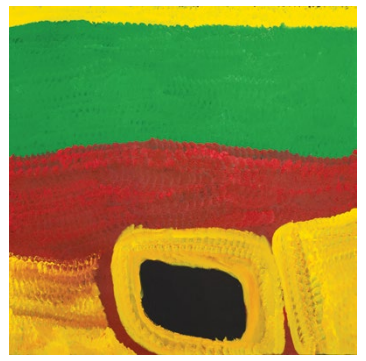
#484-18 My Country 2018 Acrylic on canvas, 91 x 91 cm