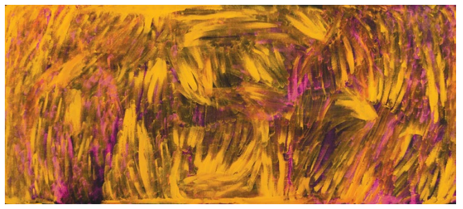
#588-18 Morning Glory 2018, Acrylic on canvas, 61 x 137 cm