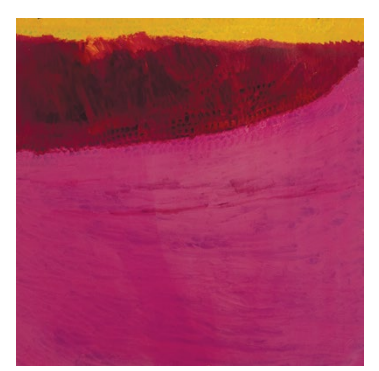
#396-18 My Country 2018 Acrylic on canvas, 101 x 101 cm