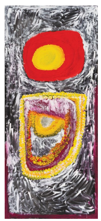
#463-18 My Country 2018 Acrylic on canvas, 135 x 60 cm