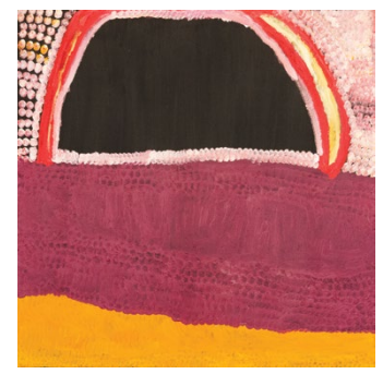
#16-19 My Country 2019 Acrylic on canvas, 91 x 91 cm