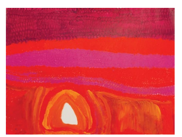
#710-18 My Country 2018 Acrylic on canvas, 75.5 x 102 cm

Our families came together through initiation. They taught us to hunt for oysters and how to roll grass for string into dilly bags. We used to sit on the floating logs like a raft.