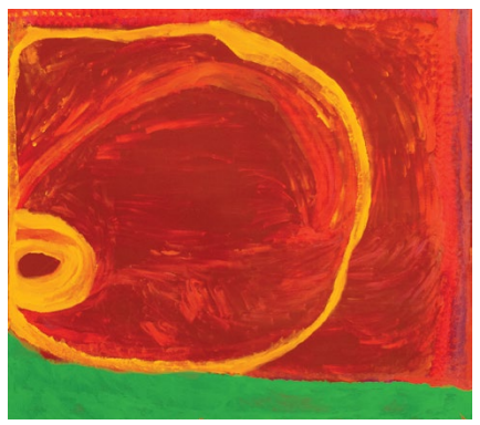
#20-19 My Country 2019 Acrylic on canvas,121 x 136 cm