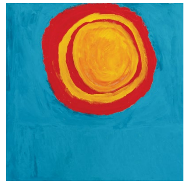
#300-18 My Country 2018 Acrylic on canvas, 91 x 91 cm