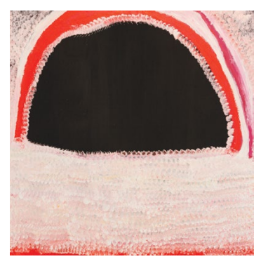
#14-19 My Country 2019 Acrylic on canvas, 90 x 90 cm