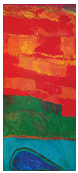
#45-18 My Country 2018 Acrylic on canvas, 134 x 59 cm