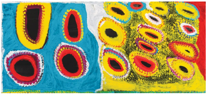
#10766-17 Oaktree Point 2017, Acrylic on canvas, 60 x 134 cm