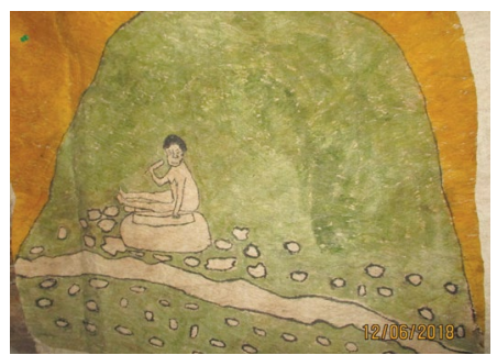
The beating of the first Omie bark on Mt Obo.