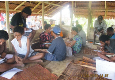
Everybody worked hard for the two day cataloguing workshops at Savodibehi.