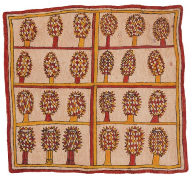
Sixtus Kesi Bisija – warriors' clubs