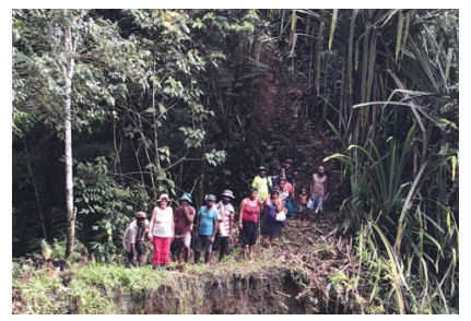
Many people helped on the track to various villages, carrying tapa and food and protecting us all. Here we are on the way to to Savodibehi village.