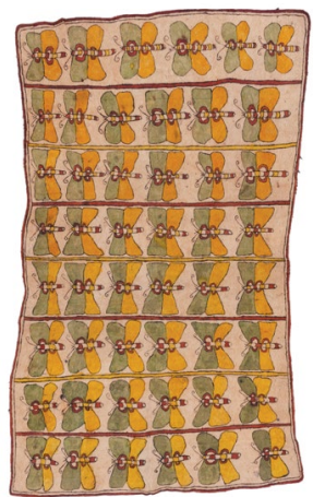
Columber Sorame Viojoje – butterfly