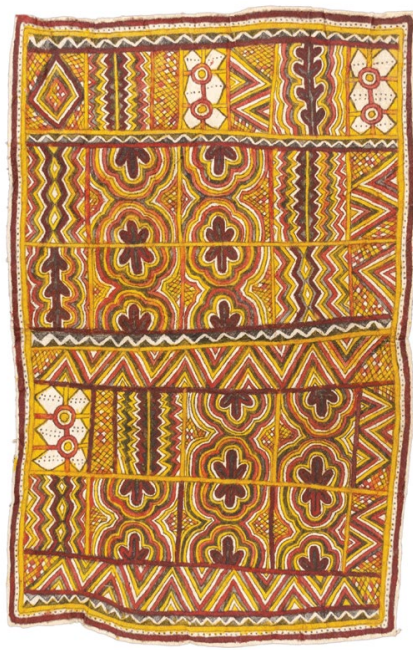
Lila Warrimou Mahu vahoje – Pig Foot print