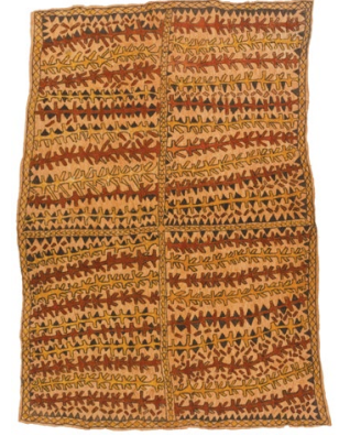
Jeremiah Siranumi Hojihane jaje – drum making tree and branches