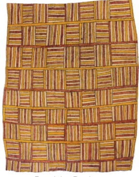
Bettrisha Boujugo Ijeredime'e – sugar cane sections