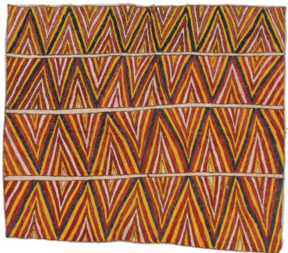
Honestmus Ugiobari Hon'e Sopr'e – aerial view of cut bamboo design