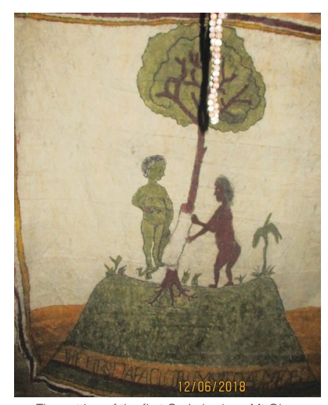
The cutting of the first Omie bark on Mt Obo.

This has in turn however enabled them to continue to reinvigorate certain cultural practices in semi isolation. Where once the carving of bamboo pipes and the elaborate tattooing sor'e of young men at initiation ujawe , were the major art forms this was changing by the 1960s when the men reconsidered their position and started to transfer secret, sacred knowledge to the women, the makers of nioge (in their language), tapa in English. (The word tapa now generic in English for beaten bark cloth derived from Capt. Cook's expeditions in the Pacific where the word kappa means to beat in Hawaiian and tapa in Tongan was a part of the larger design of beaten bark cloth.)