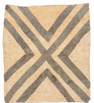
Honestmus Ugiobari Mododa'e Diburi'e Bioje'pho – tail feathers of the swift bird