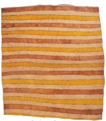
Didimus Boujugo Aiha Roha'e – traditional design of a leader's cloak