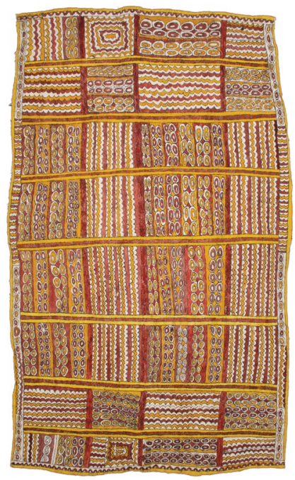
Jacklyn Daiva Rubuno Niovade Ujosisu'e

With the cessation of the very complex, resource demanding, long term preparations for the ujawe for young men in a rapidly changing world, the unusual transference of knowledge to the women promoted them as the main material cultural producers and keepers of Omie heritage, thus altering gendered perspectives. Now however, a small and increasing number of men have started to produce tapa. Gender specific art forms are breaking down all over PNG because people have had to enter and maintain a presence in the cash economy - school fees. medicine, transport, marriages, funerals, clothing etc. despite the fact that approx. 80% of PNG's population still remain in and maintain their village and subsistence farming life styles. So in line with this development several male tapa artists are included for the first time, in this exhibition.