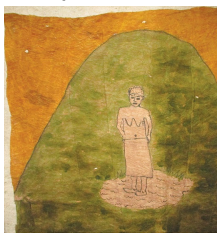
The wearing of the first nioge - tapa on Mt Obo.