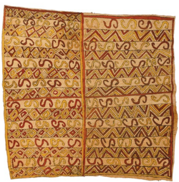
Ananas Oviro Mijome – body tattoo and water vine