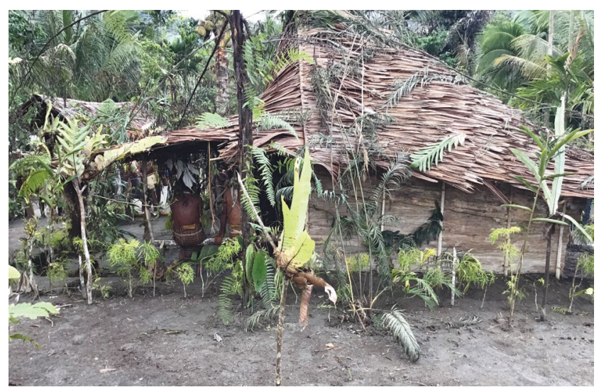
The new Sidoraje (Clan) Museum at Savodibehi village opened on 12 June 2018 after three days of workshops teaching Omie people about the international indigenous art market industry they had entered with little knowledge.

Front image: Rosemary Isodi Enebiriri Buroriane, Burom Deje – hornbill beaks and lizard backbone Inner front & back cover image: The welcoming procession for the opening of the new Sidoraje (clan) Museum at Savodibehi village, Omie Territory, Oro Province, PNG 12 June 2018. This clan sido has the Bird of Paradise as it's clan emblem.