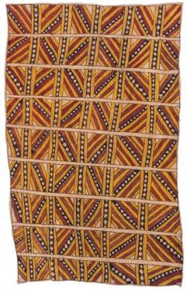
Joyce Uttamo Sihae – sandalwood tree