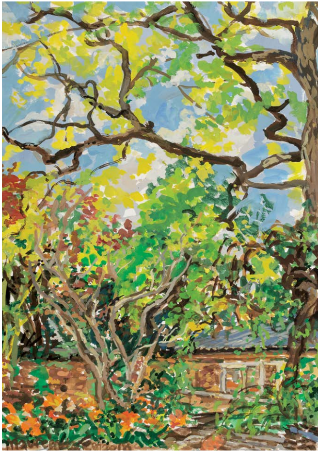
Autumn Backyard Toowoomba 2018 Gouache on paper, 41 x 30 cm (#MH8290)