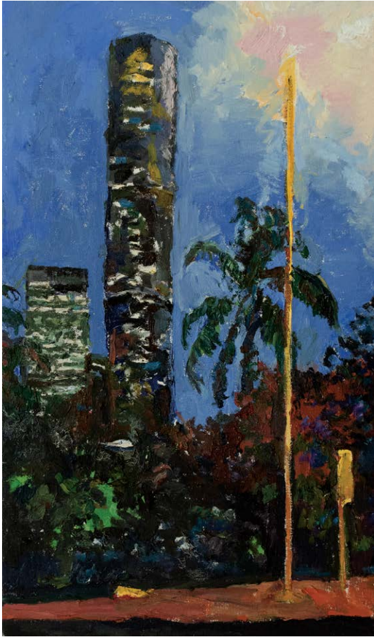
Petrie Terrace Street Lights 2015 Oil on Belgian linen, 71 x 42 cm (#MH8391)