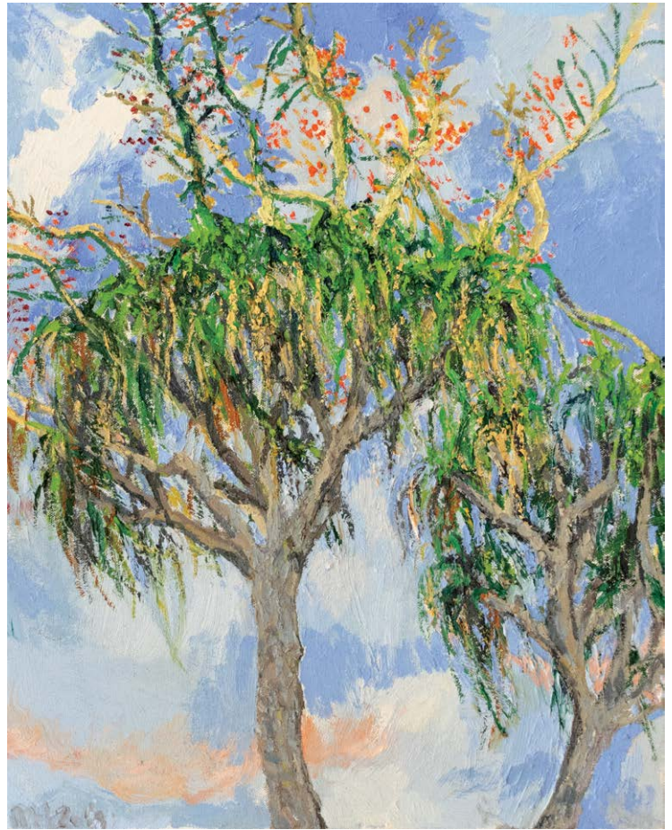
Ponytail Tops 2019 Oil on canvas, 51 x 41 cm (#MH8397)