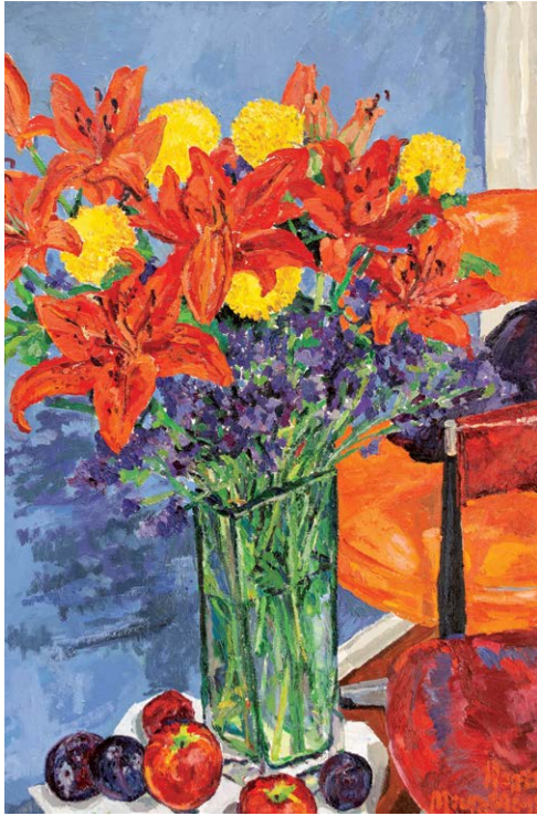
Tomato Red Lilies & Plums 2018 Oil on canvas, 91.5 x 61 cm (#MH8288)