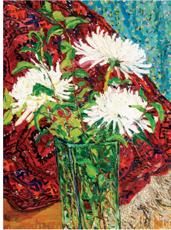
White Persian Chrysanthemums 2017 Oil on canvas, 77 x 57 cm (#MH8284)

cover: Day Brisbane City 2017 , Oil on canvas, 35 x 89 cm (#MH8279)