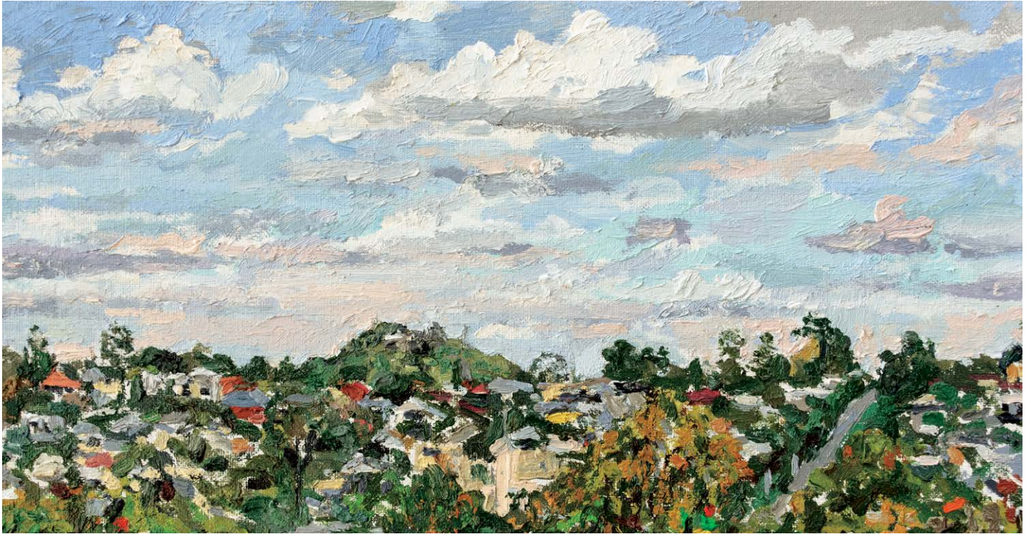
Grange View Caldera 2019 Oil on Belgian linen, 25 x 53 cm (#MH8294)