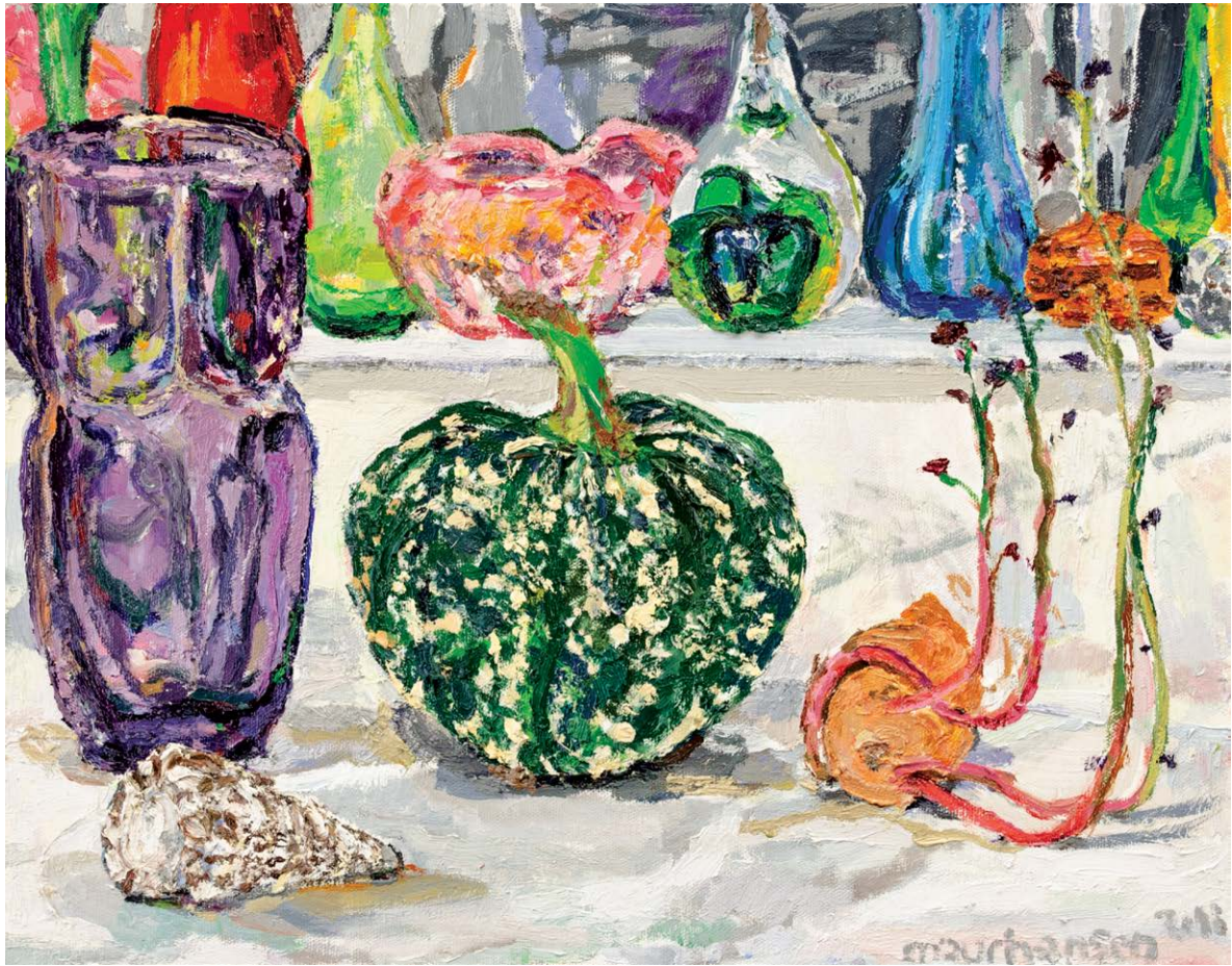
Pumpkin, Glass, Growth 2018 Oil on canvas, 36 x 46 cm (#MH8329)