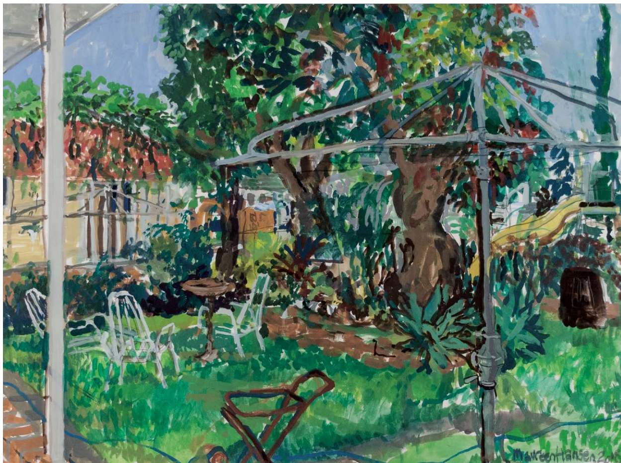
Brisbane Backyard 2018, Gouache on paper, 56 x 75 cm (#MH7186)