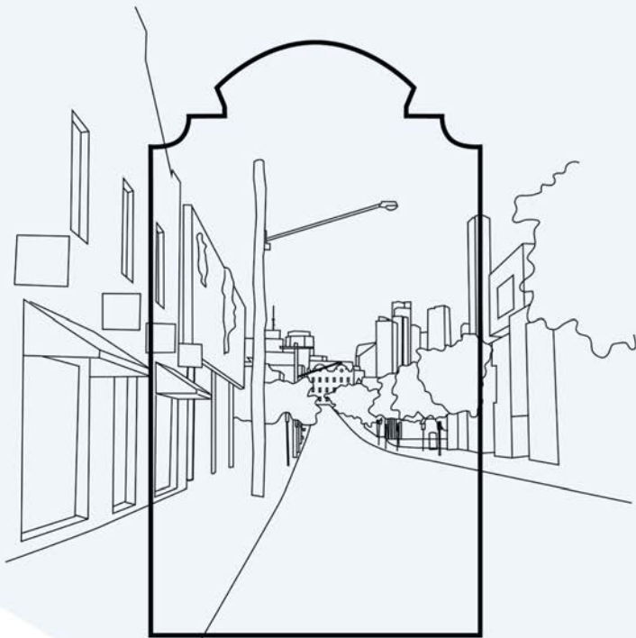
Robert Street, New Farm