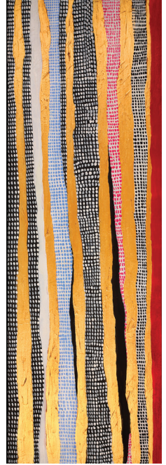
Body Markings 2012 Acrylic on canvas 152.5 x 51 cm