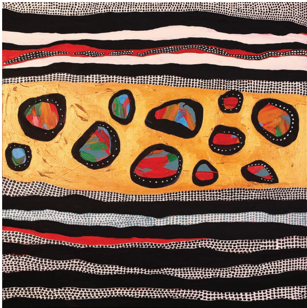
May May's Rocks 2012 Acrylic on canvas 76 x 76 cm