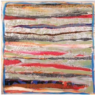
Wet Season 2012 Acrylic on canvas 76 x 76 cm

One of the most striking series are those of the rocks which abound on Bentinck Island - small flat rocks used in the game of skimming across the water, half submerged large rocks to which an abundance of oysters cling and a great variety of larger rocks used by the Island's Kayardild people to make stone traps to entrap fish and other sealife for easy catching.