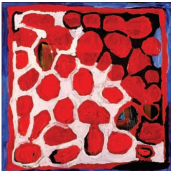
Red Rocks on Bentinck 2012 Acrylic on canvas 61 x 61 cm

The younger Moodoonuthi speaks fondly and with great clarity of the grandmother she calls 'May May' and the hunting, fishing, and grass gathering trips they went on regularly, while living a 'sea country' life together.