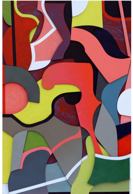
Radicle Cut 2 2020 Synthetic polymer on plywood, 61 × 41 cm