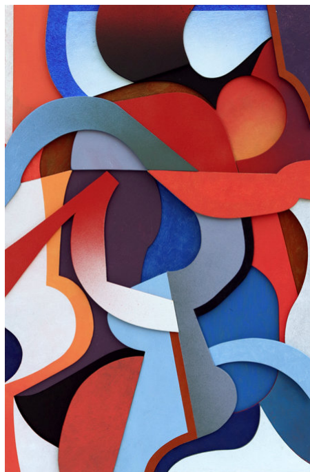
Seed 5 2020 Synthetic polymer on plywood, 46 × 30 cm