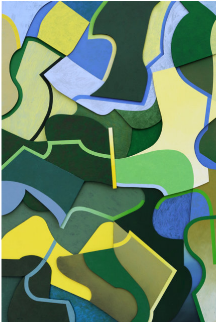
Environment 3 2020 Synthetic polymer on plywood, 80 × 53 cm