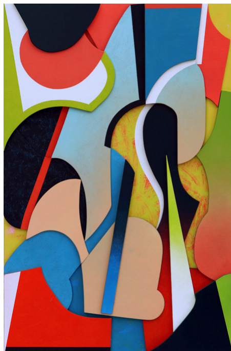
Seed 1 2020 Synthetic polymer on plywood, 46 × 30 cm