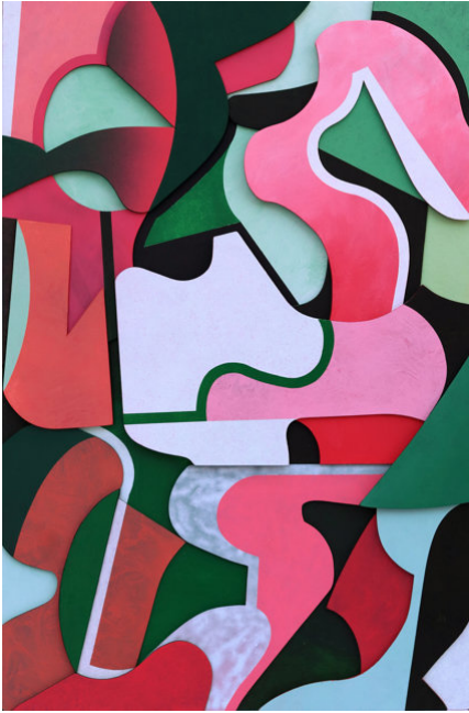
Radicle Cut 5 2020 Synthetic polymer on plywood, 61 × 41 cm