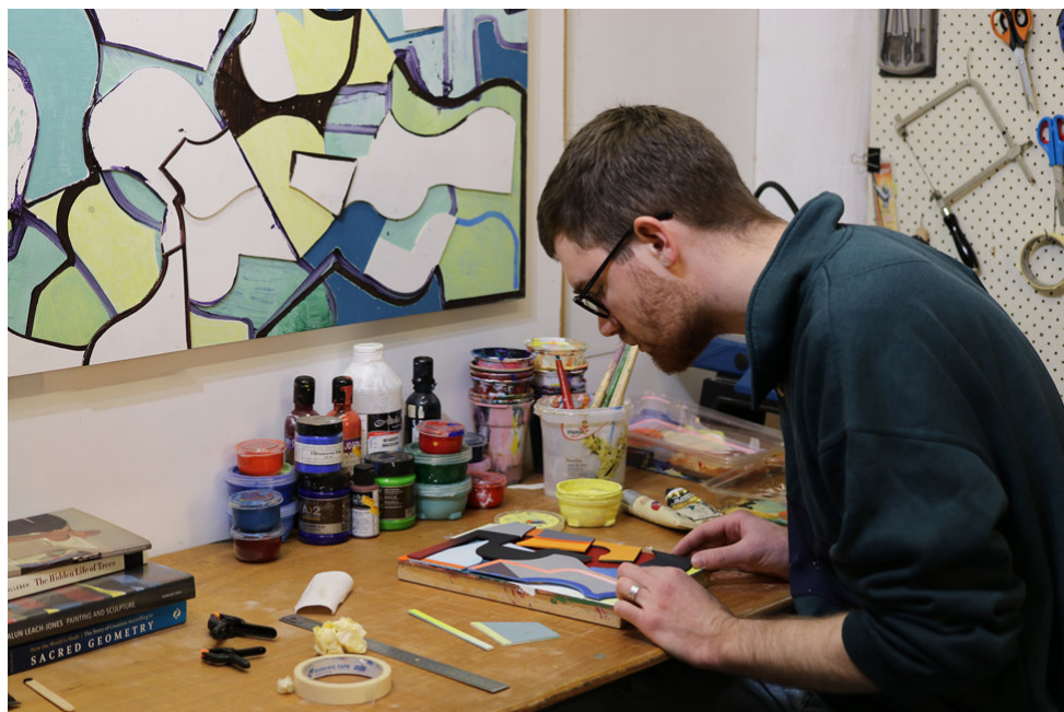
Front (detail): Radicle Cut 4 2020, Synthetic polymer on plywood, 61 × 41 cm

Exhibition dates 31 July - 29 August 2020