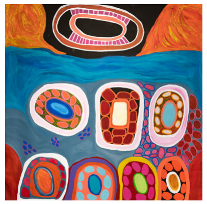
Dorothy Gabori, Stone Fishtraps , Acrylic on Belgian linen, 197 × 197 cm