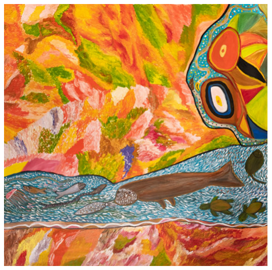
Dolly Loogatha, Thundi, Acrylic on Belgian linen, 197 × 197 cm