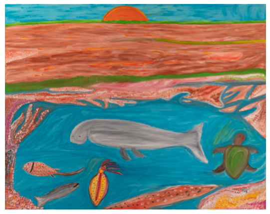
Dolly Loogatha, Kalturi, Acrylic on Belgian linen, 121.5 × 153 cm