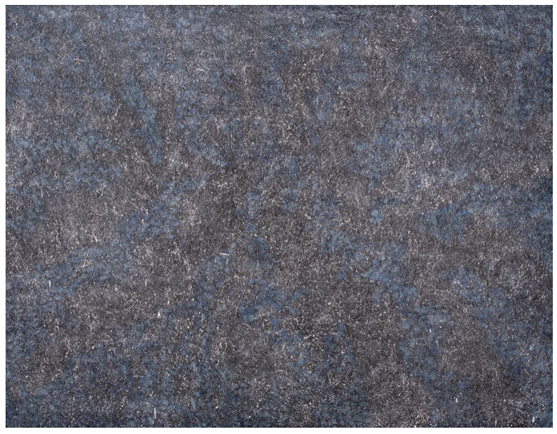
Joelene Roughsey, Thunganmu, Acrylic on Belgian linen, 152 × 197.5 cm