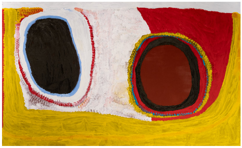
Netta Loogatha, My Country, Acrylic on Belgian linen, 122 × 198 cm