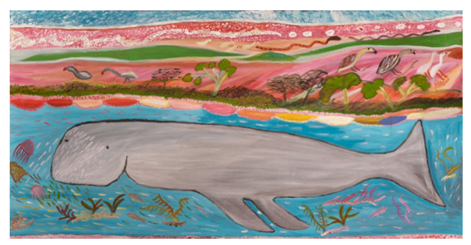
Dolly Loogatha, Thundi, Acrylic on Belgian linen, 101.5 × 198 cm