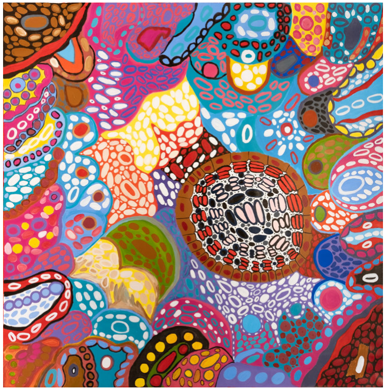
Helena Gabori, Stone Fishtraps , Acrylic on Belgian linen, 198 × 186.5 cm