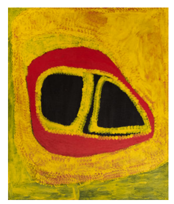
Netta Loogatha, My Country , Acrylic on Belgian linen, 121.5 × 110.5 cm