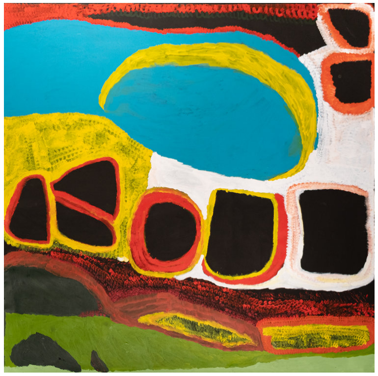
Netta Loogatha, Little Brother , Acrylic on Belgian linen, 197 × 197 cm