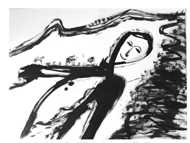
Walking the Dog 2018, Acrylic on paper, 56 \times 76 cm