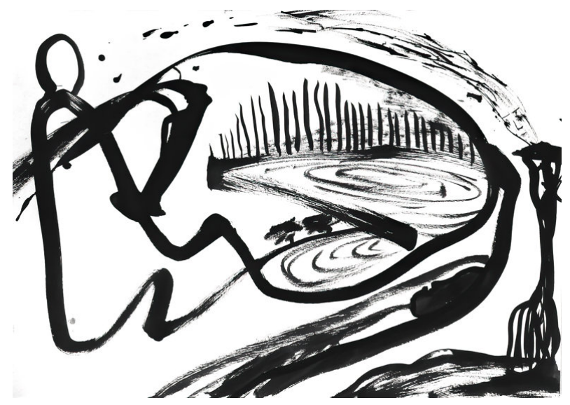
Faces within the Trees 2018, Acrylic on paper, 42 × 59 cm

Front image: The Golden Road 2018, Acrylic on paper, 70 × 100 cm