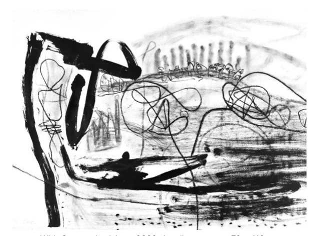
With Outstreched Arms 2020, Acrylic on paper, 79 \times 112 cm