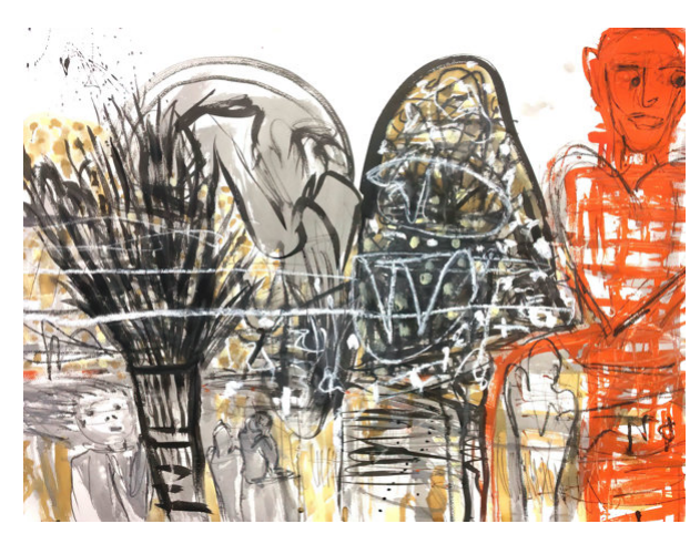
Love is blowing through the wind 2018, Acrylic on paper, 76 × 120 cm