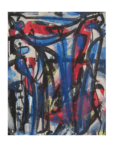
the Crimson Rosellas are in 2021 Pigment & binder on board 50 × 40cm $1,200