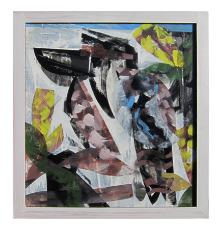
Kookaburra 2021, Enamel on board 73 × 67 cm $1,200