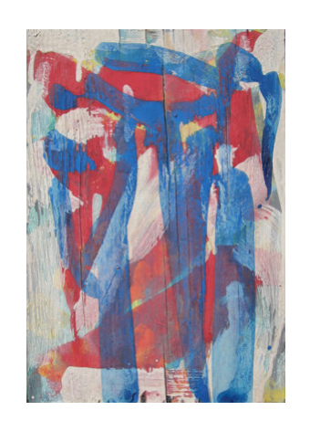
Crimson Rosellas 2021 Pigments & binder on pine 33 × 23 cm $450