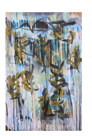
Bare Point Banksia 2021 Pigment & binder on pine 46 × 75 cm $1,400