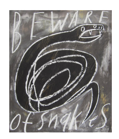
BEWARE of snakes #1 2021 Pastel on board 51 × 42 cm $750