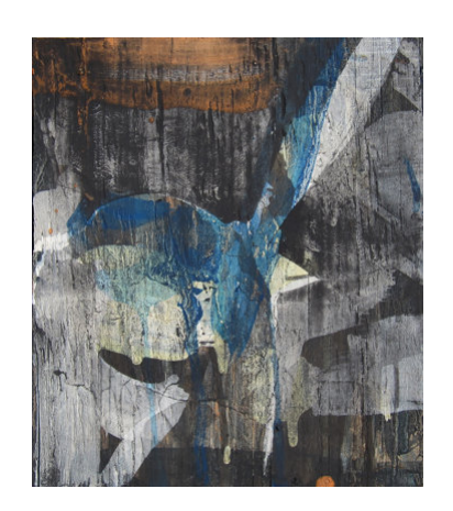
Superb Blue Fairy-wren 2021 Pigment & binder on board 22 × 19 cm $550