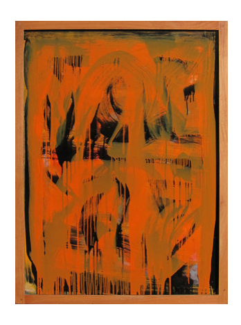
Wallabies 2021 Enamel on board 122 × 91 cm $1,900