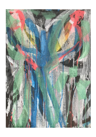
Eastern Rosellas 2021 Pigment & binder on board 69 × 48 cm $1,300