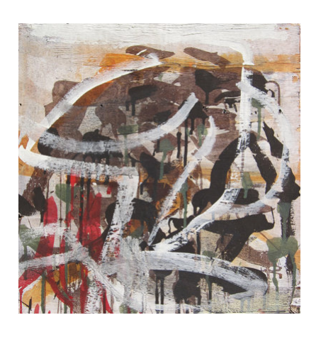
Osprey and Back creek mullet 2021 Pigment & binder on board 42 × 46 cm $1,350