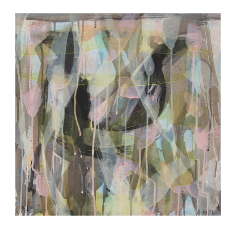
garden Magpies 2021 Pigment & binder on board 49 × 49 cm $1,350