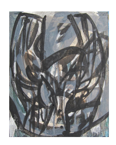
Grey Crowned Babblers 2021 Pigment & binder on board 33 × 26 cm $650