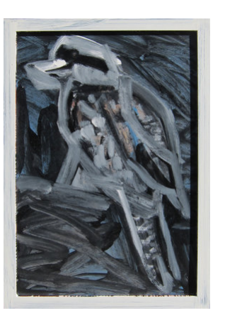
The largest of the Kingfishers 2021 Enamel on board 97 × 67 cm $1,600