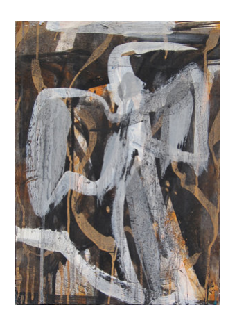
Australasian Darter 2021 Pigment & binder on board 45 × 32 cm $650