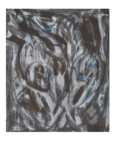
the Babblers 2021 Pigment & binder on board 51 × 40 cm $1,200