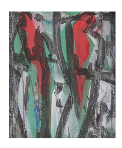
King Parrots 2021 Pigment & binder on board 51 × 41 cm $1,200