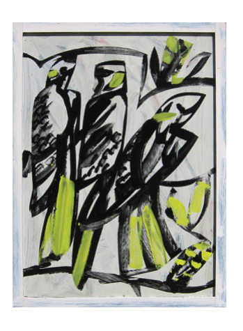
Yellow-tailed Black Cockatoo x3 2021 Enamel on board 110 × 81 cm $1,900