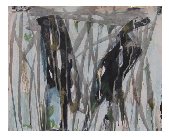
Magpies in the long grass 2021, Pigment & binder on paper 41 × 51 cm $1,200