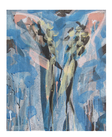
Rosellas 2021 Pigments & binder on board 50 × 40 cm $1,200