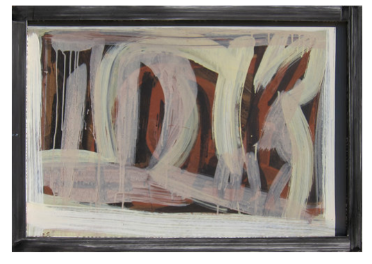
Wallaby 2020 Pigment & binder & enamel on board 67 × 97 cm $1,600