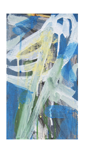
Budgie 2021 Pigment & binder on board 19 × 33 cm $450