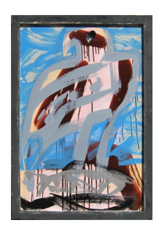
Osprey and Bream 2021, Enamel on board 97 × 67 cm $1,600