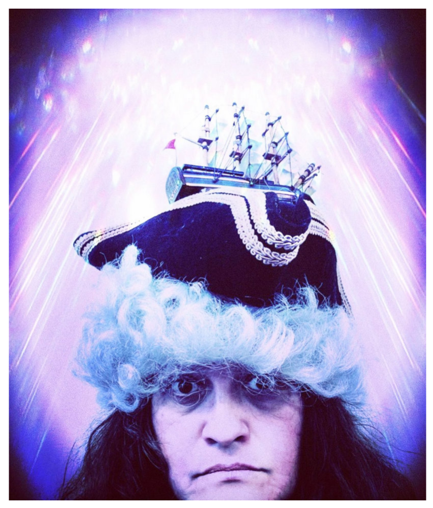
Another day on the Colony 2022 Digital photograph, image size A3 - framed 50.8 \times 40.6 cm

A selection of artworks from Bianca Beetson's exhibition, "Past, present, future".