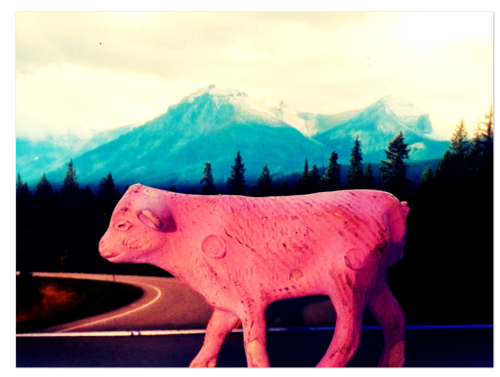
You are not from around here are you 2015 Digital photograph, image size A2 - framed 70 \times 50 cm