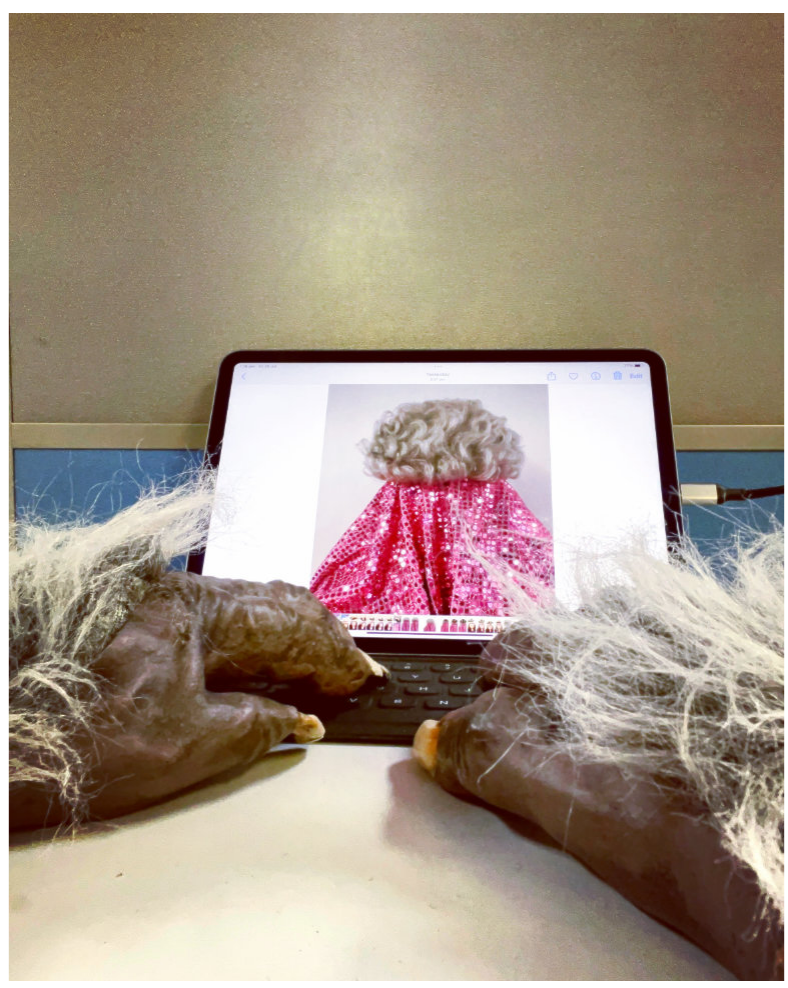
Making monsters of men 2022 Digital photograph, image 30 \times 30 cm - framed 40.6 \times 40.6 cm