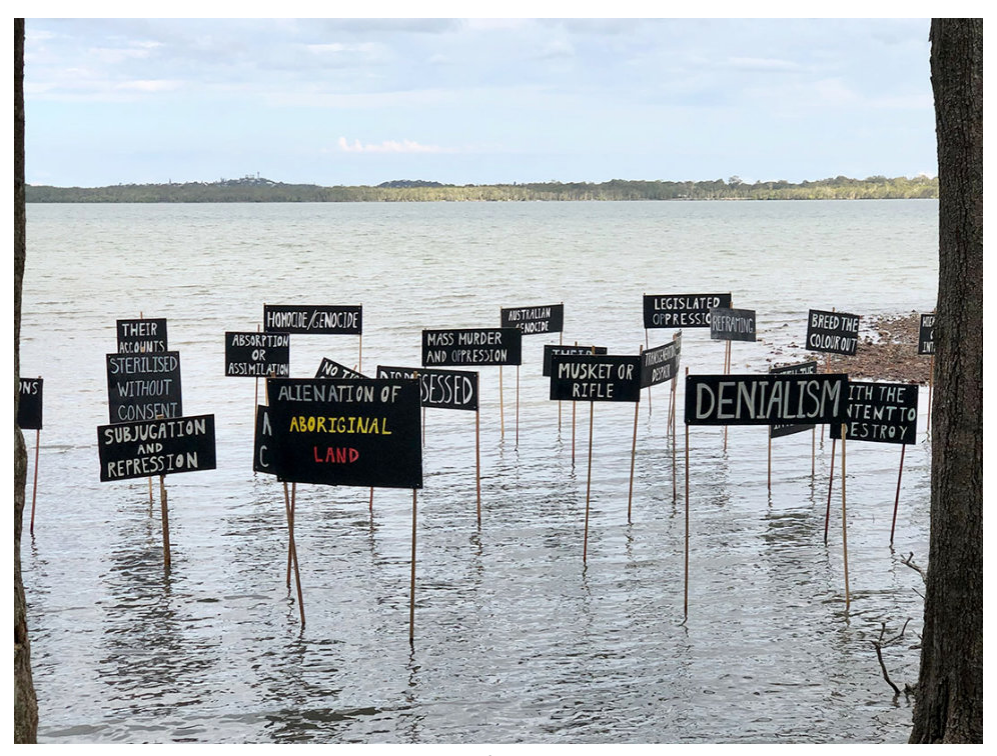
Installation shot of Indelible stain 2019 Digital photograph, image size A4 - framed 40.6 \times 30.5 cm