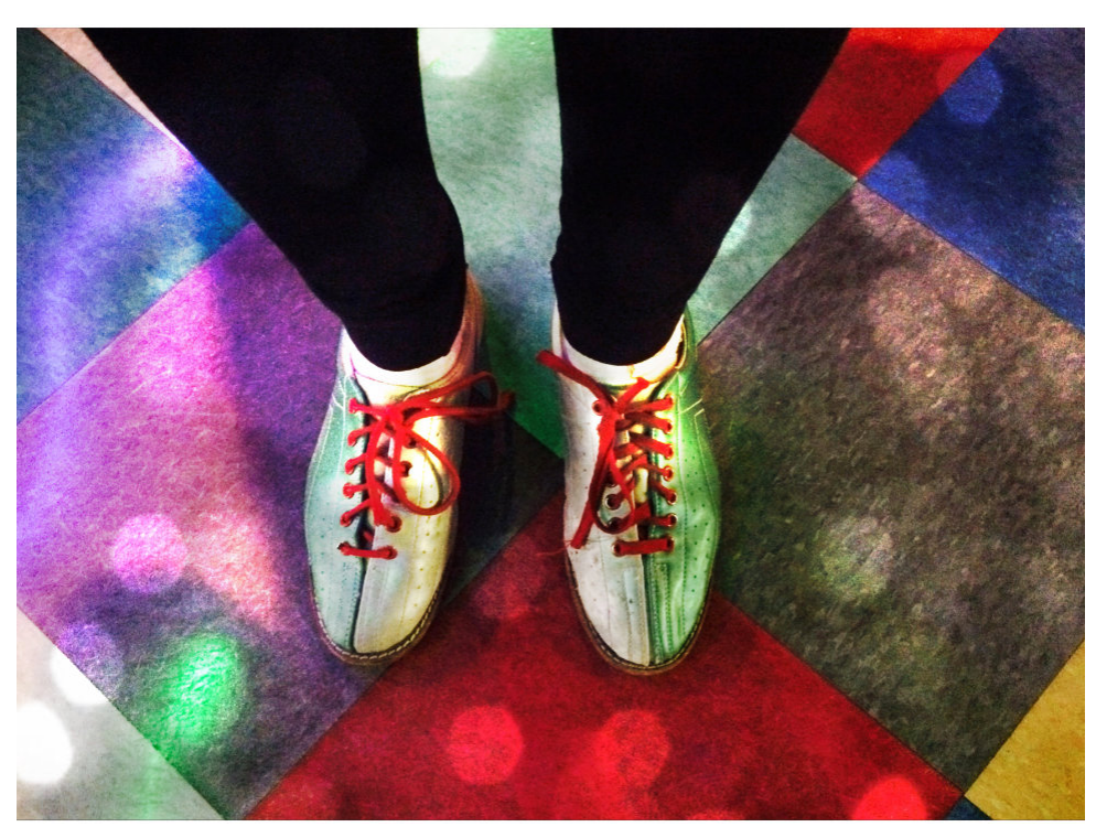
The Big Lebowski 2015 Digital photograph, image size A2 - framed 70 \times 50 cm