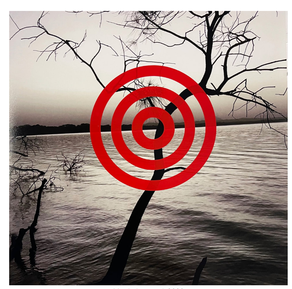
Murdering creek 2022 Digital photograph and vinyl, image size 30 \times 30 \text{ cm} - framed 40.6 \times 40.6 \text{ cm}