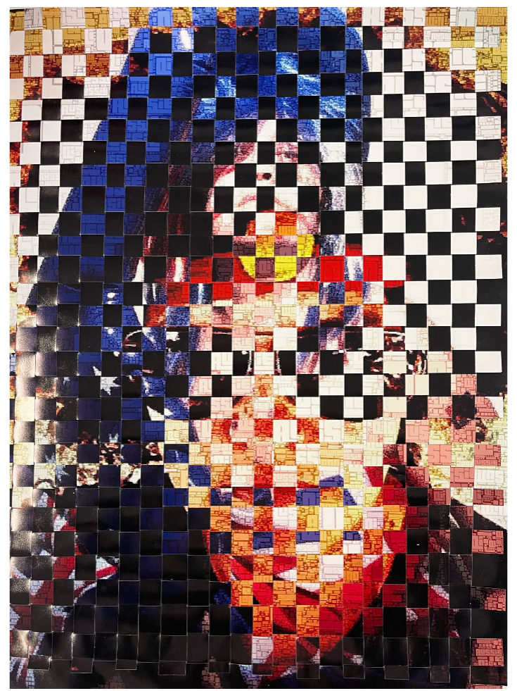
Internal Battle 2022 Digital photographs woven, image size A2 - framed 70 \times 50 cm