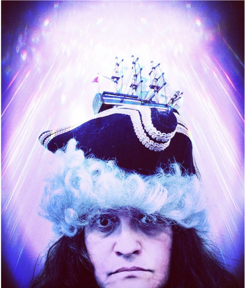
Another day on the Colony 2022 Digital photograph, image size A3 - framed 50.8 × 40.6 cm

A selection of artworks from Bianca Beetson's exhibition, "Past, present, future".