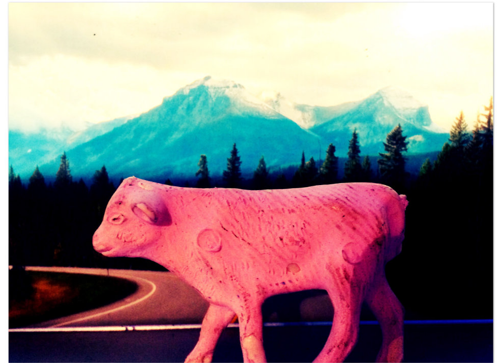
You are not from around here are you 2015 Digital photograph, image size A2 - framed 70 × 50 cm