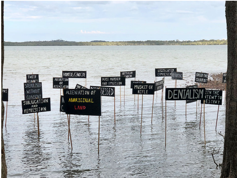
Installation shot of Indelible stain 2019 Digital photograph, image size A4 - framed 40.6 × 30.5 cm