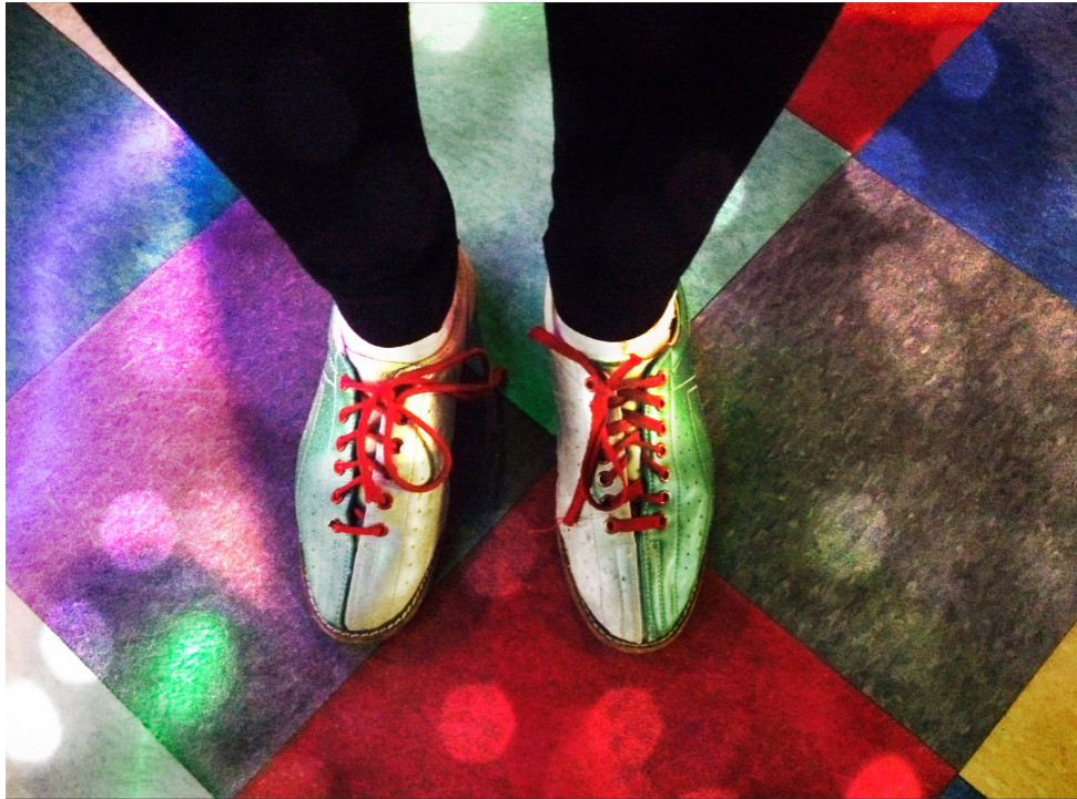
The Big Lebowski 2015 Digital photograph, image size A2 - framed 70 × 50 cm