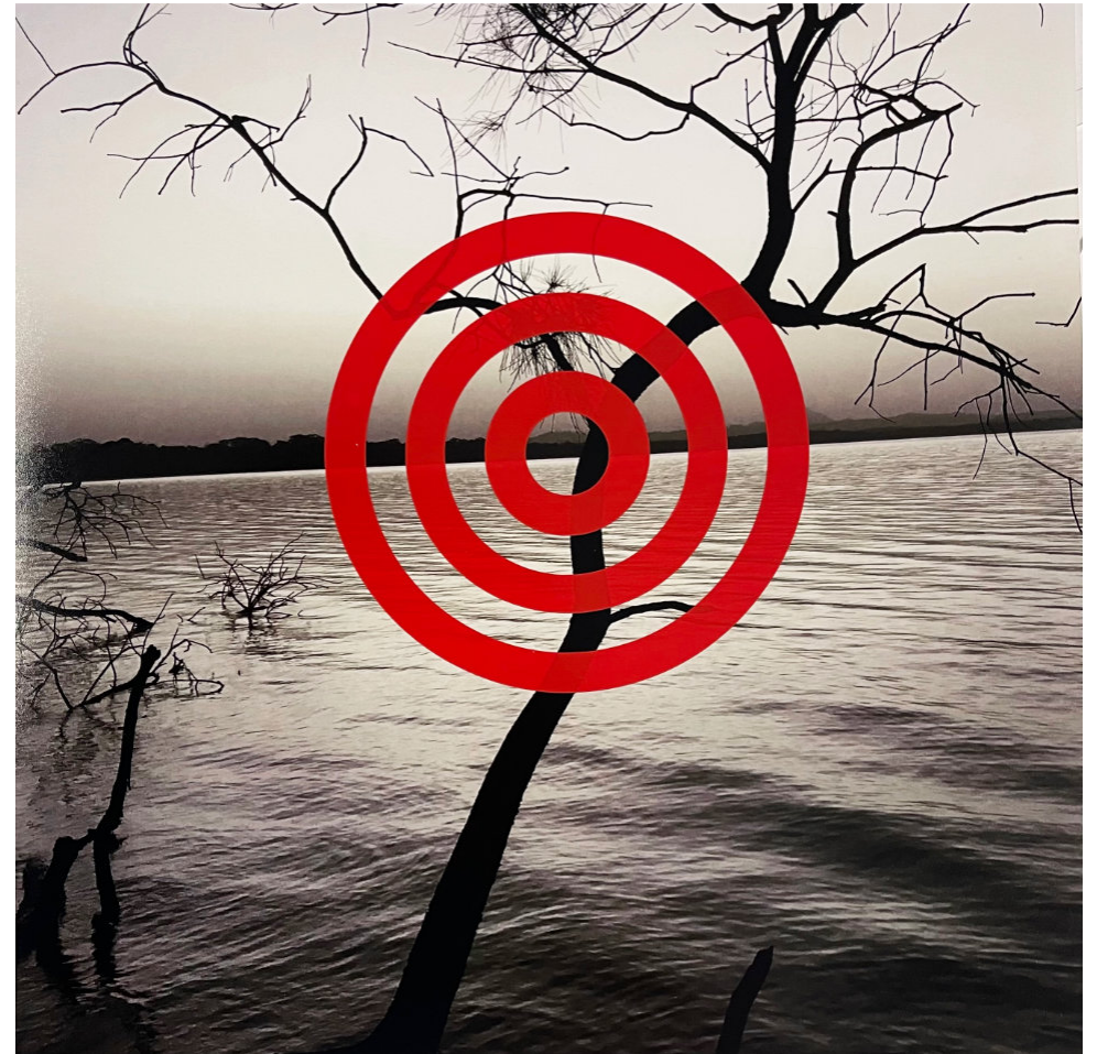
Murdering creek 2022 Digital photograph and vinyl, image size 30 × 30 cm - framed 40.6 × 40.6 cm