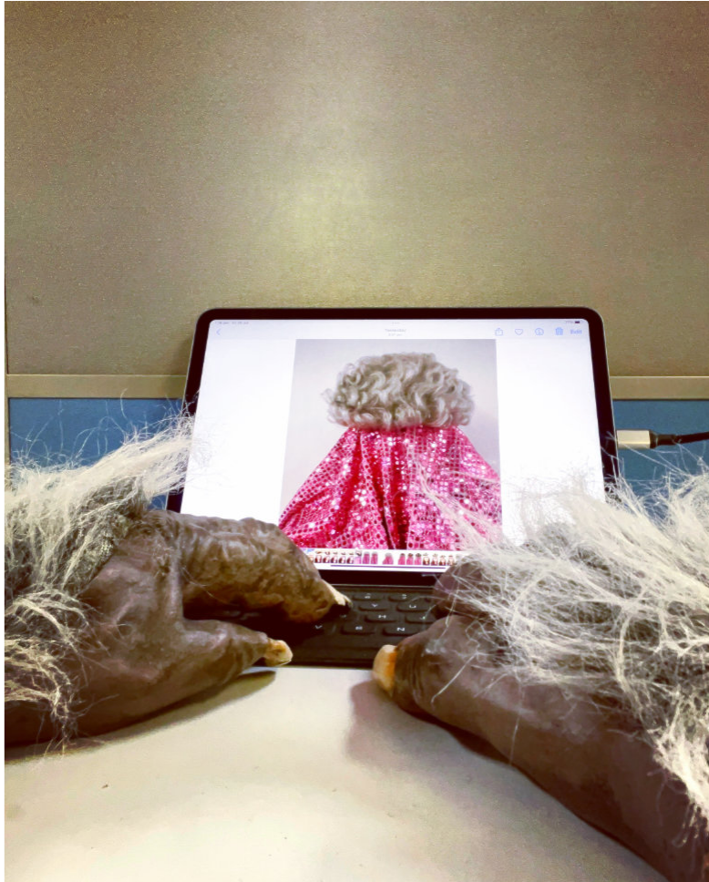
Making monsters of men 2022

Digital photograph, image 30 × 30 cm - framed 40.6 × 40.6 cm