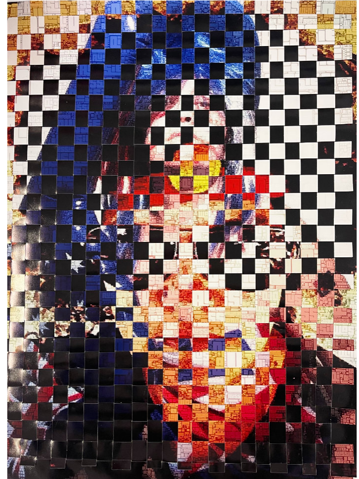
Internal Battle 2022

Digital photograph, image 30 × 30 cm - framed 40.6 × 40.6 cm