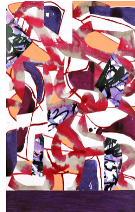
Ploughshare 4 2022