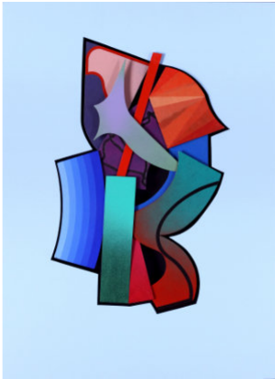
Drawn 3 2022