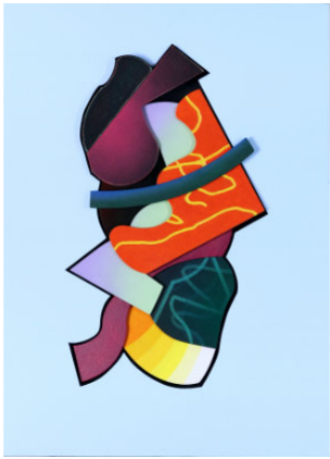
Drawn 1 2022