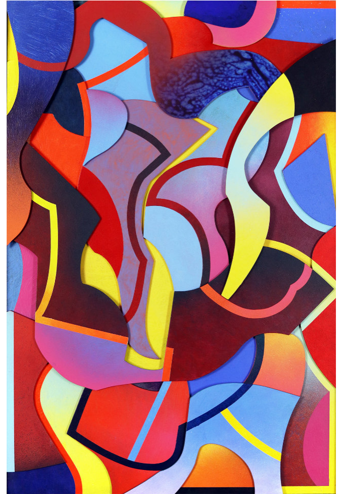
Endless Summer 2020 Acrylic on plywood and hardboard panel, 62 × 41 cm