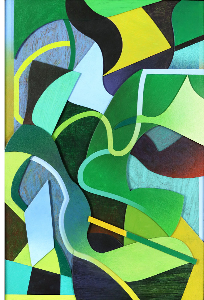
Agrilogistics 2022 Acrylic on plywood and hardboard panel, 62 × 41 cm