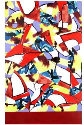
Ploughshare 3 2022