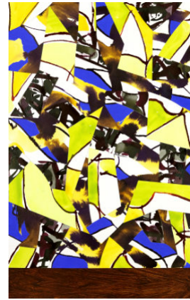
Ploughshare 1 2022

Drawn series, Acrylic on plywood and artists frame, 54 x 39 cm each