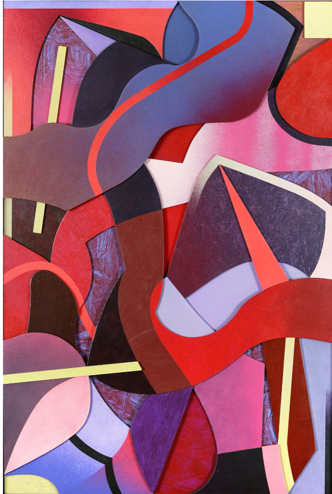
Cloud Seed 2022 Acrylic on plywood and hardboard panel, 62 × 41 cm