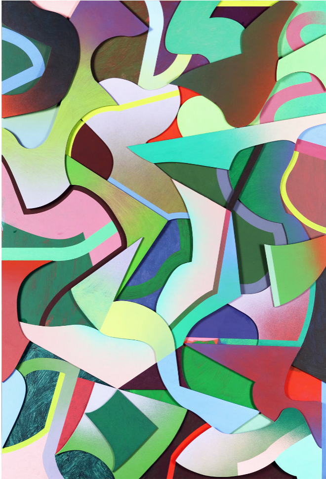
Reservoir Spending 2022 Acrylic on plywood and hardboard panel, 92 × 62 cm