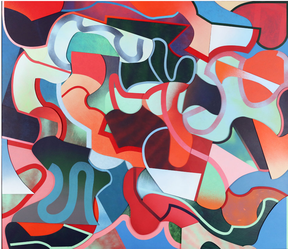
Dreamland 2020 Acrylic on plywood and hardboard panel, 92 × 107 cm