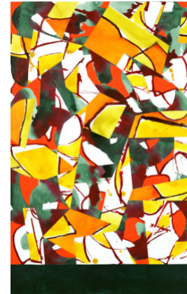
Ploughshare 5 2022