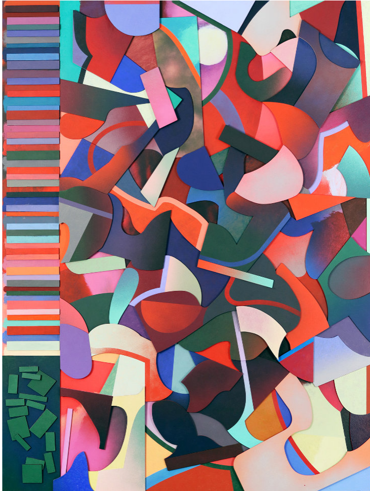
All Collapsing 2021

Acrylic on plywood and hardboard panel, 122 × 92 cm (unframed)