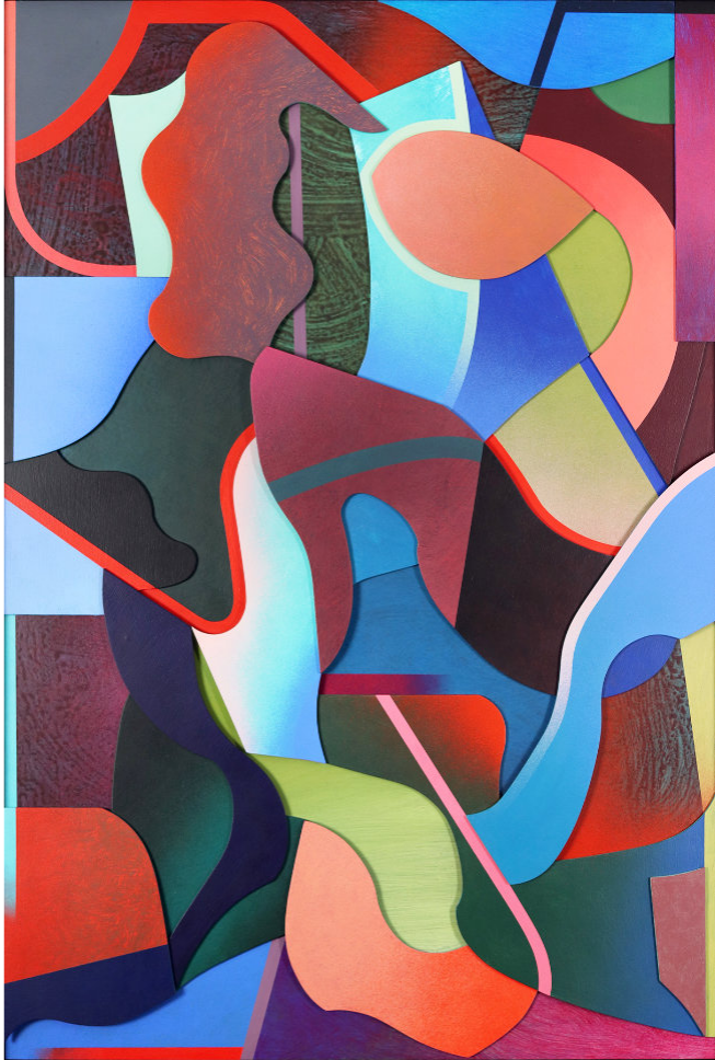
Itinerant Coast 2022 Acrylic on plywood and hardboard panel, 92 × 62 cm