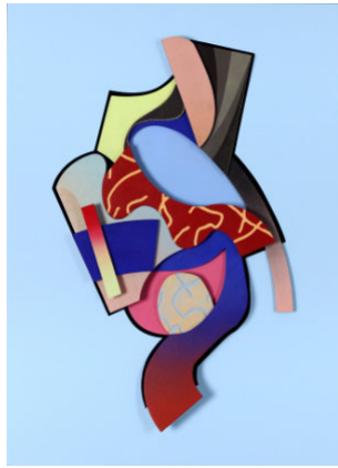
Drawn 2 2022