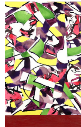
Ploughshare 7 2022

Ploughshare series, Acrylic ink on paper, 61 x 43 cm each