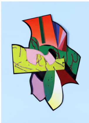
Drawn 5 2022

Drawn series, Acrylic on plywood and artists frame, 54 x 39 cm each