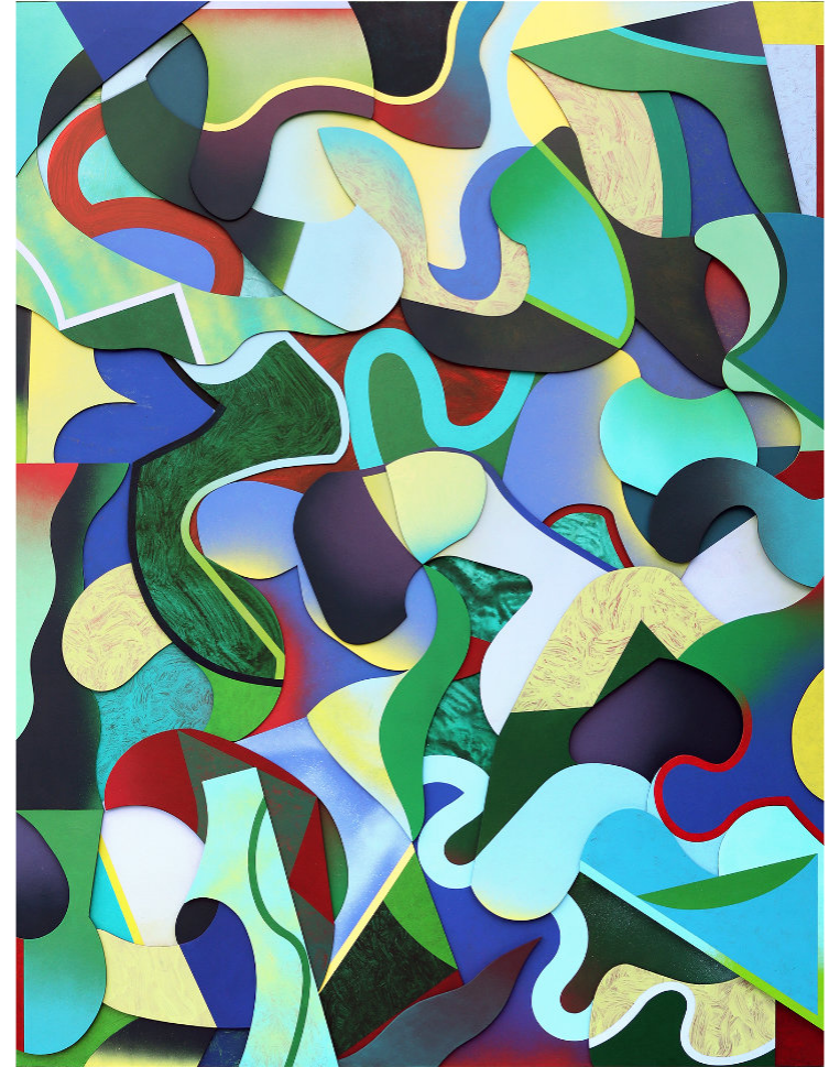
Waters Edge 2021

Acrylic on plywood and hardboard panel, 122 × 92 cm (unframed)