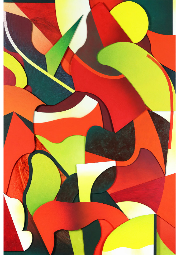
Heat Sink 2022 Acrylic on plywood and hardboard panel, 92 × 62 cm