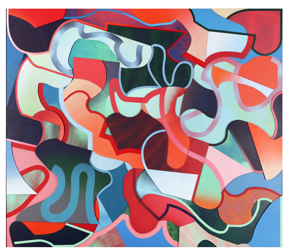
Dreamland 2020 Acrylic on plywood and hardboard panel, 92 × 107 cm