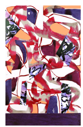
Ploughshare 4 2022