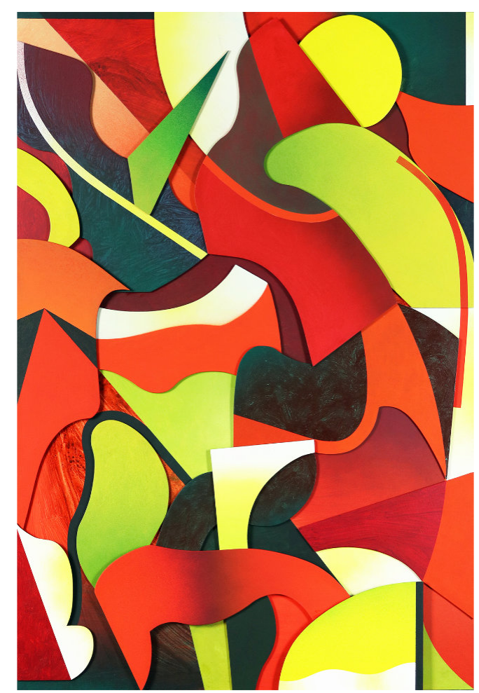
Heat Sink 2022 Acrylic on plywood and hardboard panel, 92 × 62 cm