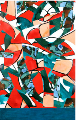
Ploughshare 6 2022