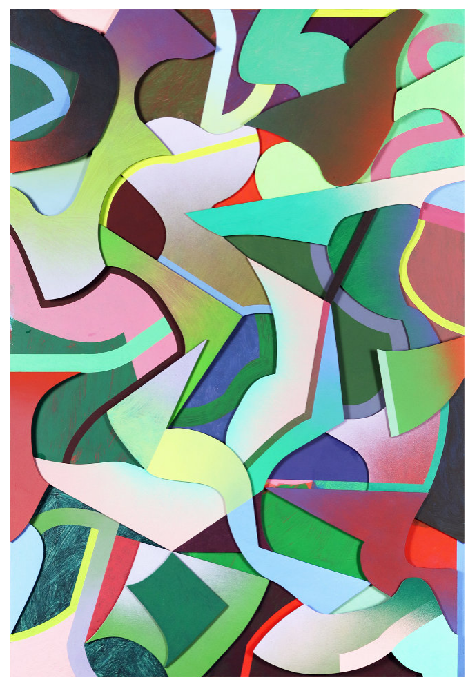
Reservoir Spending 2022 Acrylic on plywood and hardboard panel, 92 \times 62 cm