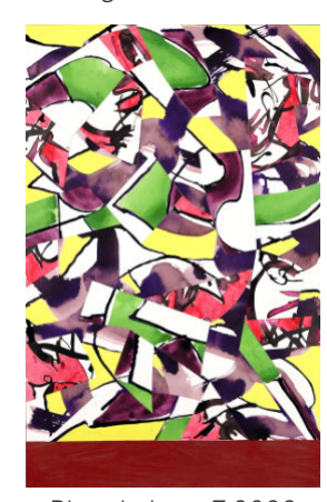
Ploughshare 7 2022