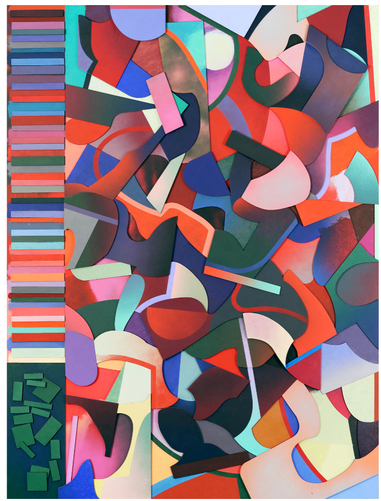
All Collapsing 2021 Acrylic on plywood and hardboard panel, 122 × 92 cm (unframed)