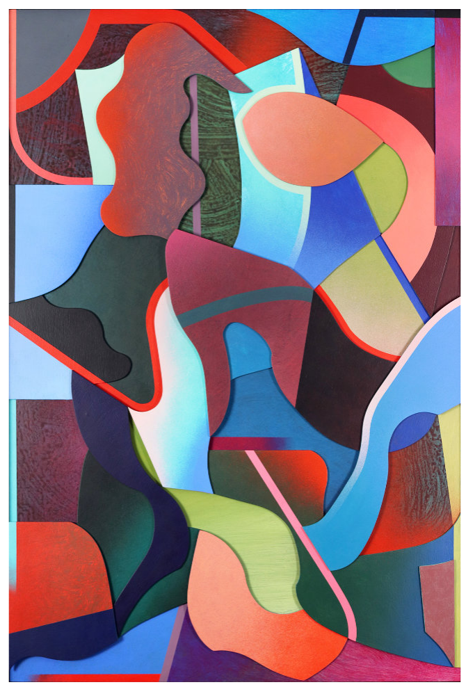
Itinerant Coast 2022 Acrylic on plywood and hardboard panel, 92 × 62 cm