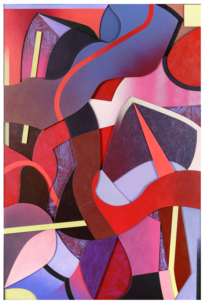
Cloud Seed 2022 Acrylic on plywood and hardboard panel, 62 × 41 cm