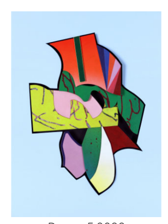
Drawn 5 2022