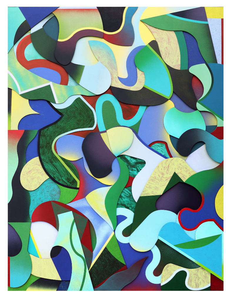
{\it Waters~Edge~2021} \\ {\it Acrylic~on~plywood~and~hardboard~panel,~122\times92~cm}