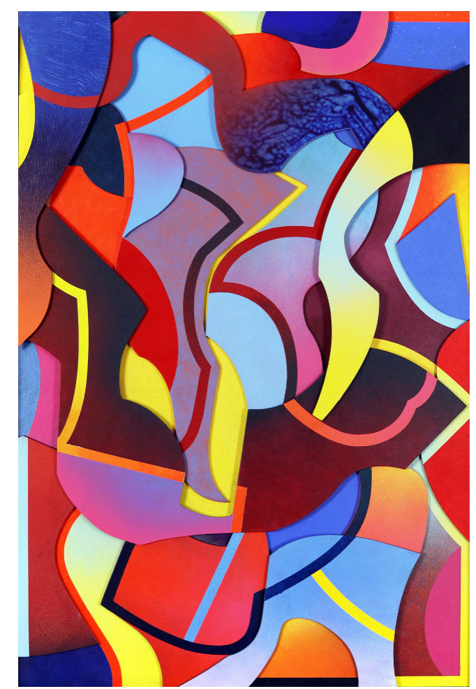
Endless Summer 2020 Acrylic on plywood and hardboard panel, 62 × 41 cm