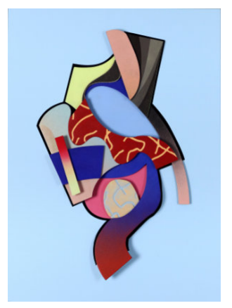
Drawn 2 2022