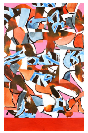
Ploughshare 2 2022