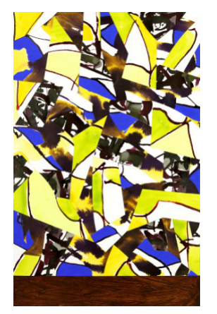
Ploughshare 1 2022