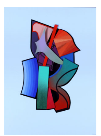
Drawn 3 2022