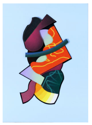
Drawn 1 2022