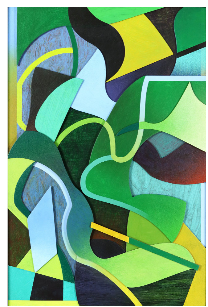
Agrilogistics 2022 Acrylic on plywood and hardboard panel, 62 \times 41 cm