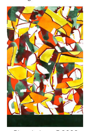
Ploughshare 5 2022