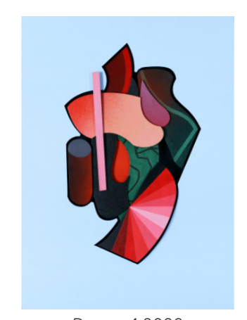
Drawn 4 2022