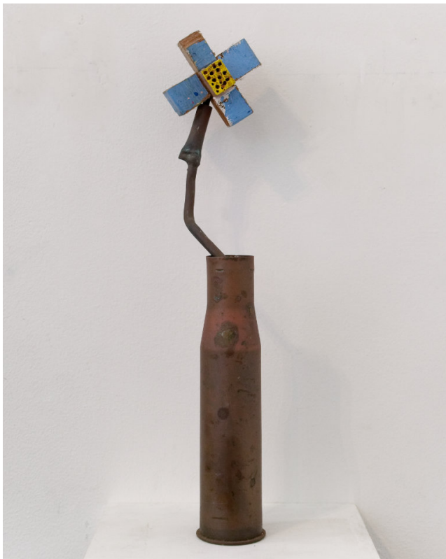
Peace Flower (For Ukraine) 2022, Found object assemblage, 41 × 9 × 8 cm