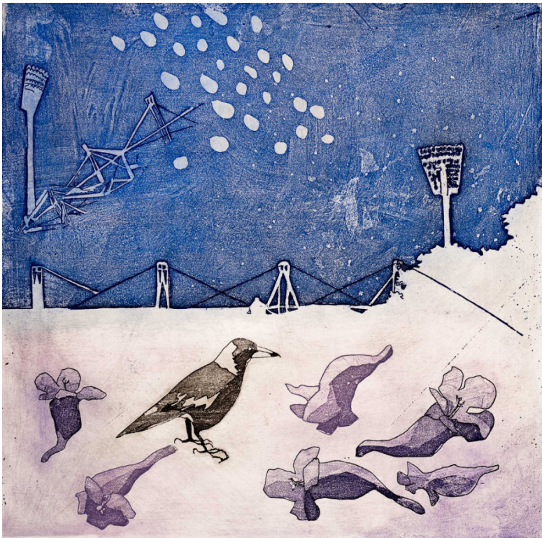
Gabba (Jacaranda) 2023, Etching Edition of 10, 30 × 30 cm (image size)

Kay’s “Gabba” series original prints are etchings created in 2023 utilising the Gabba, summer flowers and Queensland’s blue sky as main motifs. Kay has also added a magpie to one of the prints as they are a favourite wild bird of hers which are commonplace in Brisbane’s suburbs.