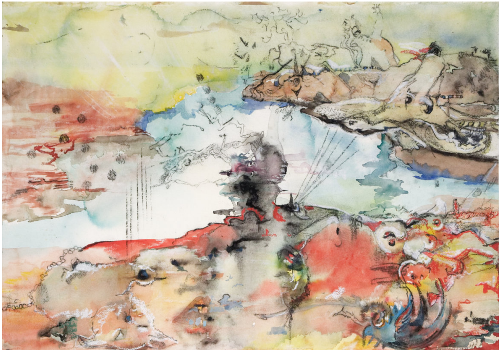
Facing the Past, Looking Beyond the Present: dreamscaping towards a brighter future 2023, Watercolour, gouche, charcoal & pastel on paper, mounted on board, 41.5 × 58.5 cm