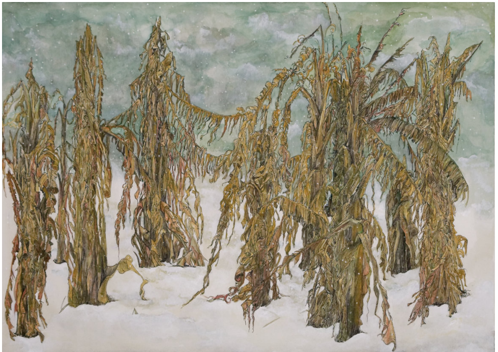
Banana Trees In Winter 2023, Ink, watercolour and acrylic on paper, 32.5 × 45.5 cm

Oubaitori (おうばとり) - is a Japanese idiom. Cherry blossoms, plum, peach, and apricot. Each flower blooms and fruits in its own time, people also grow and bloom at their own pace. Living in Queensland and in context with my personality, banana trees seem better suited.