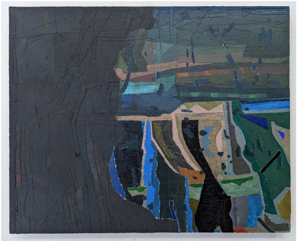
[ BB MC 84 ] Goodness In Mind 2023, Acrylic on board, 41 × 50.5 cm