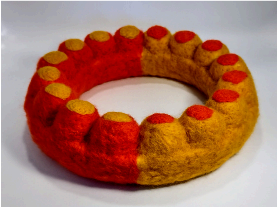
Tandoori and mudhoney form 2022, Wool and polystyrene, 24 × 24 × 7 cm

Casselle Mountford's soft tactile sculptures are created using felted merino wool. Their rounded fluidity and exuberant, vibrant colour combinations exude a playful, joyous harmony. The tactility of these sculptures reflect her interest in handmade textile processes.