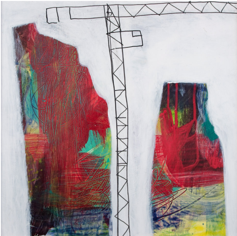
Exciting New Urbane Village 2023, Acrylic on plywood 43.5 × 43.5 cm