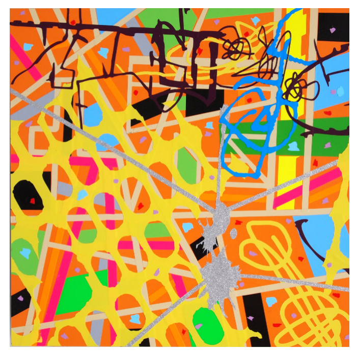
A Tangle 26 2023, Adhesive vinyl on aluminium composite panel, 200 × 200 mm