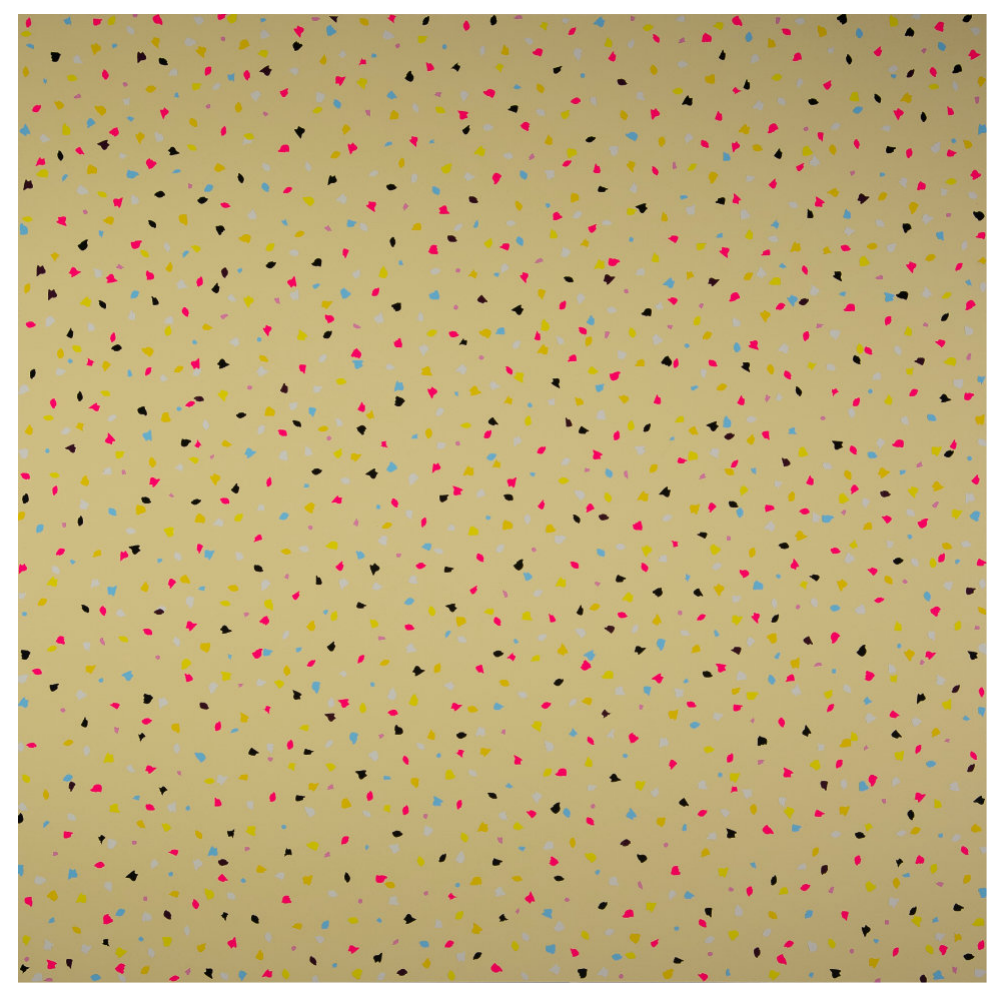
Chips 1 2023 Adhesive vinyl on aluminium composite panel, 590 × 590 mm