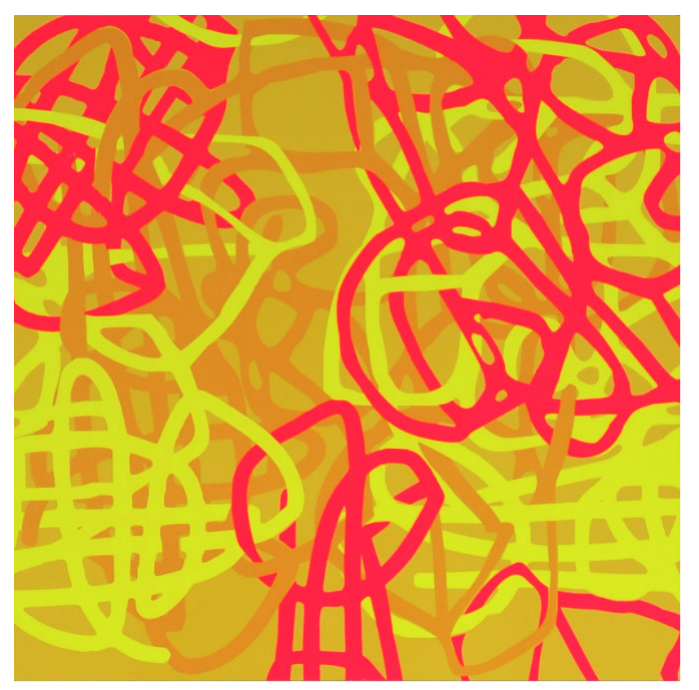
Strike 1 2023, Adhesive vinyl on aluminium composite panel, 290 × 290 mm