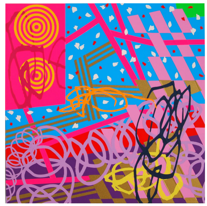
A Tangle 25 2023, Adhesive vinyl on aluminium composite panel, 200 × 200 mm