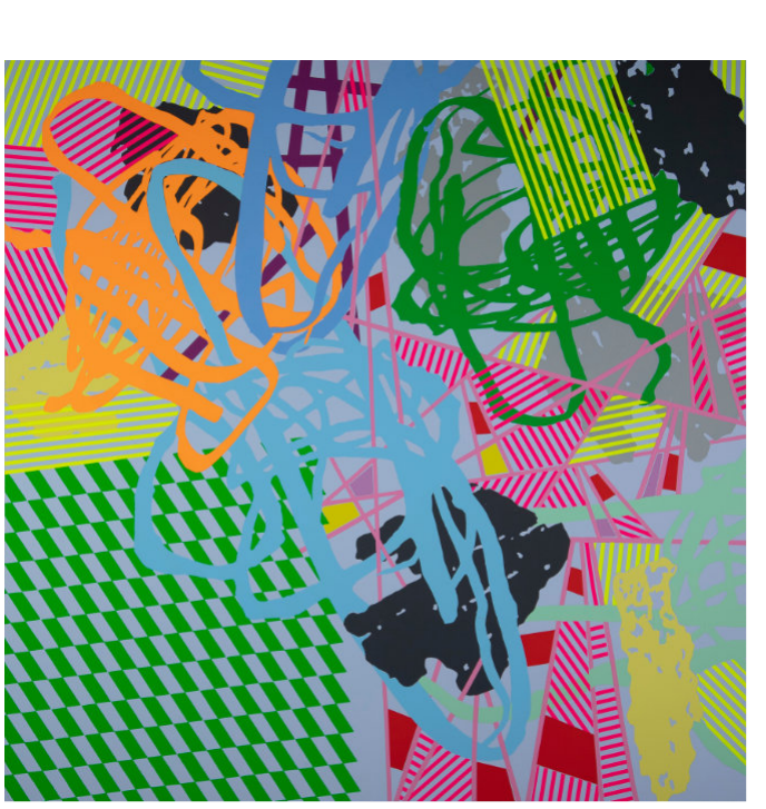
Tangle and Chips 2023 Adhesive vinyl on aluminium composite panel, 590 \times 590 mm