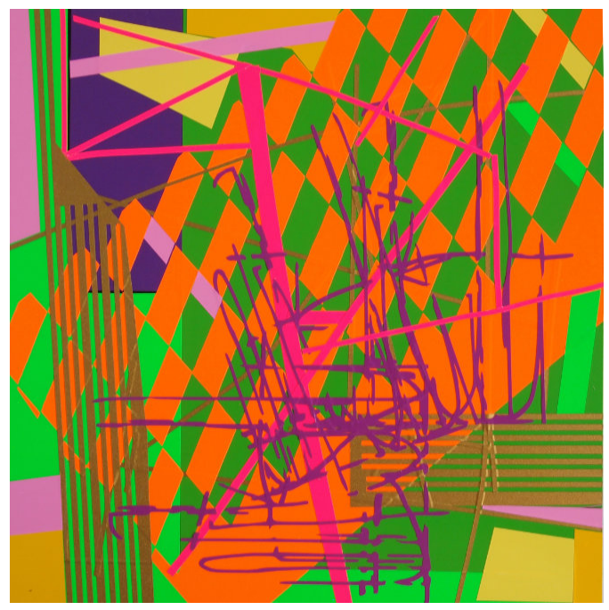
A Tangle 9 2023, Adhesive vinyl on aluminium composite panel, 200 × 200 mm