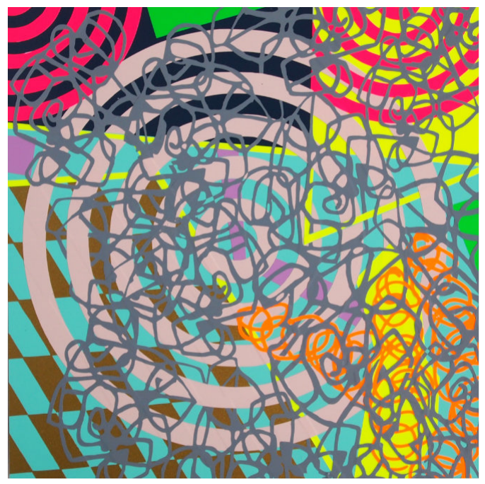
A Tangle 28 2023, Adhesive vinyl on aluminium composite panel, 200 × 200 mm