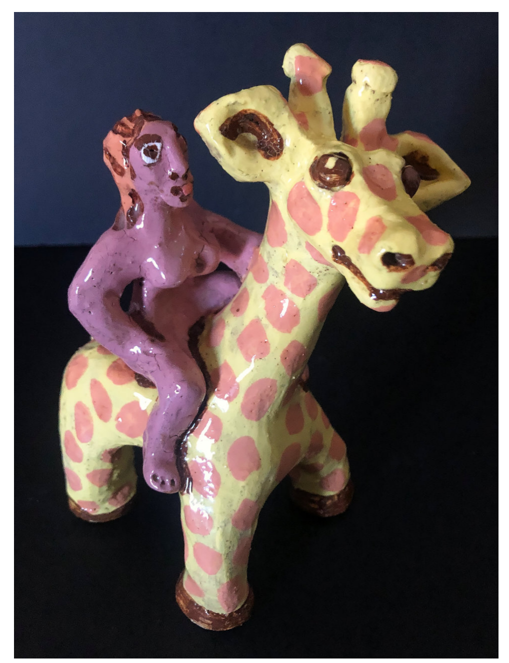
Susie Hansen, Bareback Giraffes - The Trilogy 2023 (Set of 3) BRT glaze fired to 1100, 30 × 25 × 15 cm