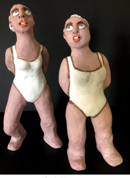
Susie Hansen Twin Swimmers 2023 BRT glaze fired to 1100, 40 × 15 × 15 cm