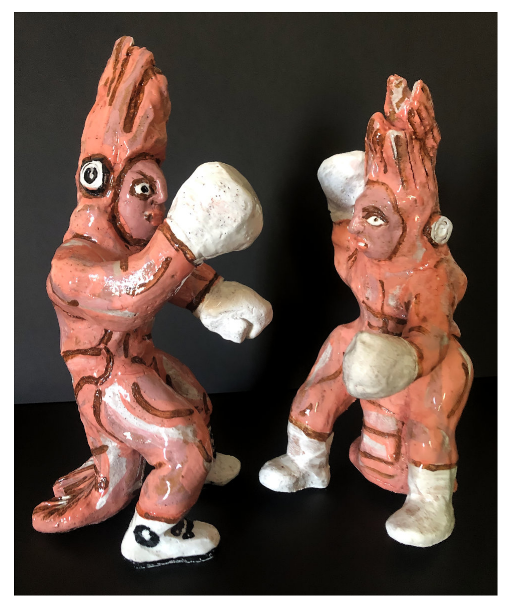
Susie Hansen, Fighting Prawns series 2 2023 (Set of 2) BRT clay and glaze fired to 1100, 50 × 50 × 30 cm