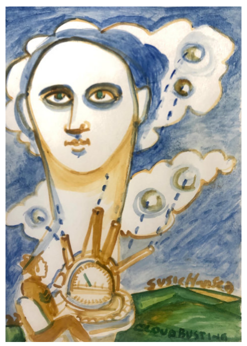
Susie Hansen Cloudbusting - outside on the hill 2023 Gouache on watercolour paper, 29.7 × 21 cm