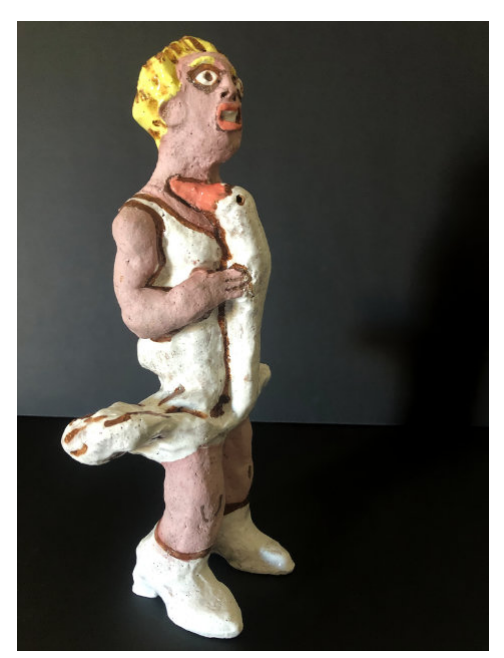
Susie Hansen Blonde Opera Singer in Bjork Swan Dress 2023 BRT glaze fired to 1100, 30 × 15 × 10 cm