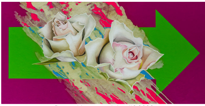
Roses this way and that #2 2023 Oil and acrylic on board, 40 × 80 cm