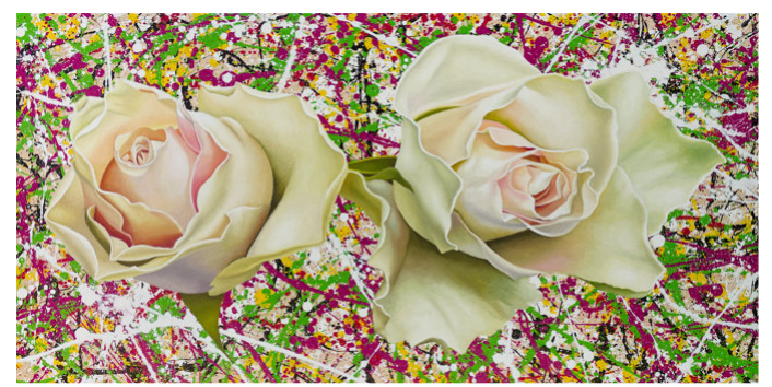
Living Together 2023 Oil and acrylic on board, 40 × 80 cm