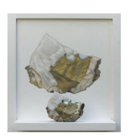
Fool's Gold 2023 Oil on board and iron pyrite specimen 32 × 28 cm