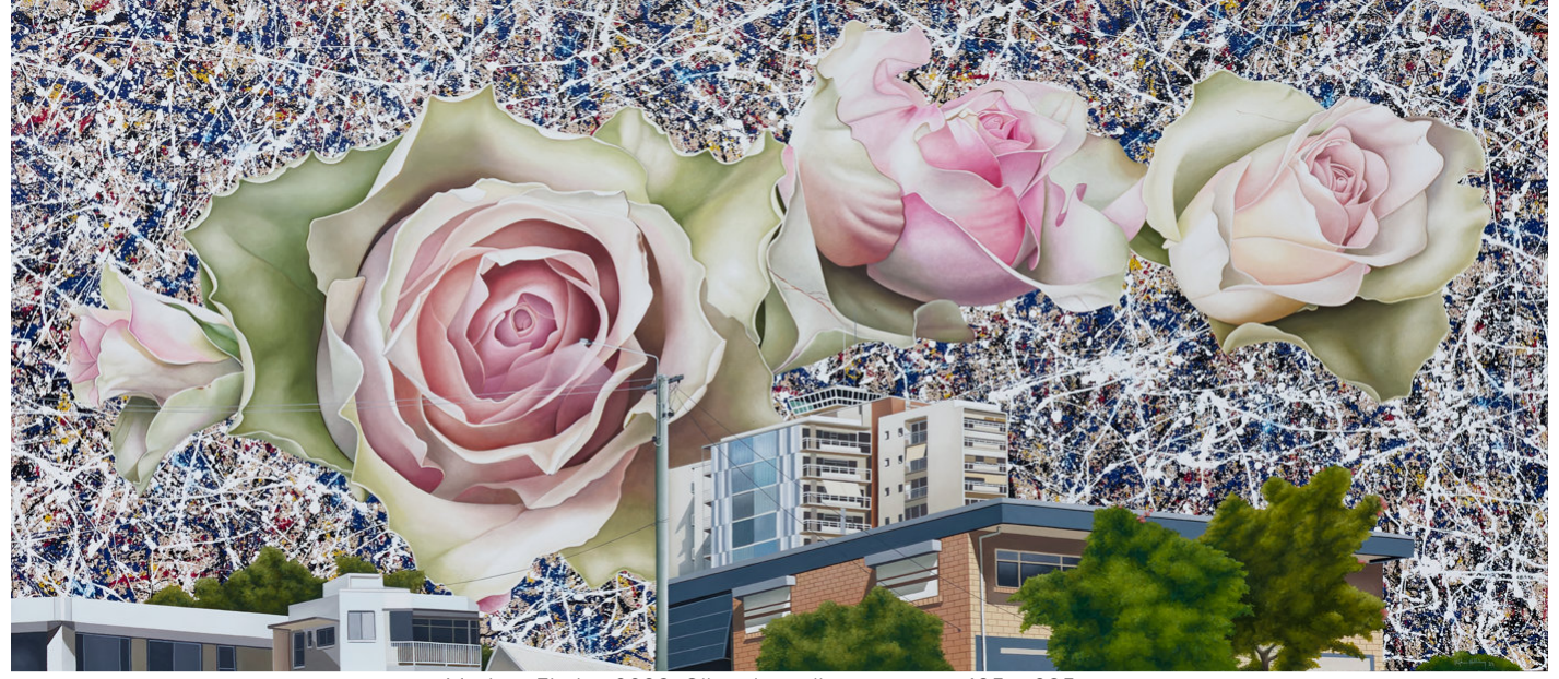
Modern Fiction 2023, Oil and acrylic on canvas, 125 × 285 cm