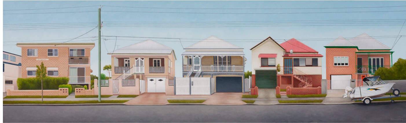
Staycation, Brighton Road 2023, Oil on canvas, 75 × 250 cm