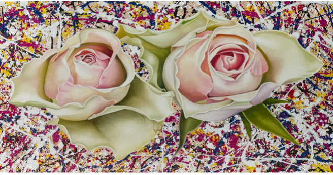
Like-minded 2023 Oil and acrylic on board, 40 × 80 cm