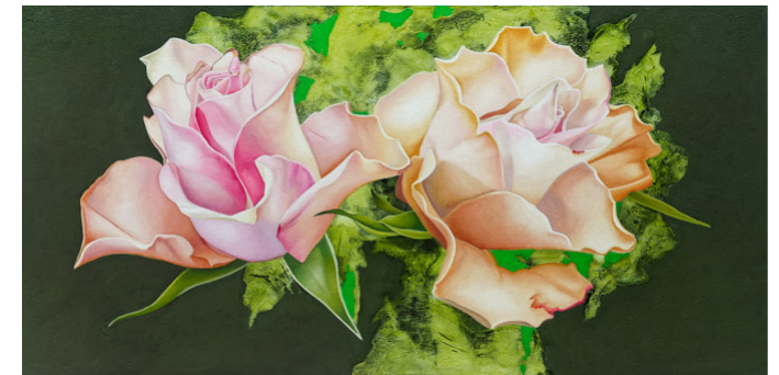
Should never be seen 2023 Oil and acrylic on board, 40 × 80 cm