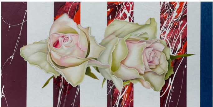
Business at the front, party at the back 2023 Oil and acrylic on board, 40 × 80 cm