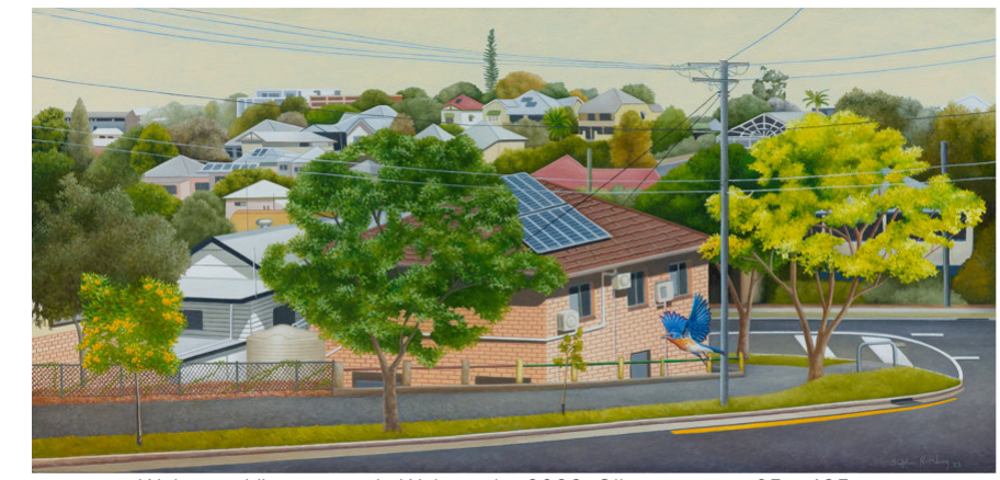
Welcome View towards Wahcumba 2023, Oil on canvas, 65 × 135 cm