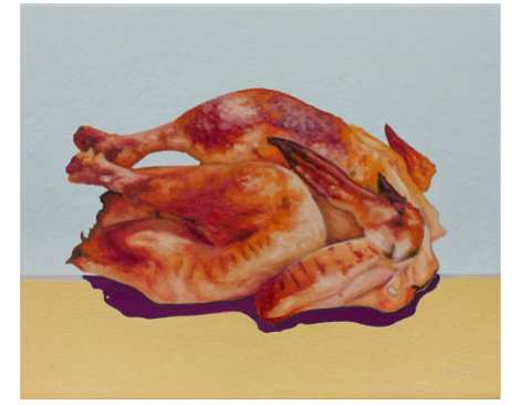
#chicken #cooked #landscape #sunburntcountry 2023 Oil on board, 32 × 39 cm