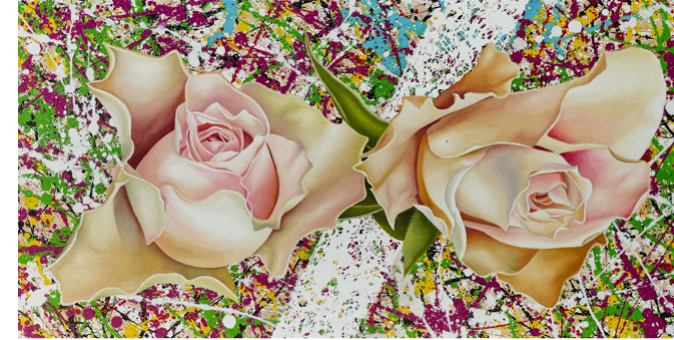
Opposites Attract 2023 Oil and acrylic on board, 40 × 80 cm