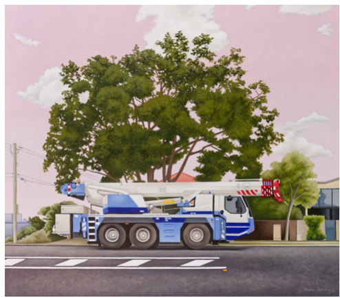
Blue crane beneath a green tree, before pink sky (Hampstead Rd) 2023, Oil on canvas, 75 × 80 cm