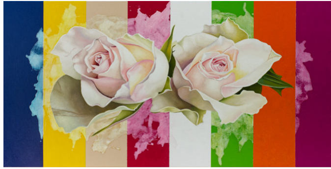
Balancing Act 2023 Oil and acrylic on board, 40 × 80 cm