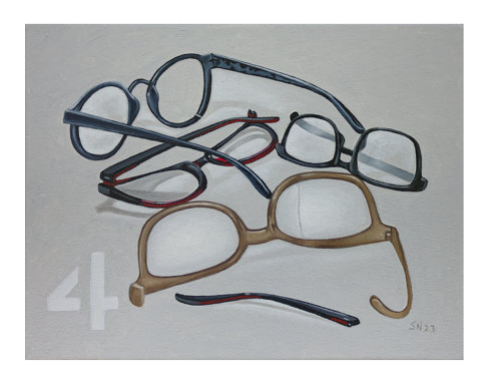
Outta Sight (4 pairs of broken magnifiers) 2023 Oil on board, 32 × 43 cm