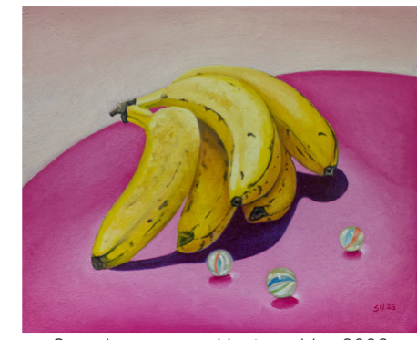
Gone bananas and lost marbles 2023 Oil on board, 32 × 39 cm