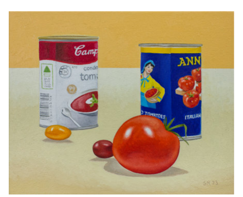
Tomatoes 3 ways 2023 Oil on board, 32 × 39 cm