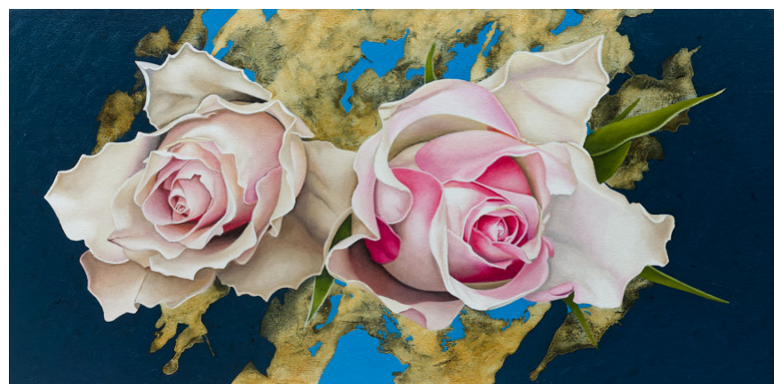
Always is a long time 2023, Oil and acrylic on board, 40 × 80 cm