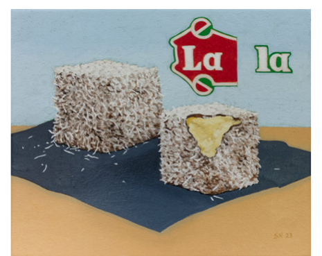
Two lamingtons are better than one lamington 2023 Oil on board, 32 × 39 cm