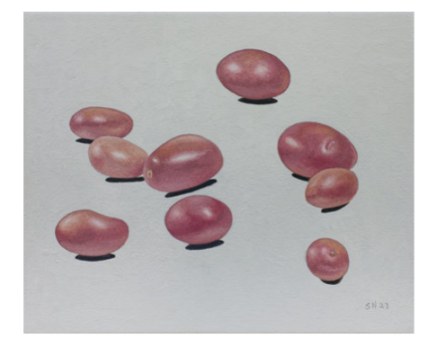
Small Potatoes (pink desiree) 2023 Oil on board, 32 × 39 cm