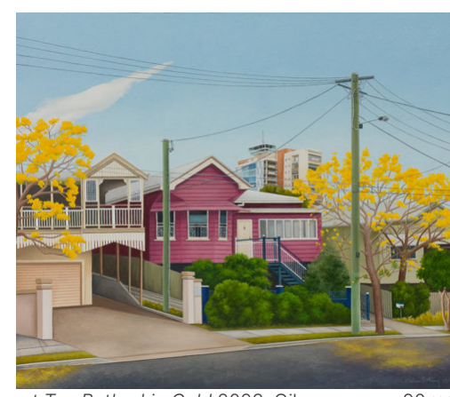
Prospect Tce Bathed in Gold 2023, Oil on canvas, 90 × 105 cm