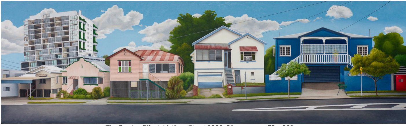
The Domino Effect, Mollison Street 2023, Oil on canvas, 75 × 250 cm