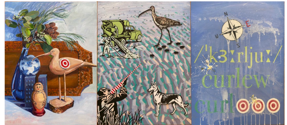
The Meaning of (Still) Life: An Unnatural History-The Far Eastern Curlew 2022. 137 x 61 cm

The Far Eastern Curlew (from 'The Meaning of (Still) Life' ) refers, in three stages, to the vast distances that this shore bird travels each year (from Russia, often stopping in Asia en route to Australia and back again), with the red and white target that travels through each panel denoting the threat that urban development on coastal wetlands currently poses. Dogs and hunters are also implicated, with the final panel a phonetic and textual exploration of the curlew, poetically enshrined with translucent bird poo that washes down the blue background.