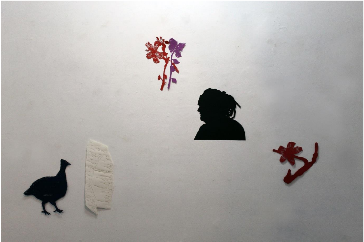
Pamela See (Xue Mei-Ling). Sana Balai (2024) Handcut acid free papers. Size N/A