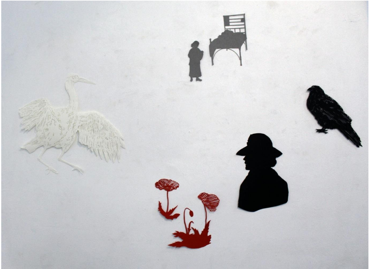
Pamela See (Xue Mei-Ling). Phyllis Anguey (2024) Handcut acid free papers. Size N/A