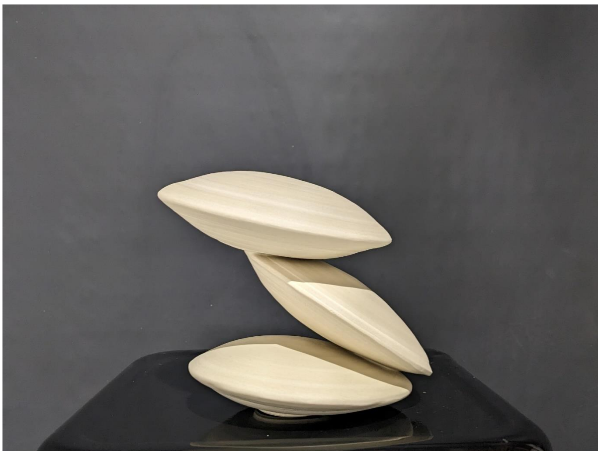
Mélina Celik (Anoosh de Broc). Yavrum (2024) Stoneware clay. 150x160mm