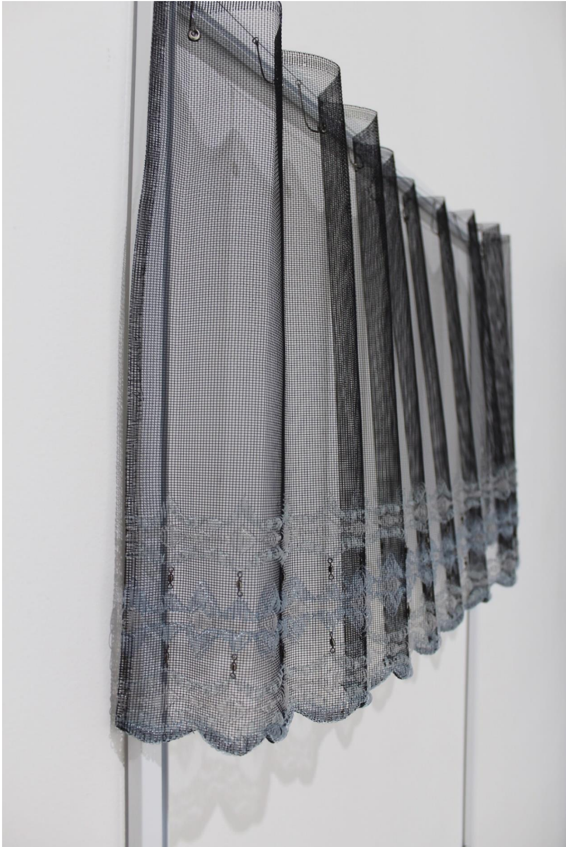
Jeanette Stok. Gezellig (detail) (2023). Aluminium fly screen, 0.7 mm fishing line, 0.7 black coated wire, crane swivels, eyelets, baitholder hooks and white 25 mm flyscreen frame. Two windows, each 730 x 900mm