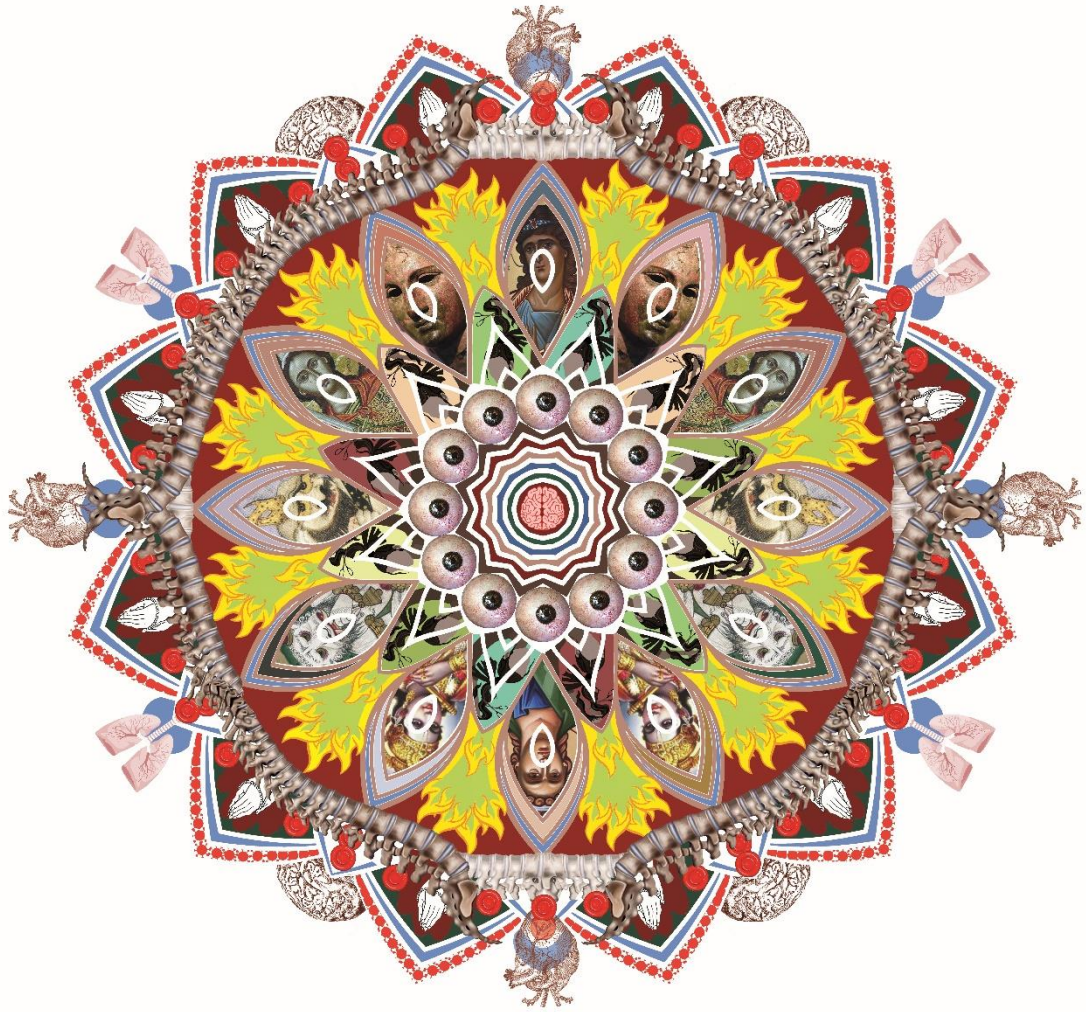
Sara Nejad. Untitled 3 from Recurrence and Emergence Series . 2 nd Edition. (2023-4) Gouache and archival inkjet print on cotton rag paper. 1000 x 1000mm