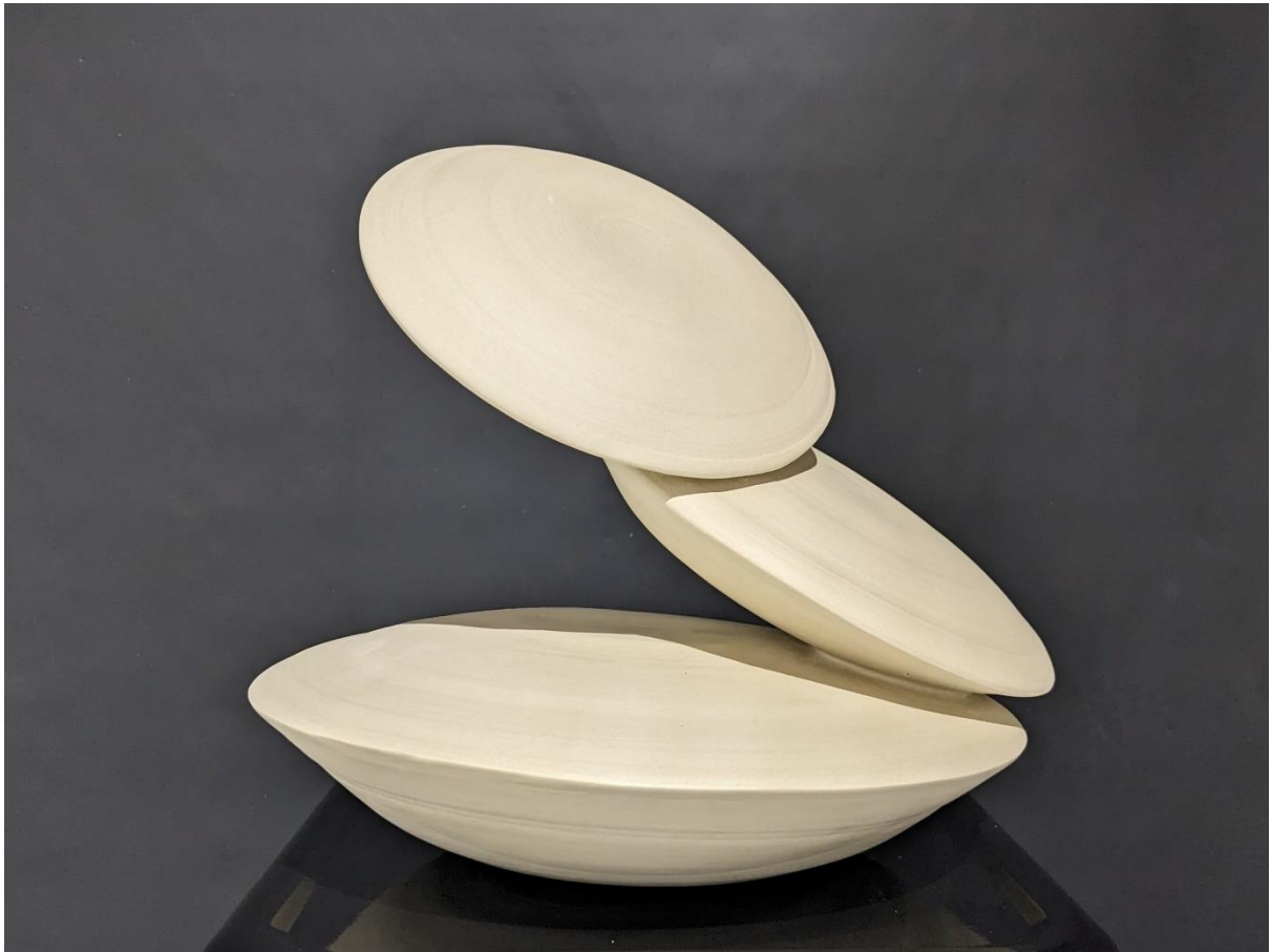
Mélina Celik (Anouche de Broc). It strangely resembles our mountains “Cela ressemble étrangement à nos montagnes” (2024). Stoneware clay. 280x300mm