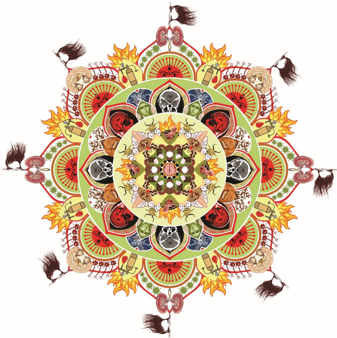
Sara Nejad. Untitled 1 from Recurrence and Emergence Series . 2 nd Edition. (2023-4) Gouache and archival inkjet print on cotton rag paper. 1000 x 1000mm