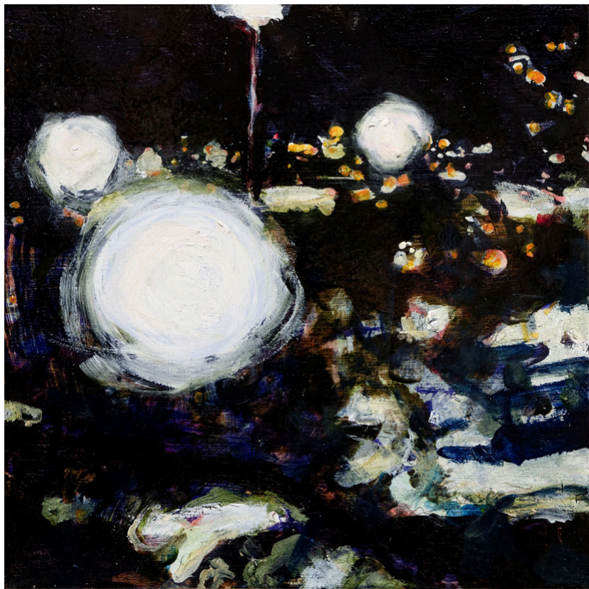
Albion Park #5 2024, Oil on ply, 30 × 30 cm $1,100