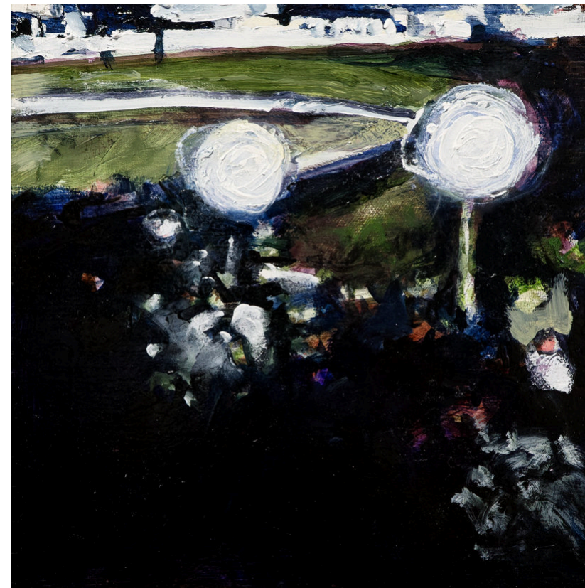
Albion Park #8 2024, Oil on ply, 30 × 30 cm $1,100