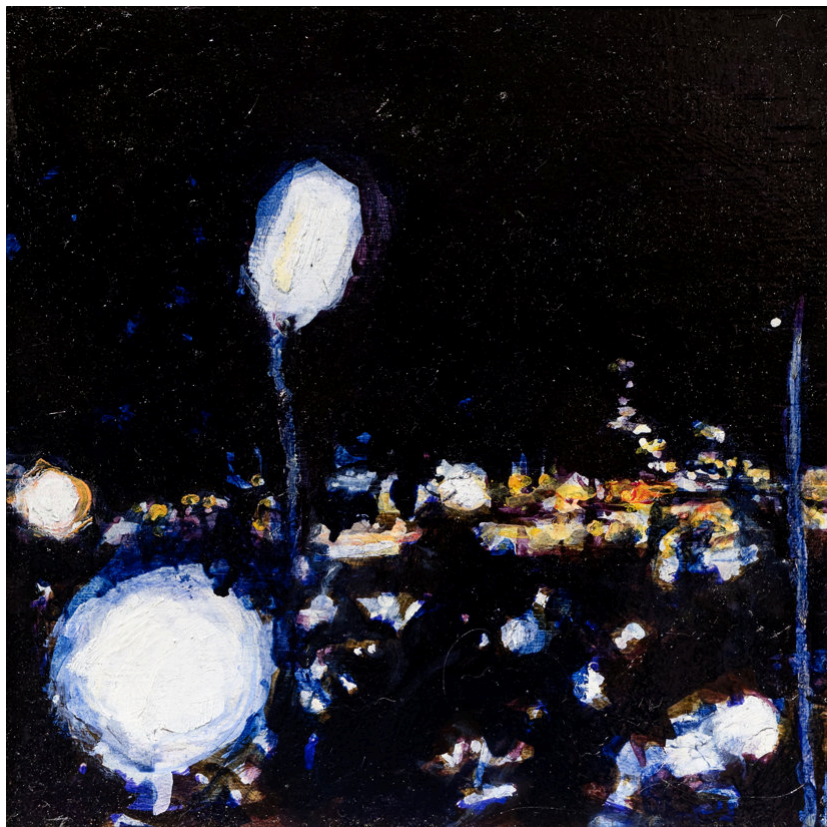
Albion Park #2 2024, Oil on ply, 30 x 30 cm $1,100