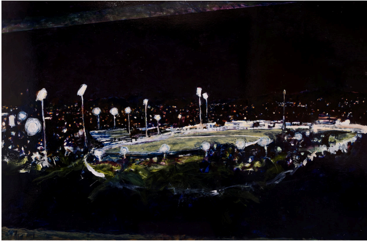
Albion Park #9 2024, Oil on ply, 120 × 183 cm $4,000