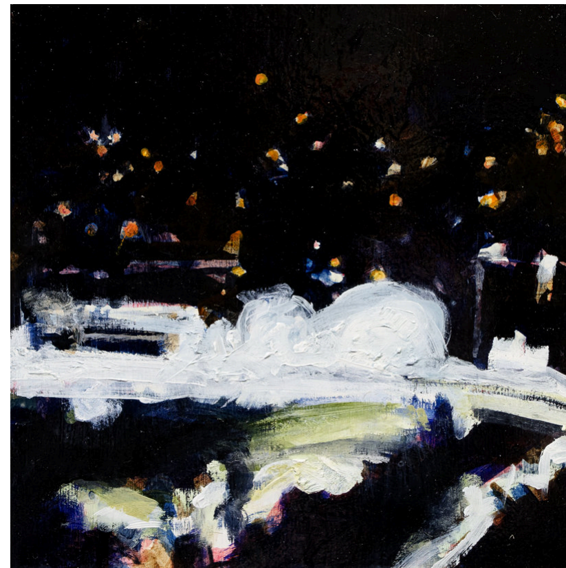
Albion Park #6 2024, Oil on ply, 30 x 30 cm $1,100