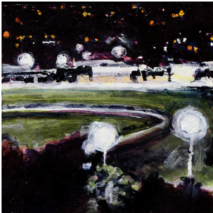
Albion Park #7 2024, Oil on ply, 30 x 30 cm $1,100