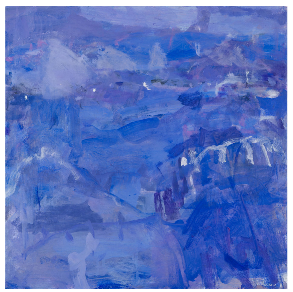
Moreton Bay, Glass House Mountains 2024, Oil on board, 60 × 60 cm

A selection of artworks from Clare Purser's exhibition 'Overwintering'.