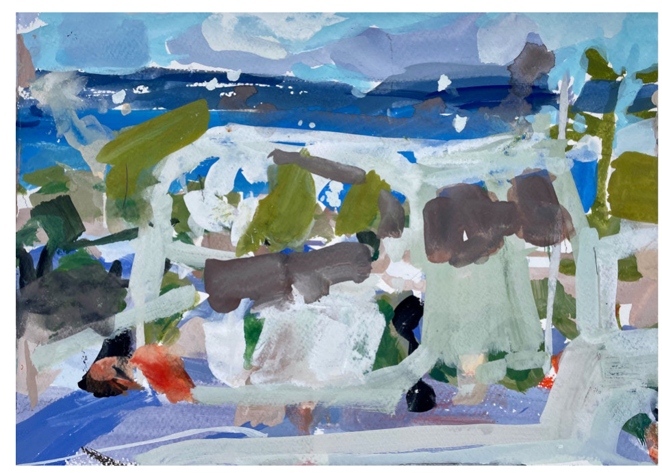
Moreton Bay from Wynnum 2024, Gouache on paper, 32.5 \times 41.5 \text{ cm}