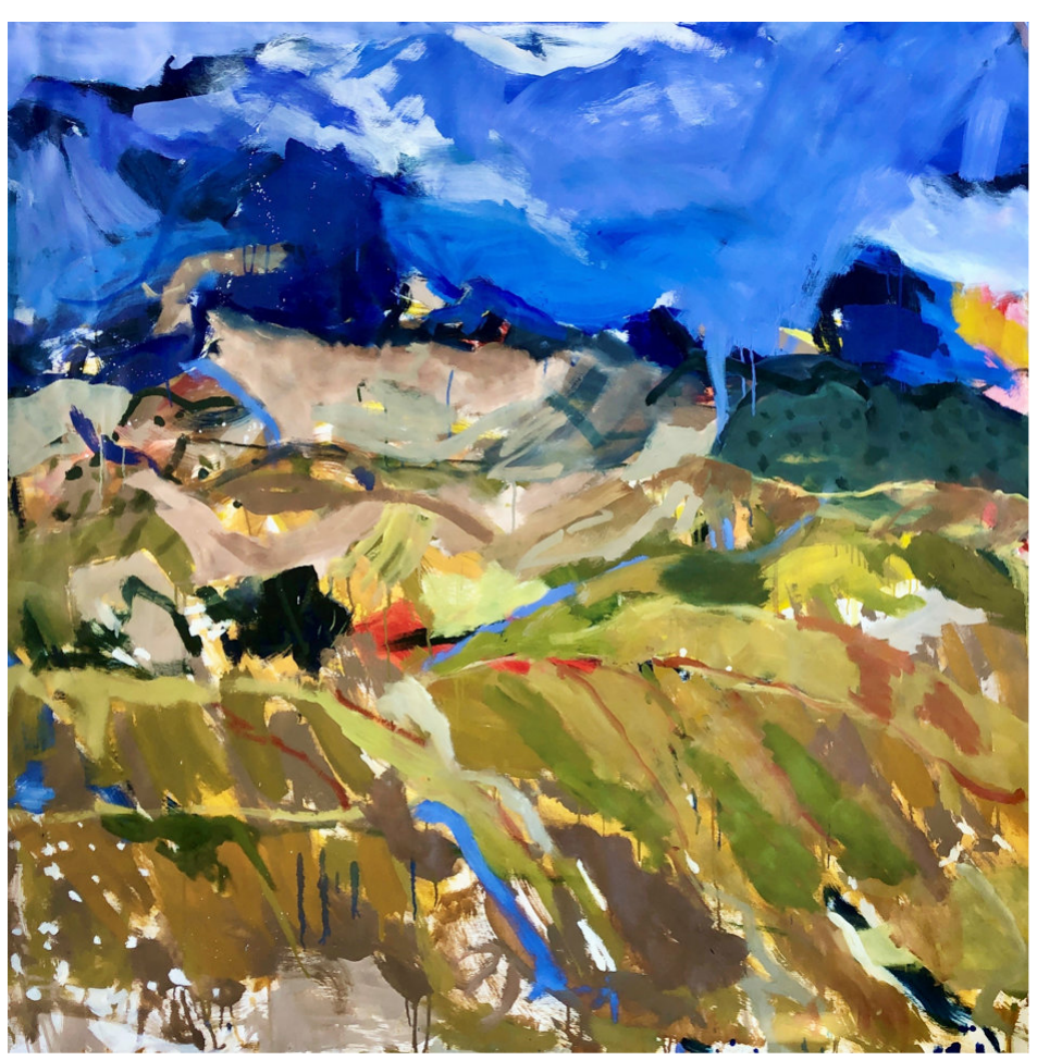
Journey to Yugambeh Country 2022 Oil 150 × 150 cm