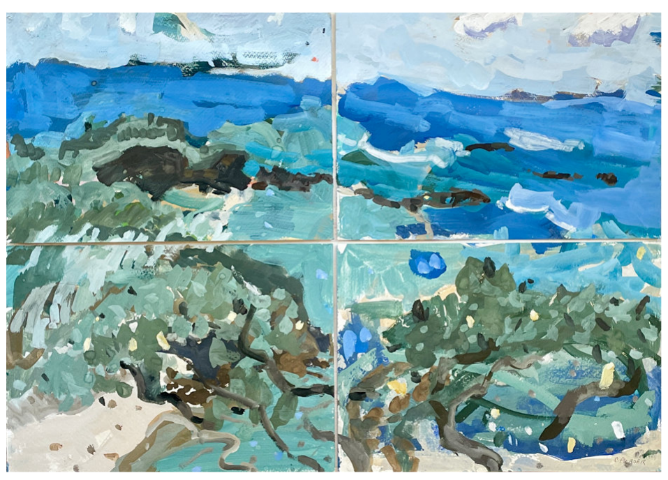
Looking towards Frenchmans, Minjerribah 2023, Gouache on paper, 76 \times 58.6 \text{ cm}