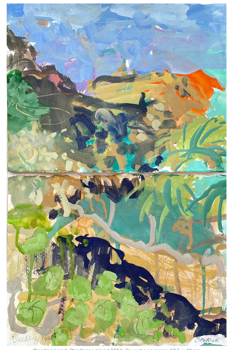
Bleeding Heart, Stradbroke Island 2024, Gouache on paper, 58.5 × 46 cm