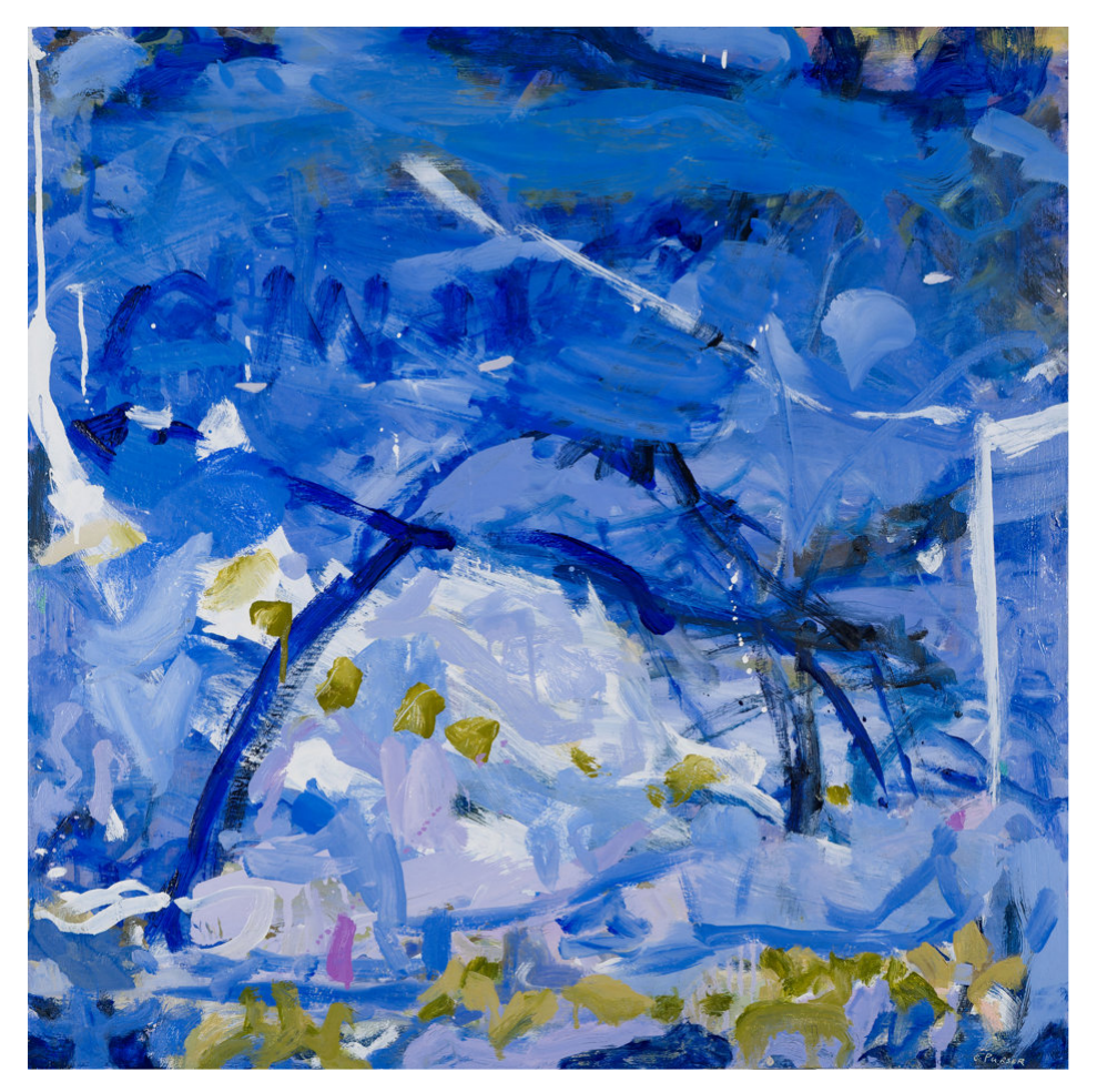
Overwintering II Moreton Bay 2024, Oil on board, 83 × 83 cm