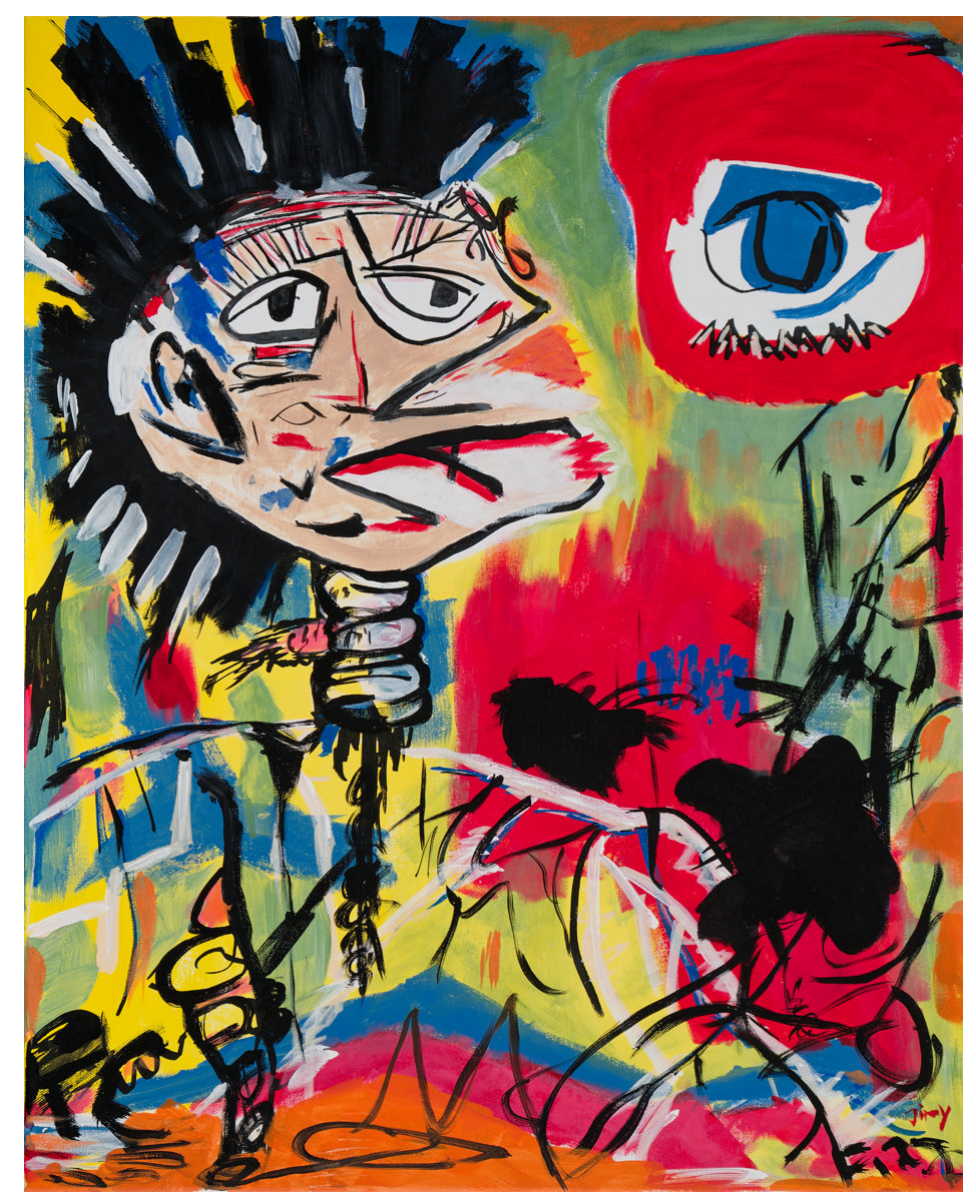
The Doctor 2024, Acrylic on canvas, 76 \times 61 \text{ cm}

This is his first solo exhibit, with many more to come.