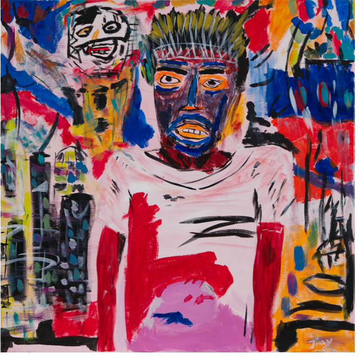
TV Presenter (Times Square) 2024, Acrylic on canvas, 61 \times 61 cm