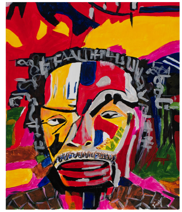
Classic (Times Square) 2024, Acrylic on canvas, 61 × 51 cm