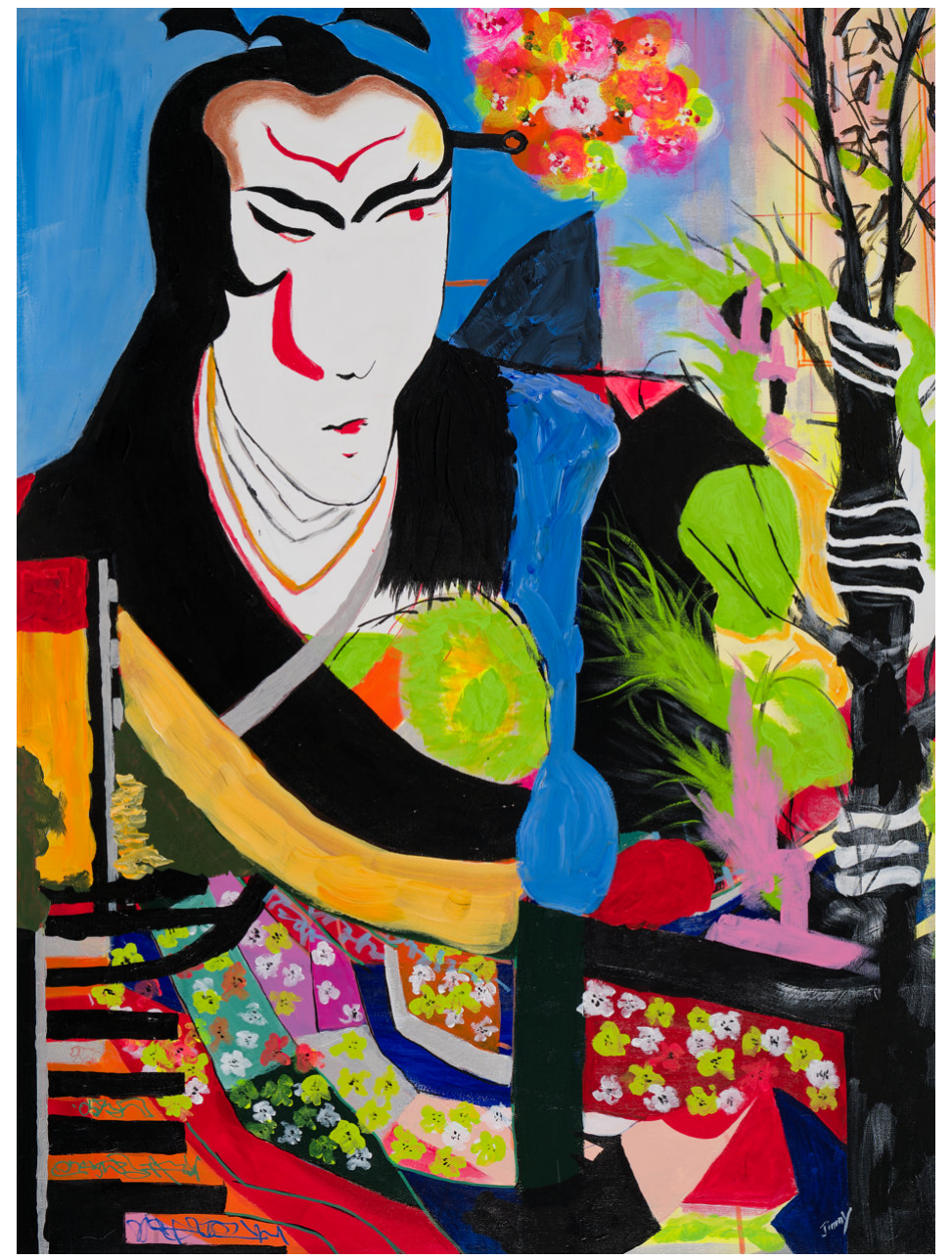
The Hero (Kabuki) 2024, Acrylic on canvas, 122 × 91 cm