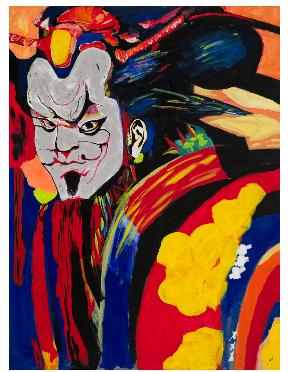
Samurai (Kabuki) 2024, Acrylic on canvas, 122 × 91 cm