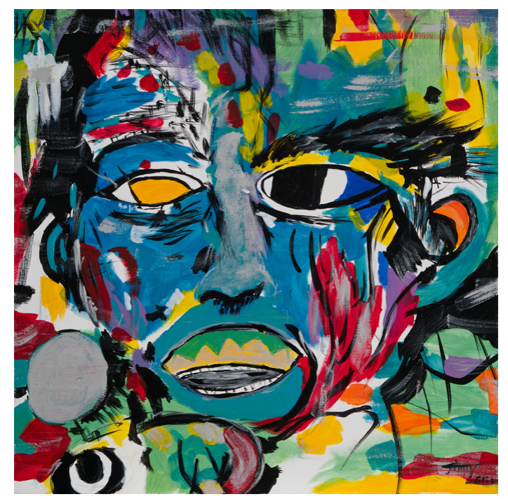
Sporty (Times Square) 2024, Acrylic on canvas, 61 × 61 cm