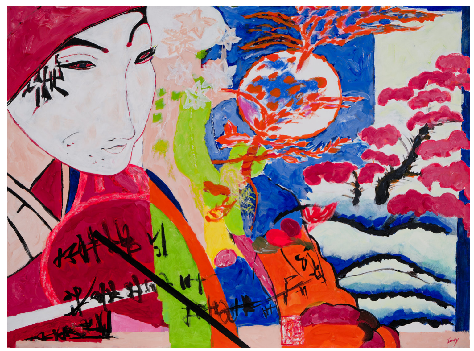
Geisha (Kabuki) 2024, Acrylic on canvas, 91 × 122 cm