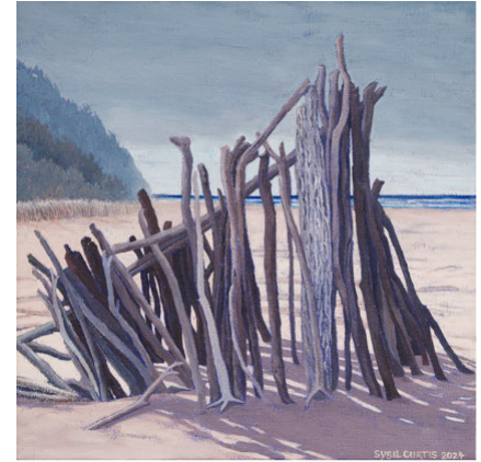
Headland (Central Coast, NSW) 2024 Oil on canvas, 35 × 35 cm