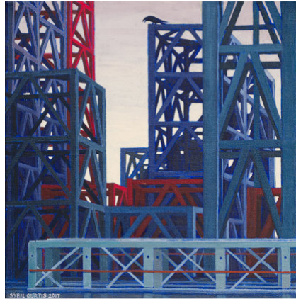
It's all mine (Summer Park, Brisbane) 2024 Oil on canvas, 35 × 35 cm