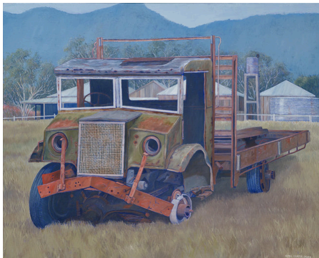
Blitz (East Kunderang, NSW) 2024, Oil on canvas, 80 × 100 cm