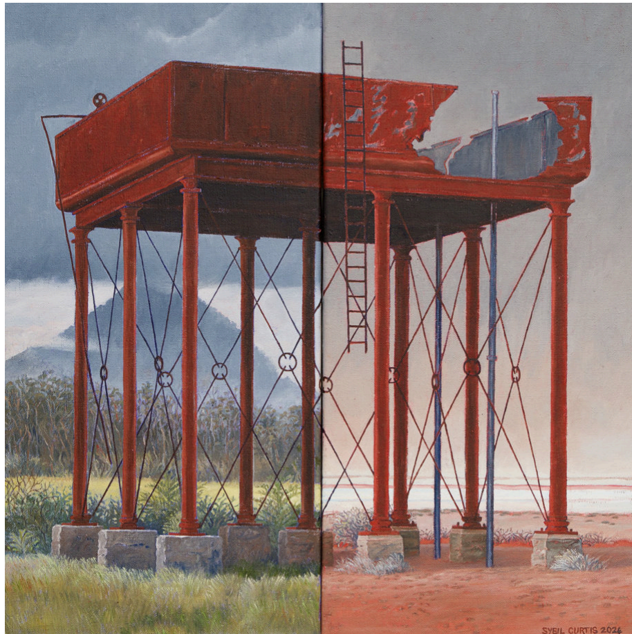
Soft mist to salt lake (St Marys, Tasmania / Kati Thanda, SA) 2024, Oil on canvas, 58 × 58 cm