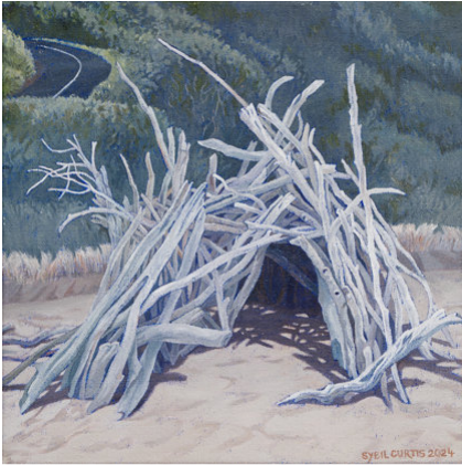
Road to beach (Central Coast, NSW) 2024 Oil on canvas, 35 × 35 cm