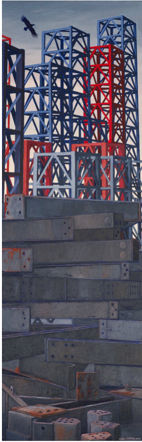
One flew over (Sumner Park, Brisbane) 2017 Oil on canvas, 150 × 48 cm