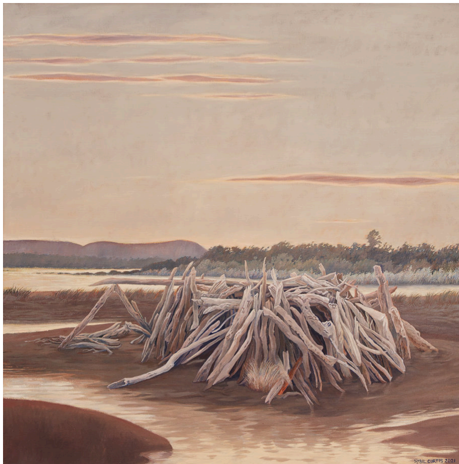
Ephemeral (Falmouth, Tasmania) 2021, Oil on canvas, 100 × 100 cm