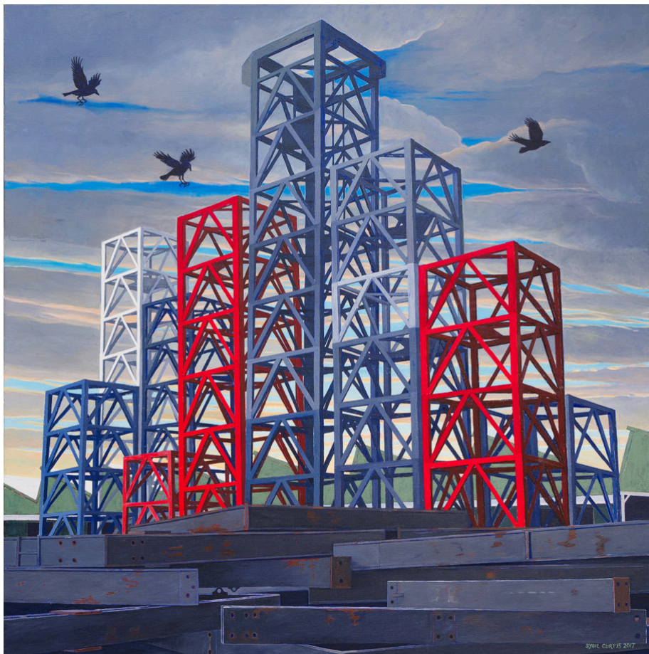
Three flew over (Summer Park, Brisbane) 2017, Oil on canvas, 125 × 125 cm