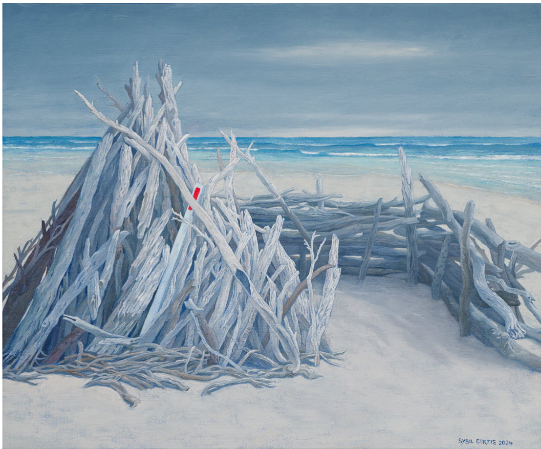
Walled by driftwood (Scamander, Tasmania) 2024, Oil on canvas, 70 × 85 cm