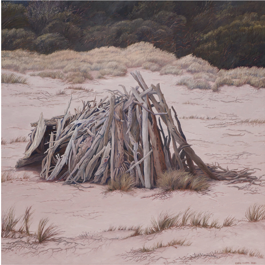
Structure in the dunes (Falmouth, Tasmania) 2020, Oil on canvas, 100 × 100 cm