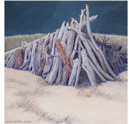
Diamond of driftwood (Central Coast, NSW) 2024, Oil on canvas, 35 × 35 cm