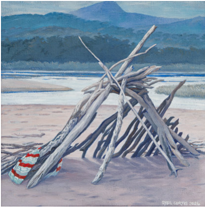
Beach towel (Central Coast, NSW) 2024 Oil on canvas, 35 × 35 cm