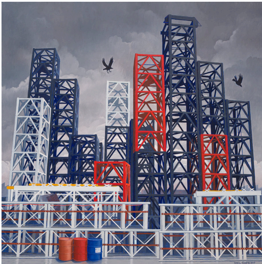
Two flew over (Summer Park, Brisbane) 2017, Oil on canvas, 125 × 125 cm