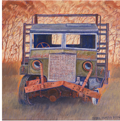
Unhappy truck (East Kunderang, NSW) 2024 Oil on canvas, 35 × 35 cm