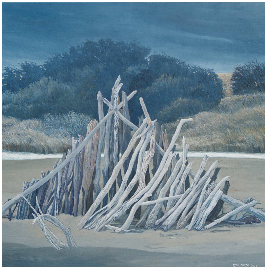
Wave sculpted (Central Coast, NSW) 2024, Oil on canvas, 90 × 90 cm