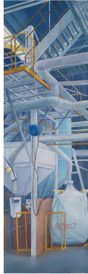
Reject (Nanango, Qld) 2024, Oil on canvas, 150 × 48 cm