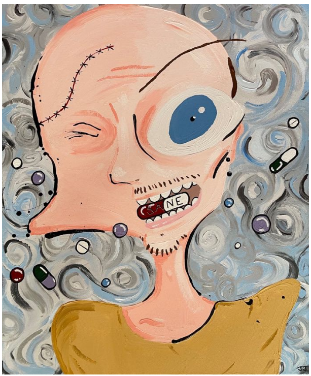
quadriparous 51 x 61 cm $350

Another in a series of self-portraits, this piece depicts the state that I often feel I'm in, following recovery from my severe illness and now living with chronic conditions: held together with poor stitches and a never-ending barrage of pills. But you can't argue with results.