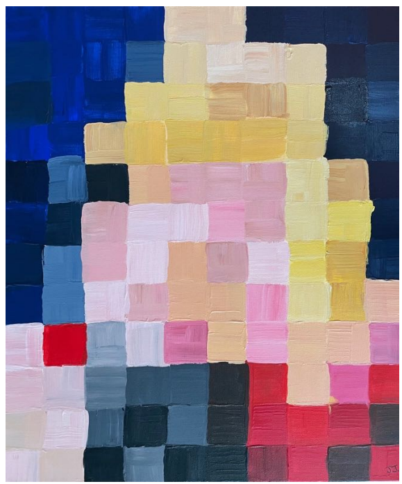
embrace 51 x 61 cm $400

This abstract painting is a pixellated representation of a photo of me and my partner in a loving embrace. It's also a statement on the use of technology in art: every step was done manually and freehand, without computer aid, from assigning the colour of each square to applying the paint in gloriously imperfect lines. If you don't see the figures, try squinting from a step back.