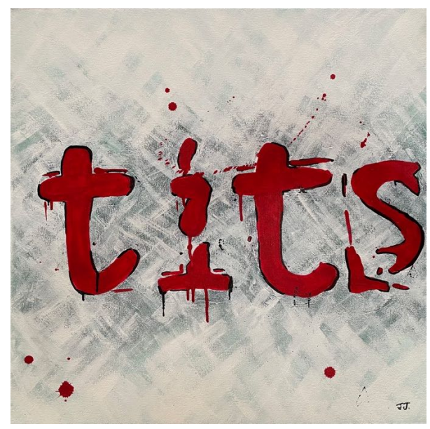
goddess II 51 x 76 cm $350

I created this piece as a semi-goodnatured jab at a studio where I was not allowed to work on a nude (try to guess which one was controversial). The acrylic and ink painting is cheeky and bright to command attention.