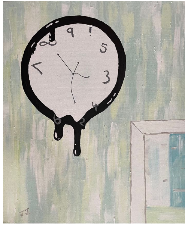
painting is a view from a hospital bed—my only view for nine months a few years ago. Another piece created to process my memories of intensive care, this depicts the sterility, the warping of time, the interminable boredom of that room. I always insisted on being able to see a clock, which was often my only distraction. Looking at this now transports me back to the narrow bed with the cramped pastel view and makes me feel damned lucky to have returned from 'grave'.