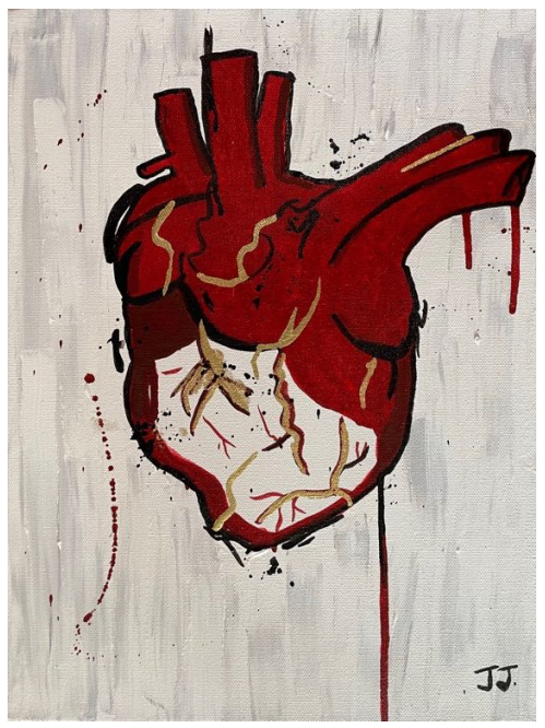
heart 31 x 41 cm $300

This stylised heart may be damaged, but it's being held together with gold. As in the Japanese art of kintsugi, the repair remains visible, and the damage becomes a reminder of the beauty in the changed object. This piece represents physical and emotional recovery.