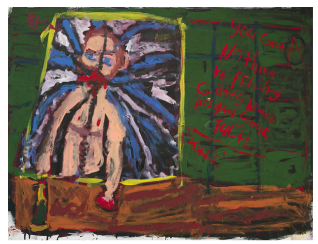
Self-portrait in broken mirror 2024, Acrylic on canvas, 100 × 130 cm

A selection of artworks from the exhibition 'Darkside of the Mirror'.