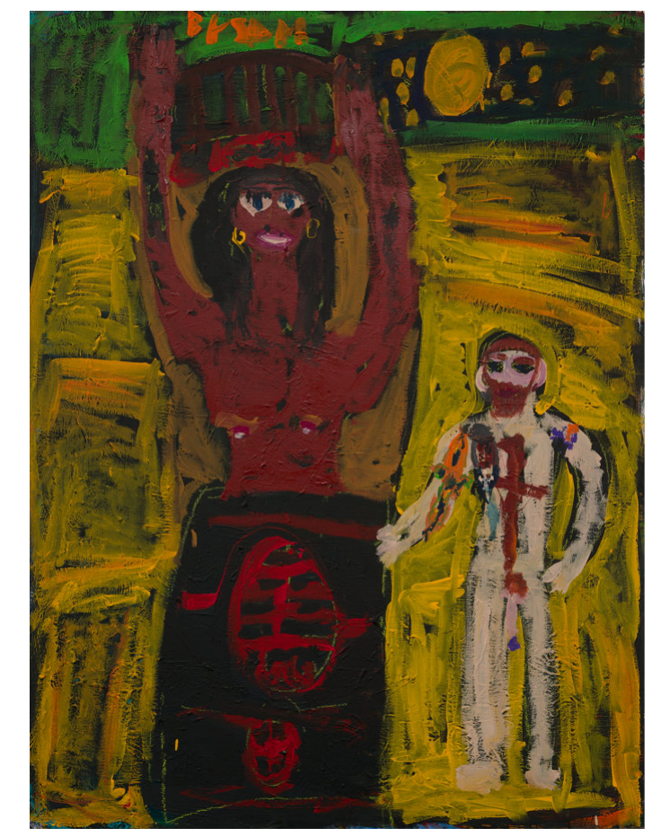
Angela hot summer night's passion 2024, Acrylic on canvas, 122 imes 91.5 cm