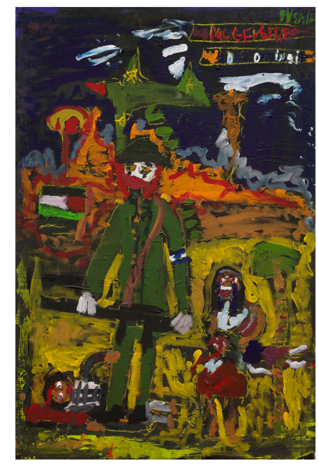
McGenocide, IDF Lovin' It 2024, Acrylic on canvas, 122.5 × 81.5 cm