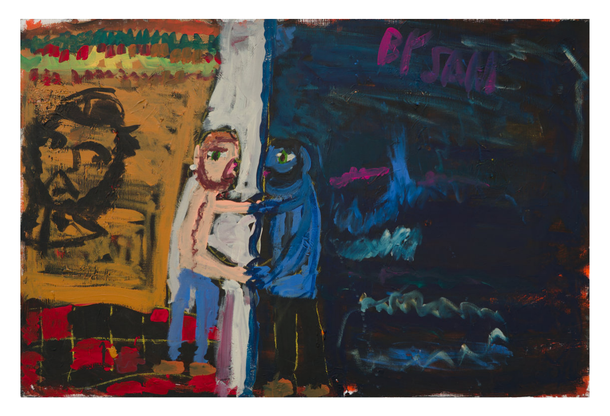
SAM BULLOCK Darkside of the Mirror