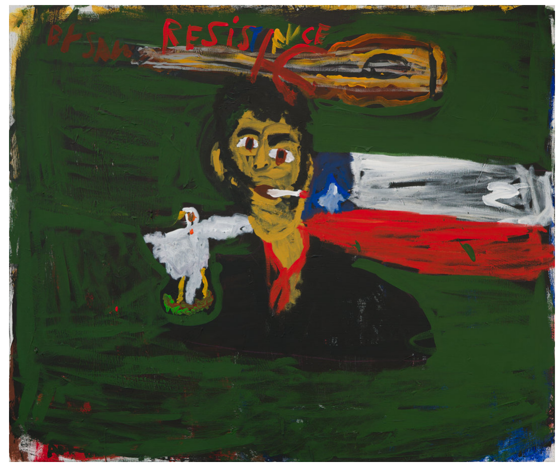
Victor Jara, music of resistance 2024, Acrylic on canvas, 100.5 \times 120 \text{ cm}