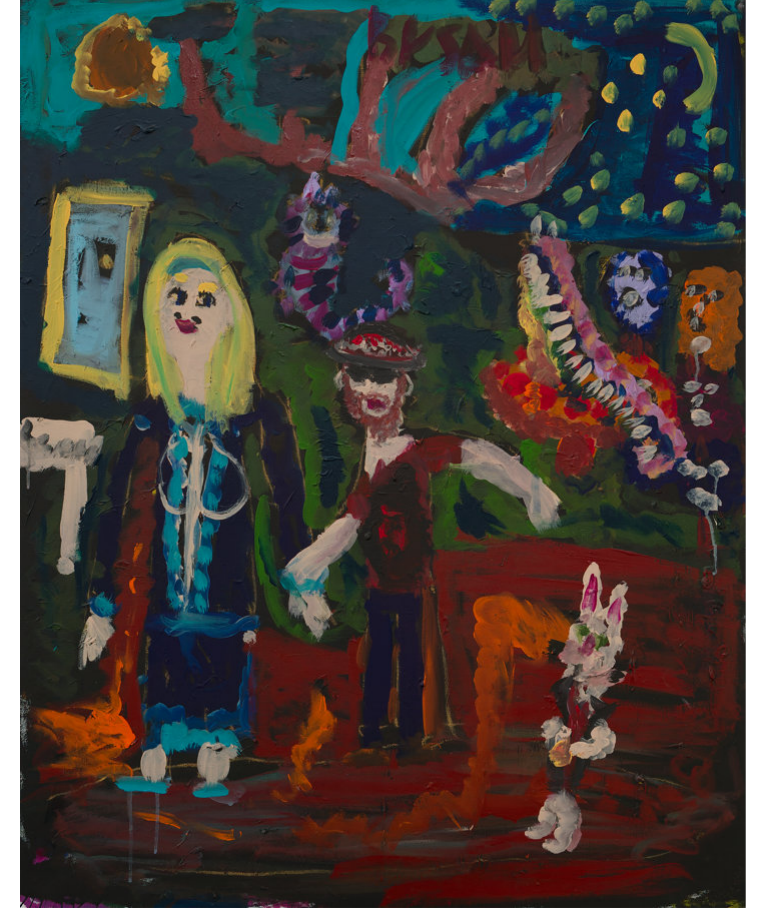
Self-portrait with Alice in Wonderland 2024, Acrylic on canvas, 113.5 × 90 cm

Also heavily influenced by Karl Marx and his theory of dialectical materialism which is grounded by absolutes within our own reality.