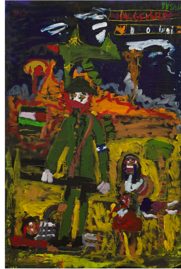
McGenocide, IDF Lovin' It 2024, Acrylic on canvas, 122.5 × 81.5 cm