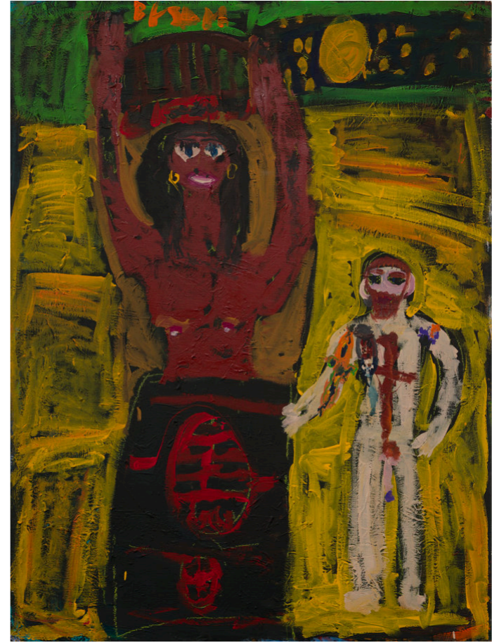
Angela hot summer night's passion 2024, Acrylic on canvas, 122 × 91.5 cm