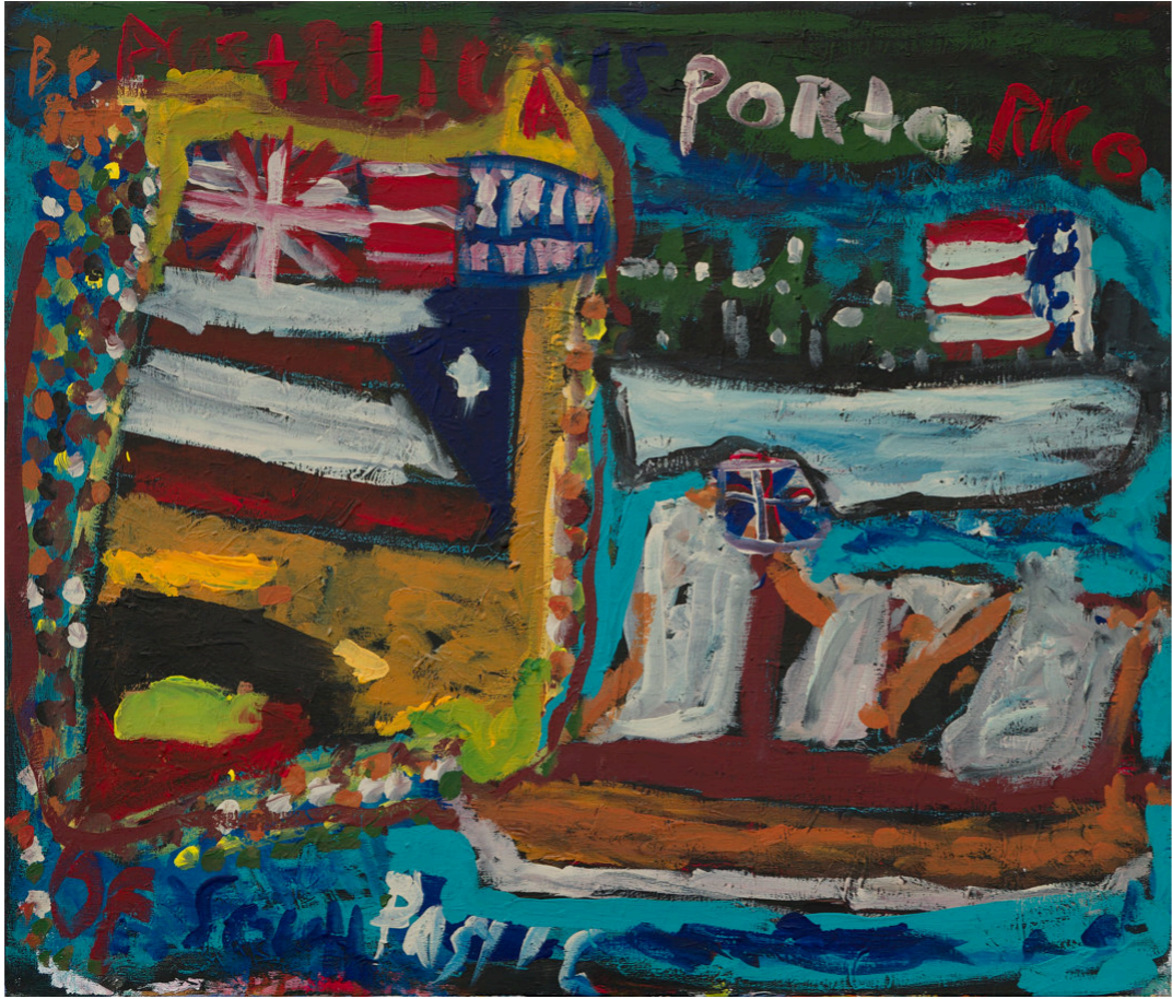
Australia, Porto Rico of the South Pacific 2024, Acrylic on canvas, 86.5 × 101.5 cm