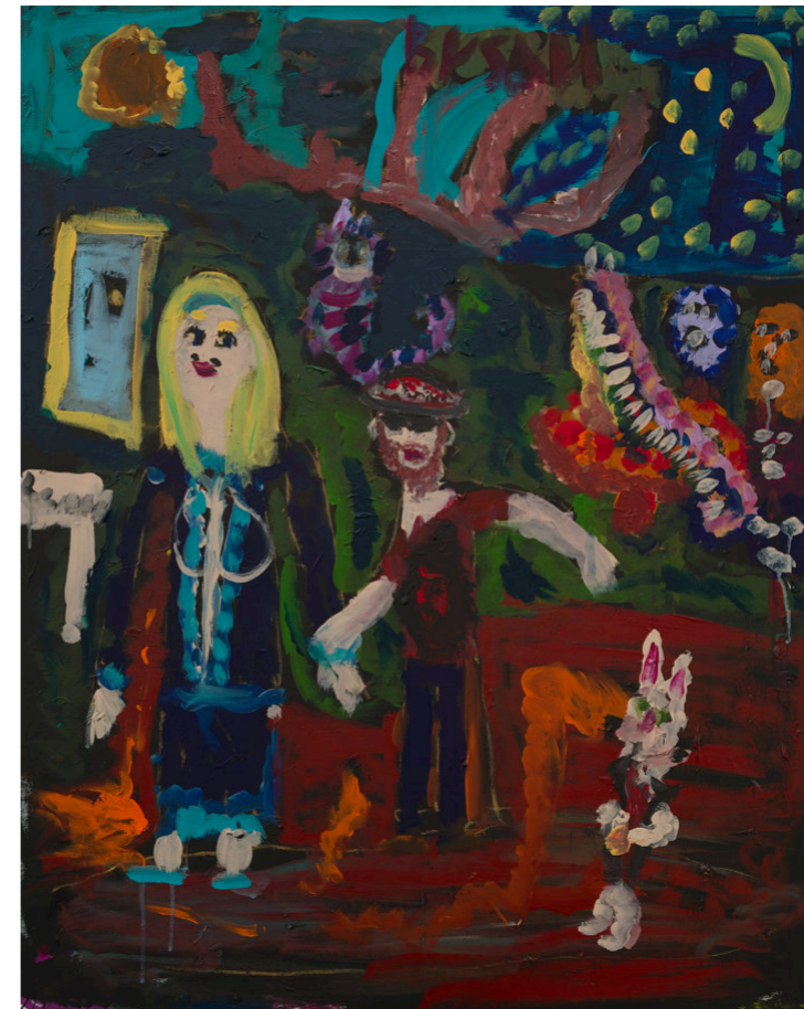
Self-portrait with Alice in Wonderland 2024, Acrylic on canvas, 113.5 × 90 cm

Cover image: Darkside of the Mirror 2024, Acrylic on canvas, 82 × 123 cm