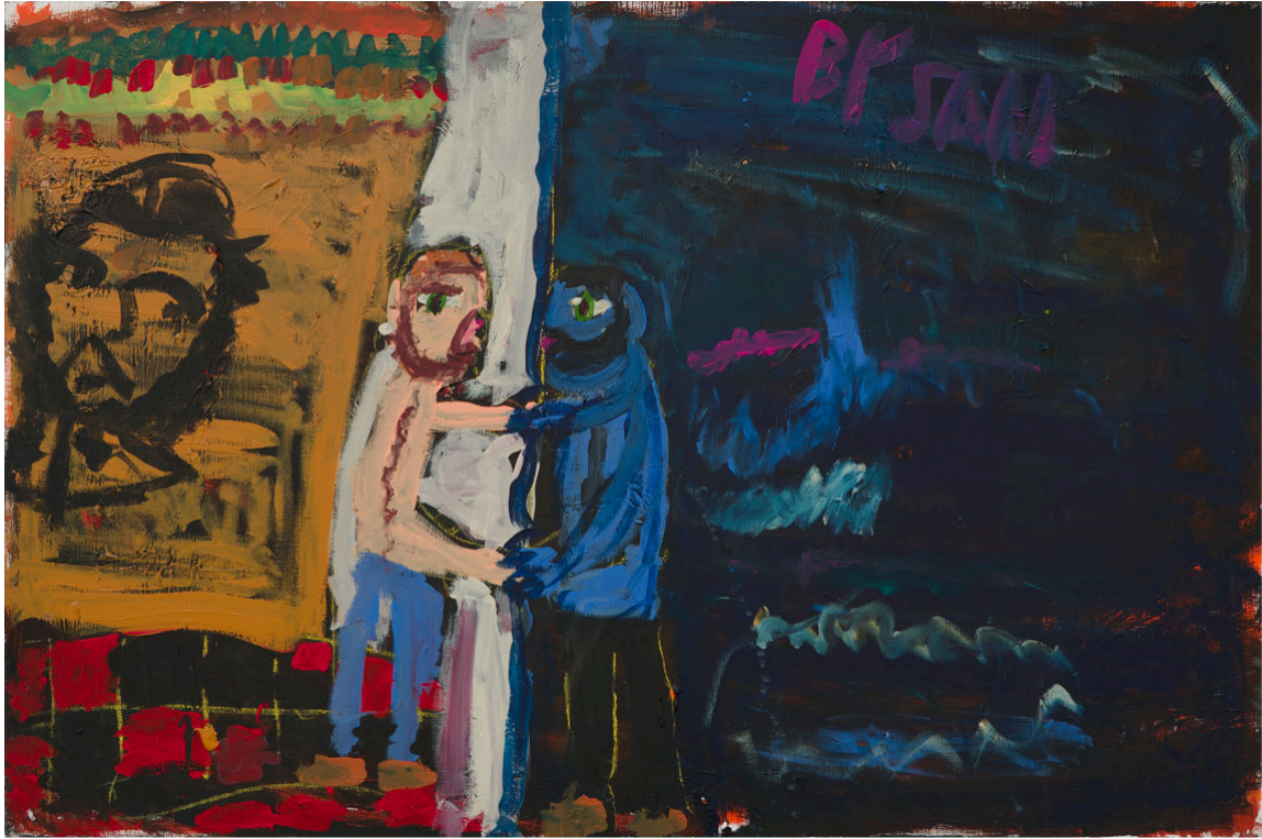
SAM BULLOCK Darkside of the Mirror