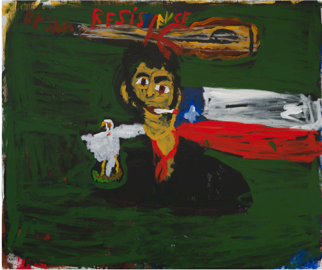
Victor Jara, music of resistance 2024, Acrylic on canvas, 100.5 × 120 cm