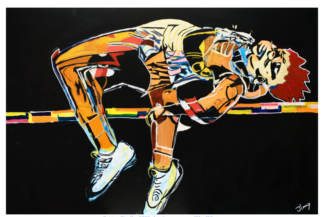
Raising The Bar 2025, Acrylic on canvas, 101 x 153 cm