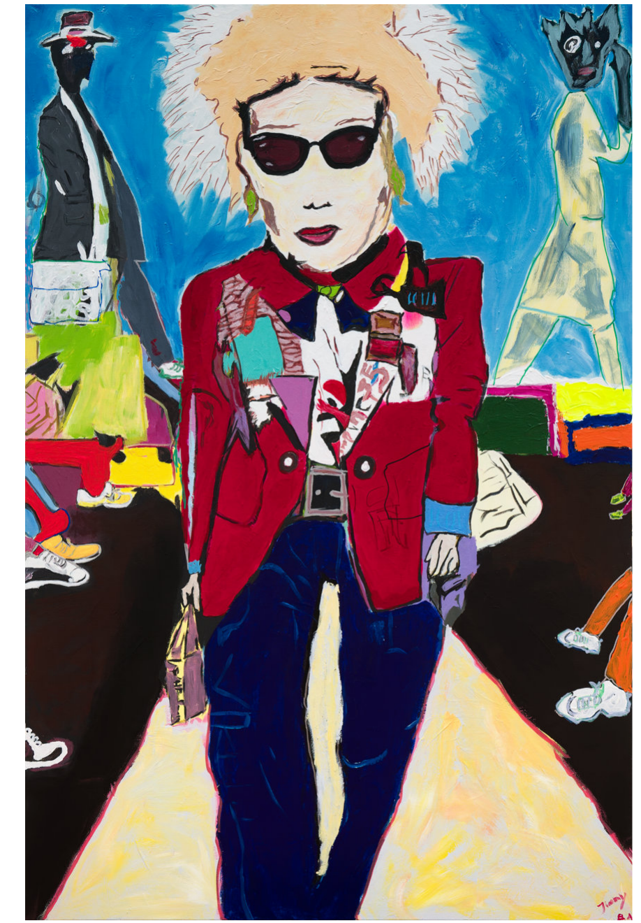
Fashionista 2024, Acrylic on canvas, 152.5 x 101 cm