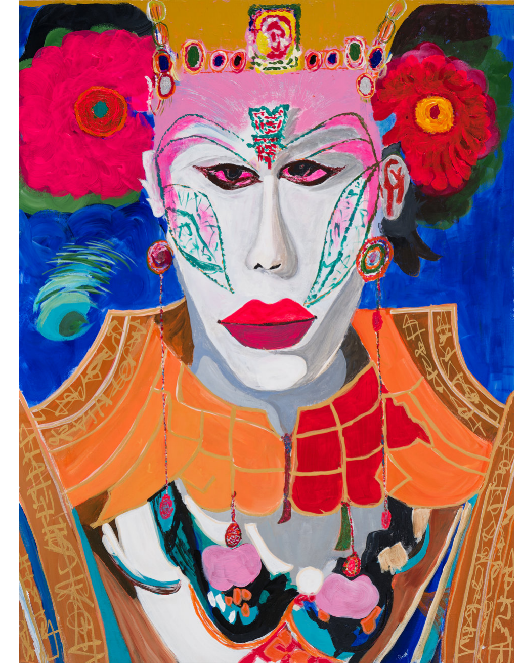
The Venetian 2024, Acrylic on canvas, 122 × 91 cm