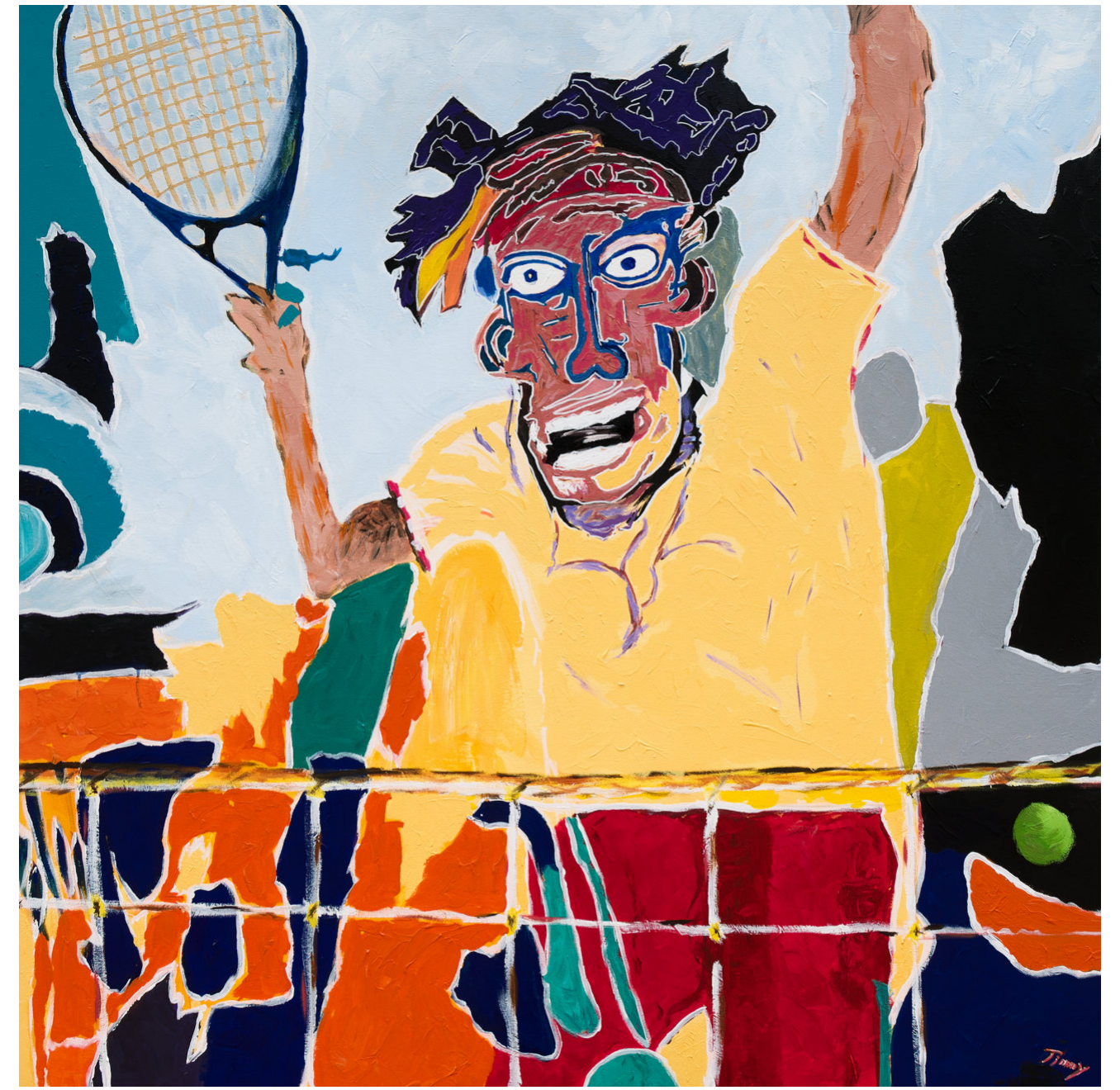
Game, Set & Match 2024, Acrylic on canvas, 140 x 140 cm