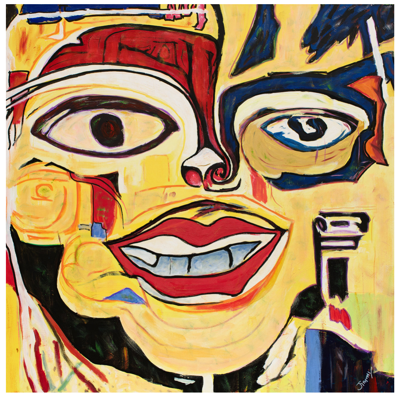
Selfie 2024, Acrylic on canvas, 101.5 x 103 cm