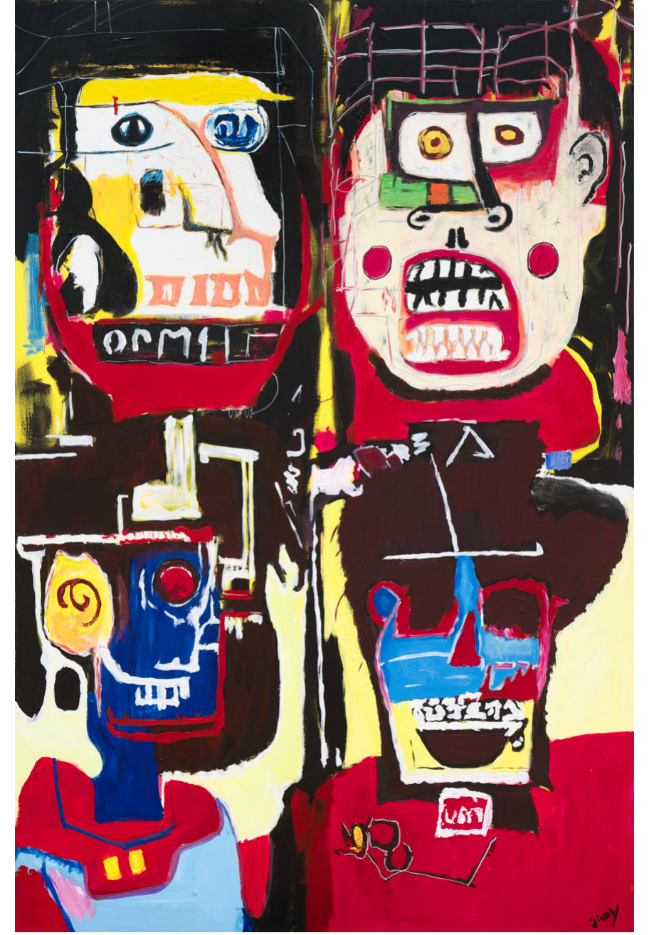
The Band 2024, Acrylic on canvas, 152.5 x 101 cm