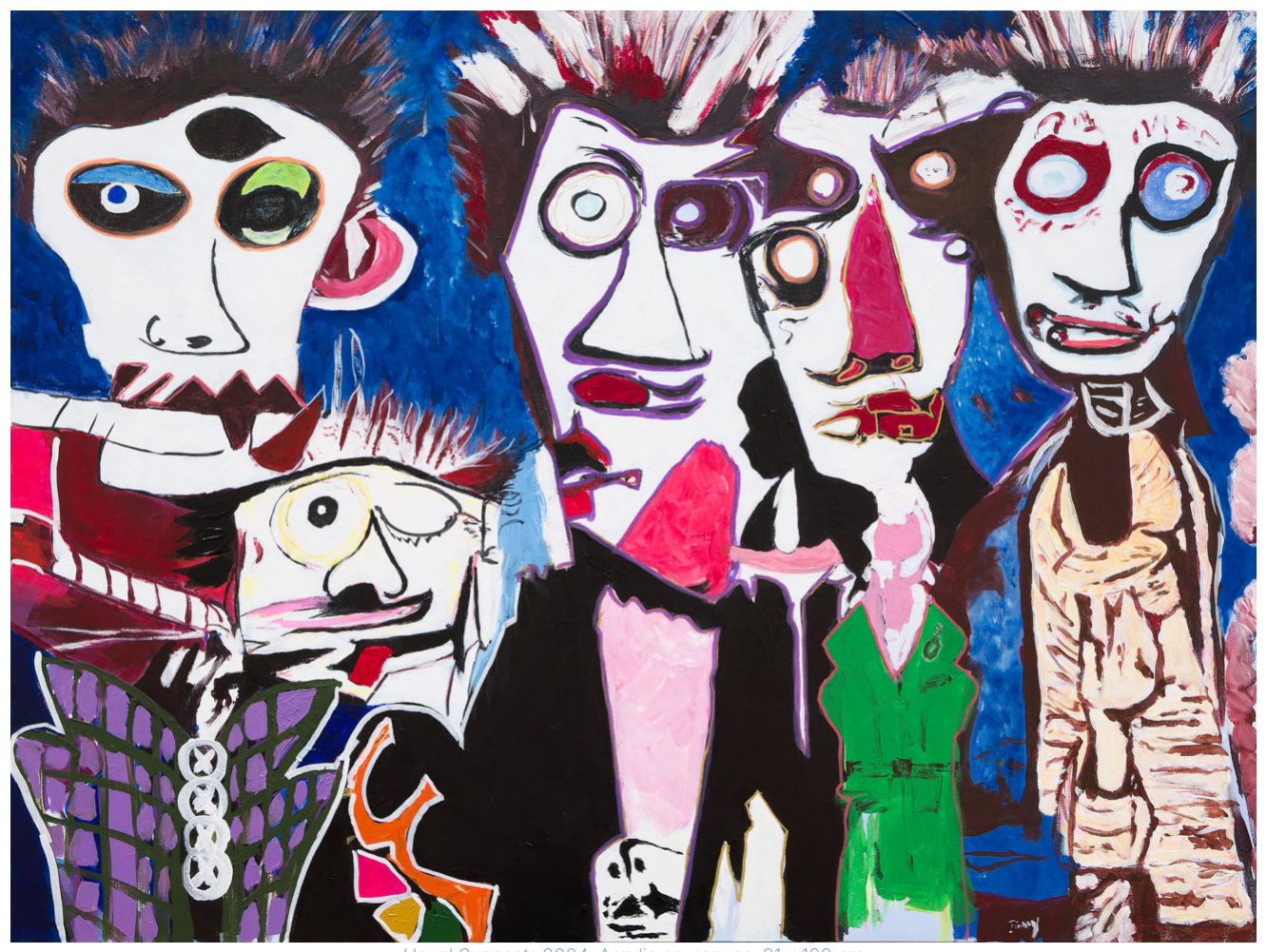
Usual Suspects 2024, Acrylic on canvas, 91 x 122 cm