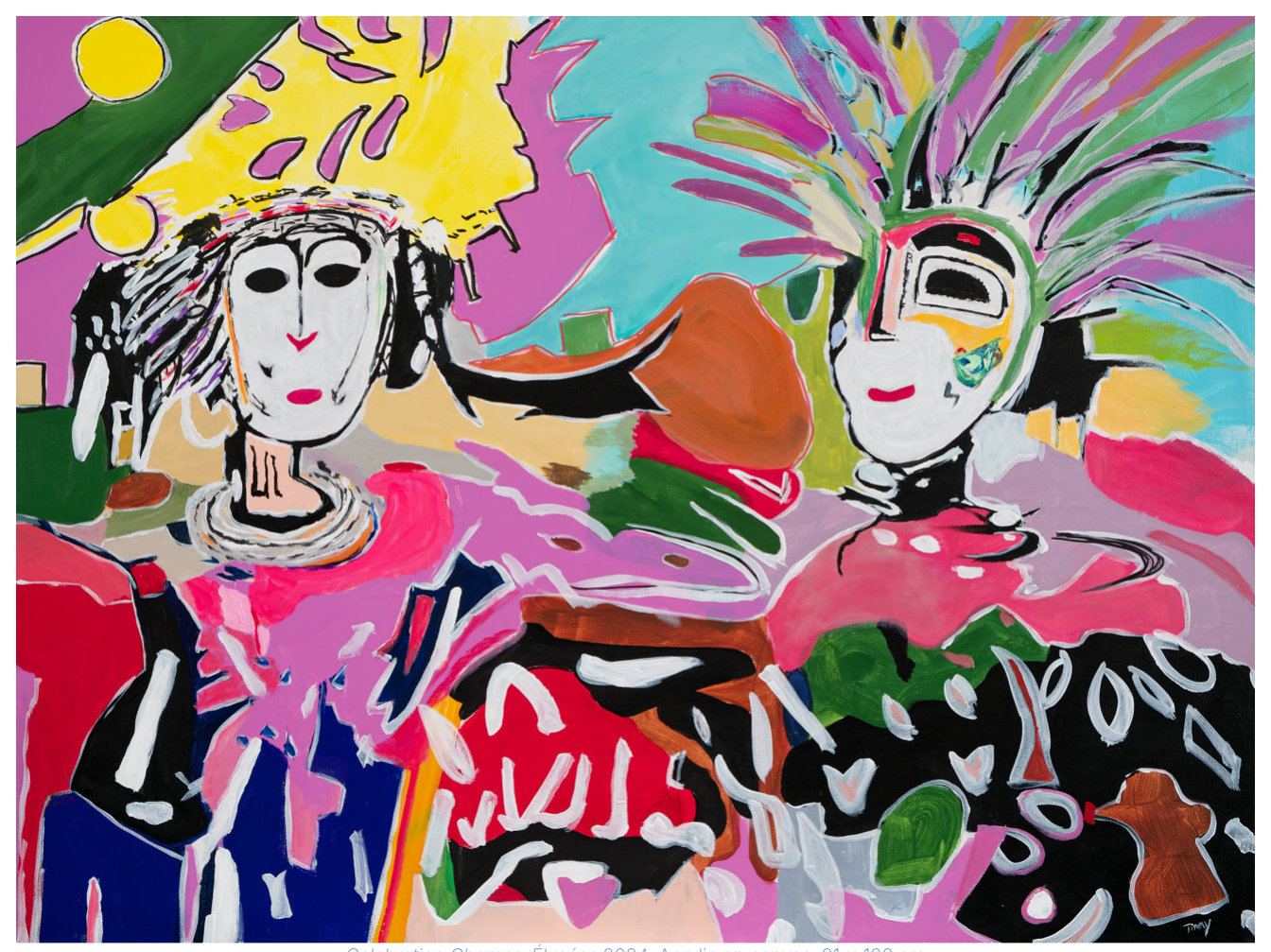
Celebration Champs-Élysées 2024, Acrylic on canvas, 91 × 122 cm