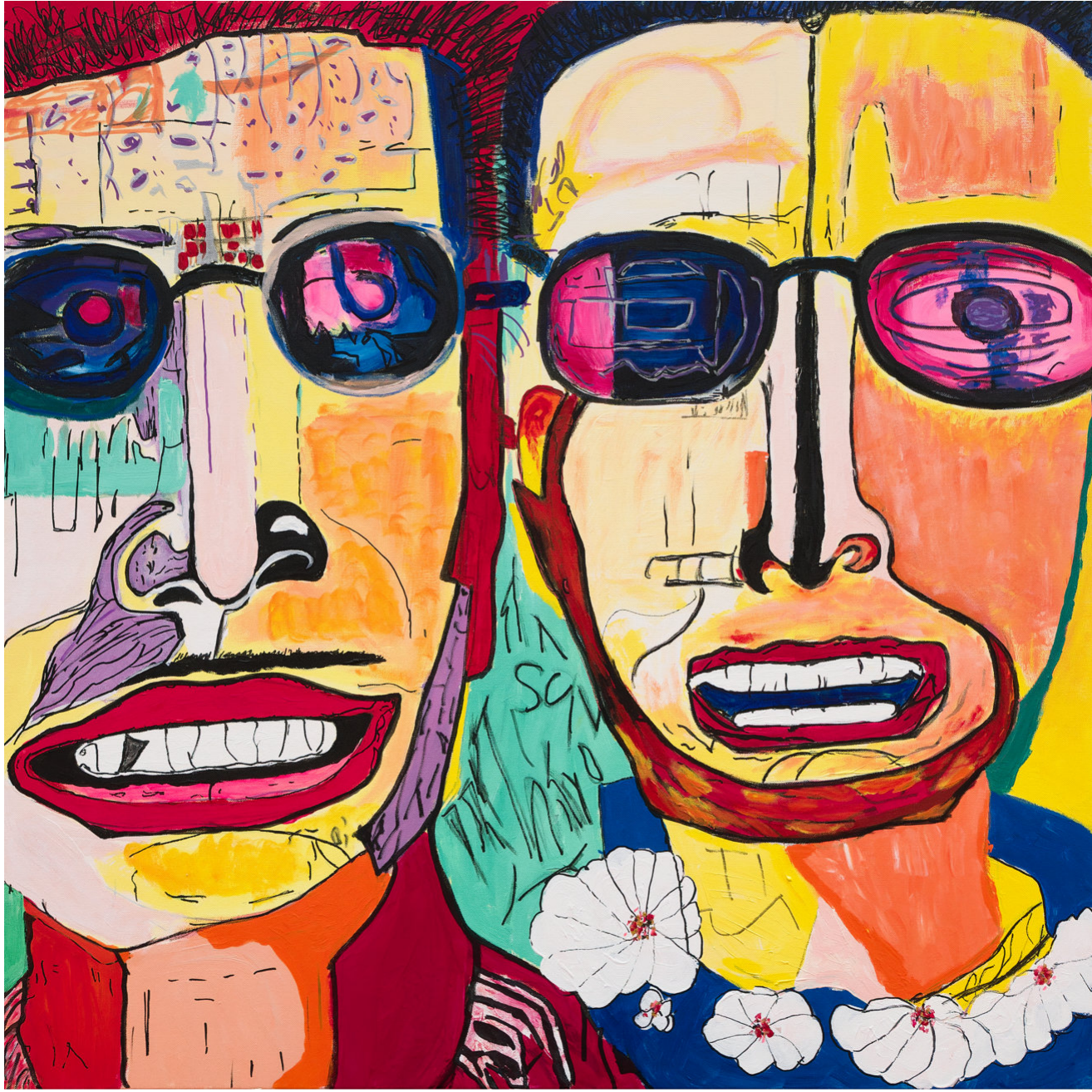
Tourists 2025, Acrylic on canvas, 101.5 x 101.5 cm