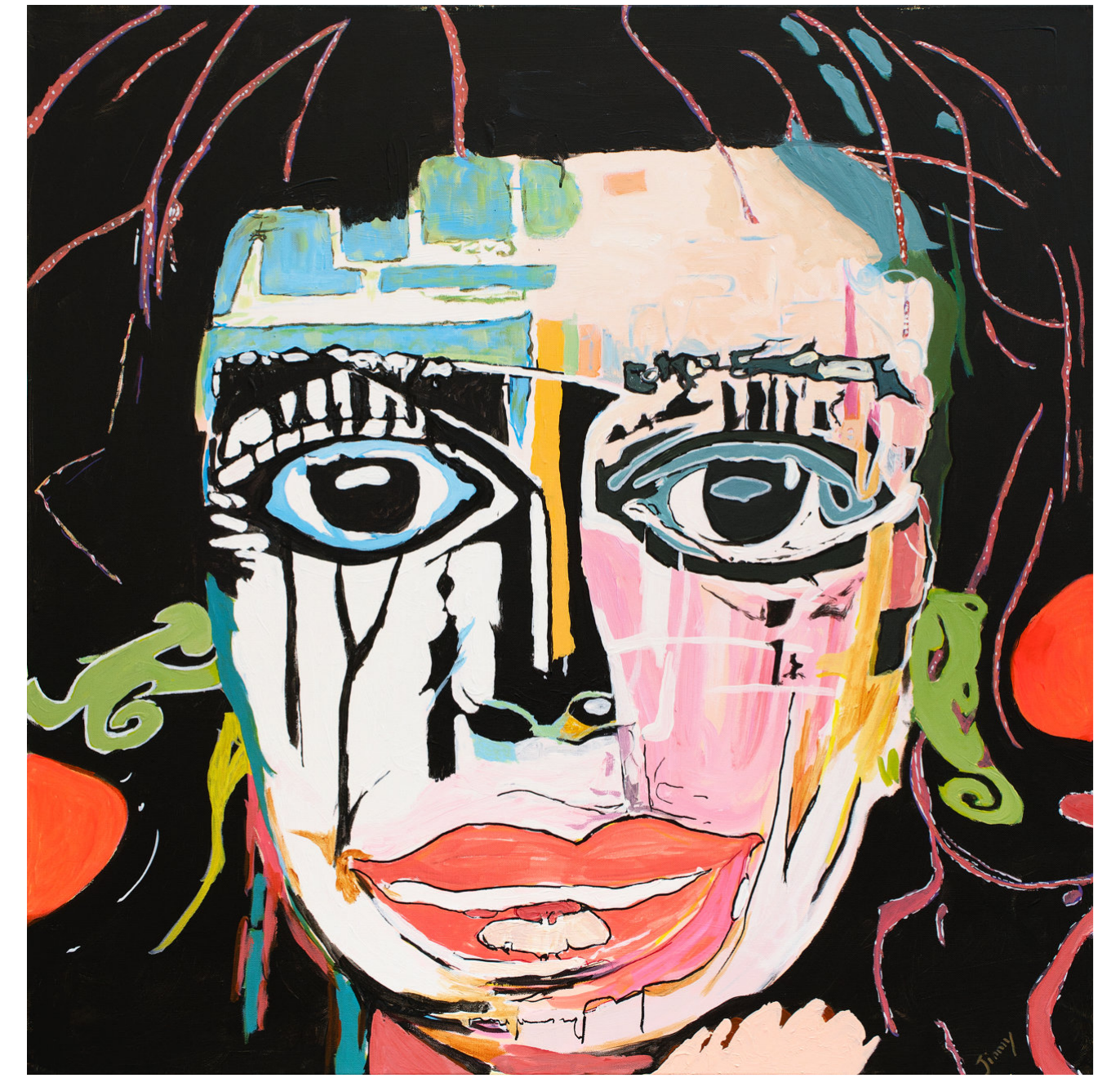
Looking For Love 2025, Acrylic on canvas, 91.5 x 91 cm