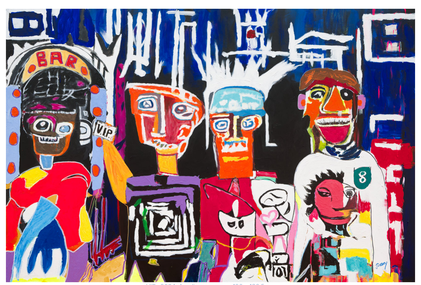
VIPs 2024, Acrylic on canvas, 120 x 180.5 c