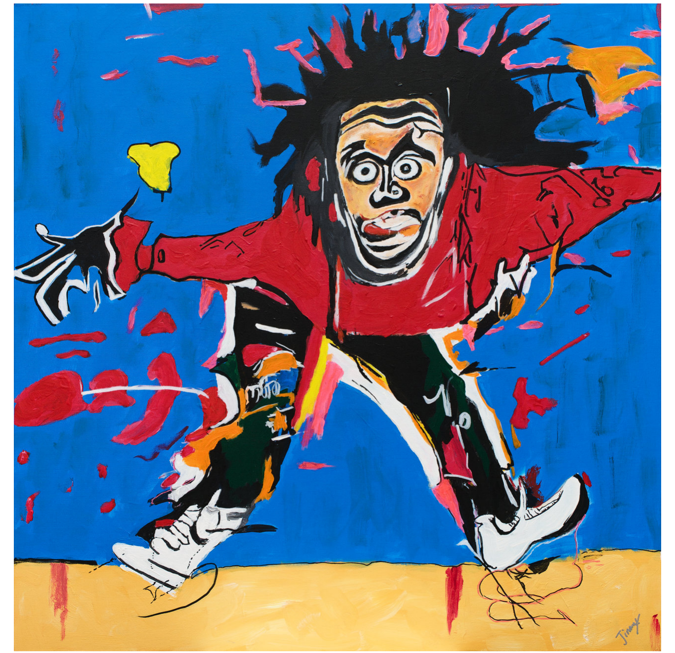
Hip Hop 2025, Acrylic on canvas, 101 x 102.5 cm