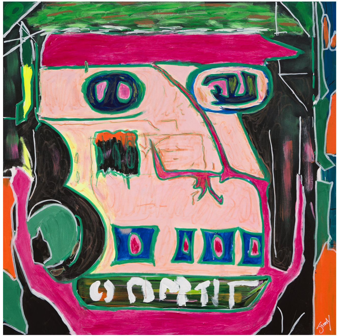
The Loner 2024, Acrylic on canvas, 91 x 91 cm