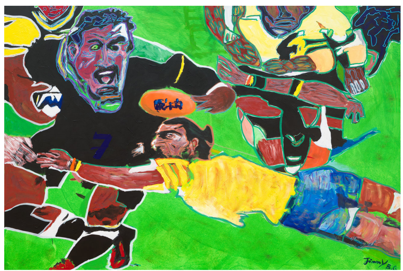
Fifth Tackle 2024, Acrylic on canvas, 121.5 x 182 cm