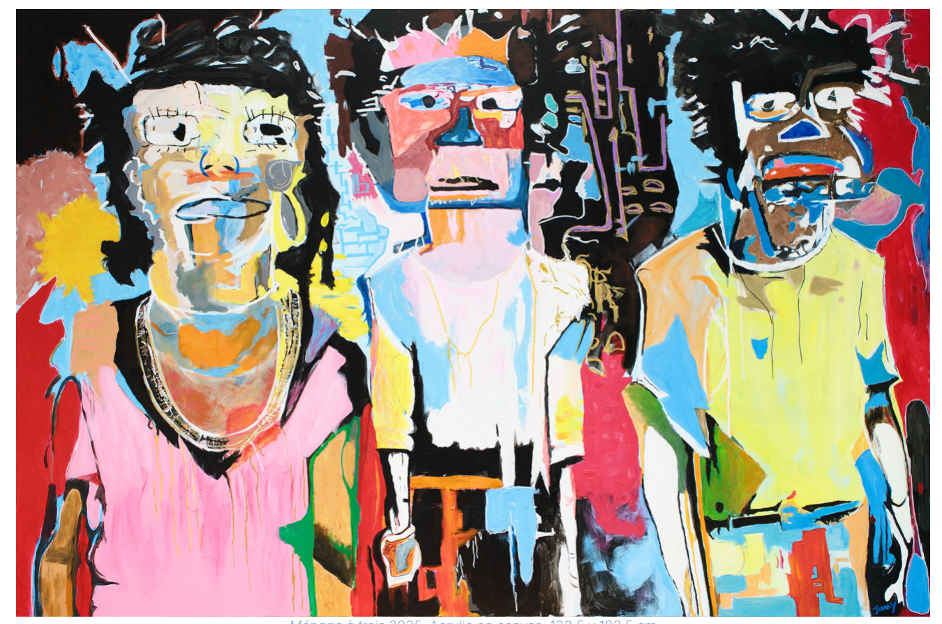
Menage a trois 2025, Acrylic on canvas, 122.5 x 182.5 cn