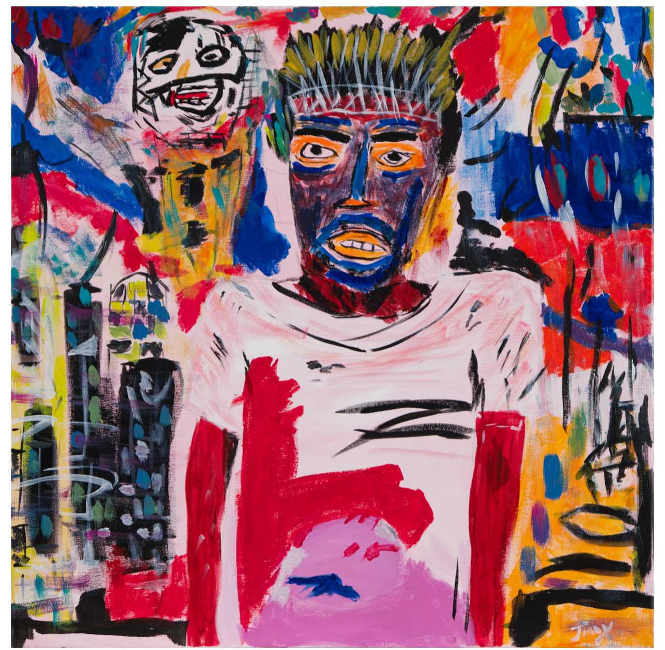
TV Presenter (Times Square) 2024, Acrylic on canvas, 61 × 61 cm