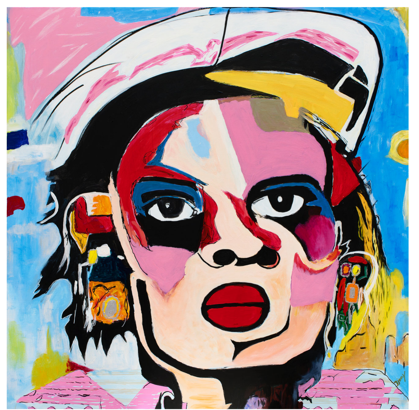
Titanic 2025, Acrylic on canvas, 122 x 122 cm