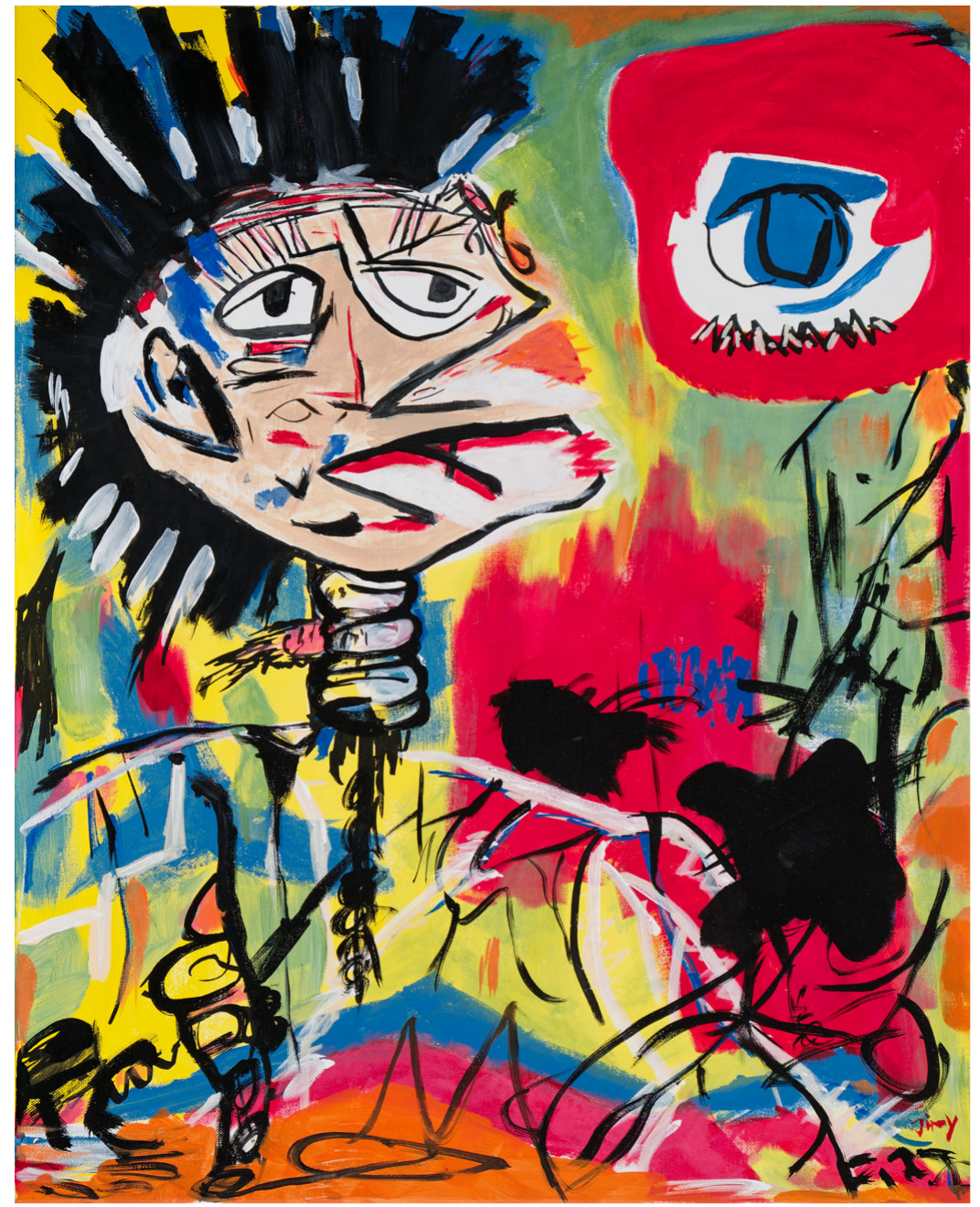
The Doctor 2024, Acrylic on canvas, 76 × 61 cm