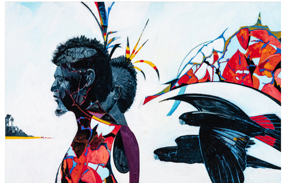
Black Birds – Black Birding 2024 , Acrylic on canvas, 61 x 91.5 cm