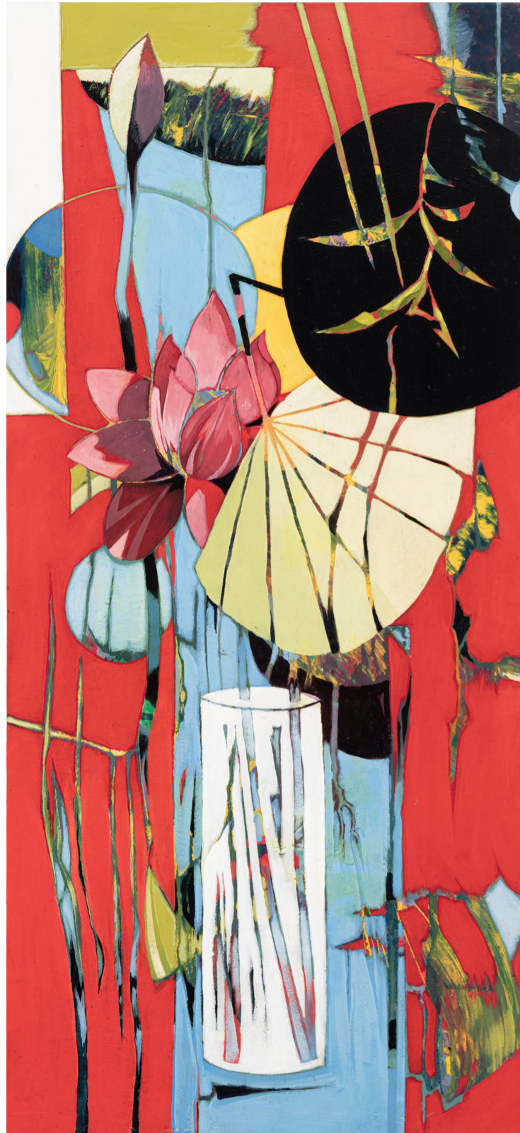
Lotus and Bud 2024 Acrylic on canvas, 103 x 47 cm