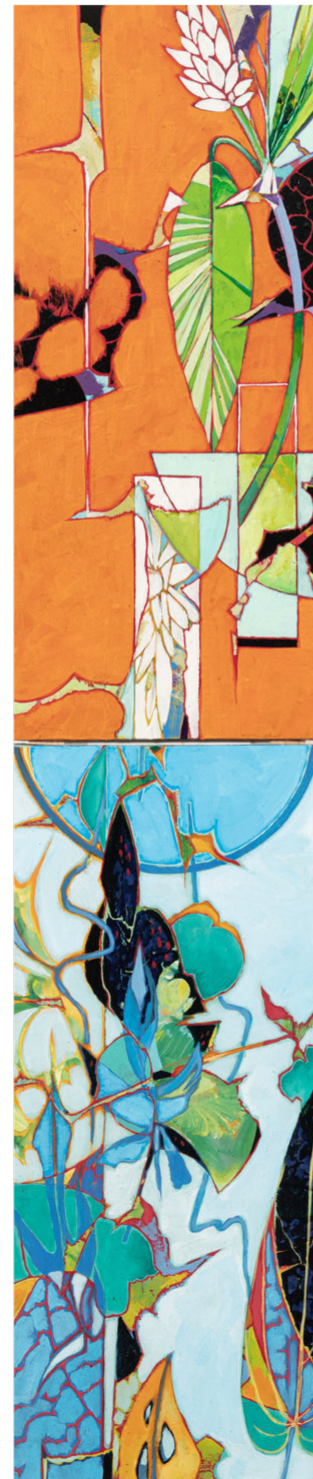
top: Ginger Flowers in a Vase and on a Vase 2024 Acrylic on canvas, 61 x 26 cm bottom: Tangled up in Blue 2024 Acrylic on canvas, 61 x 26 cm