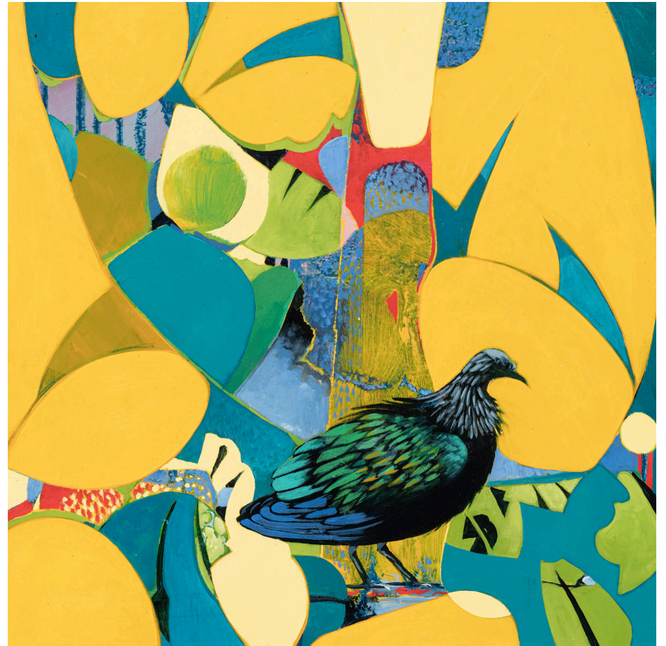
Nicobar Pigeon on Green Island 2024, Acrylic on canvas, 61 x 61 cm