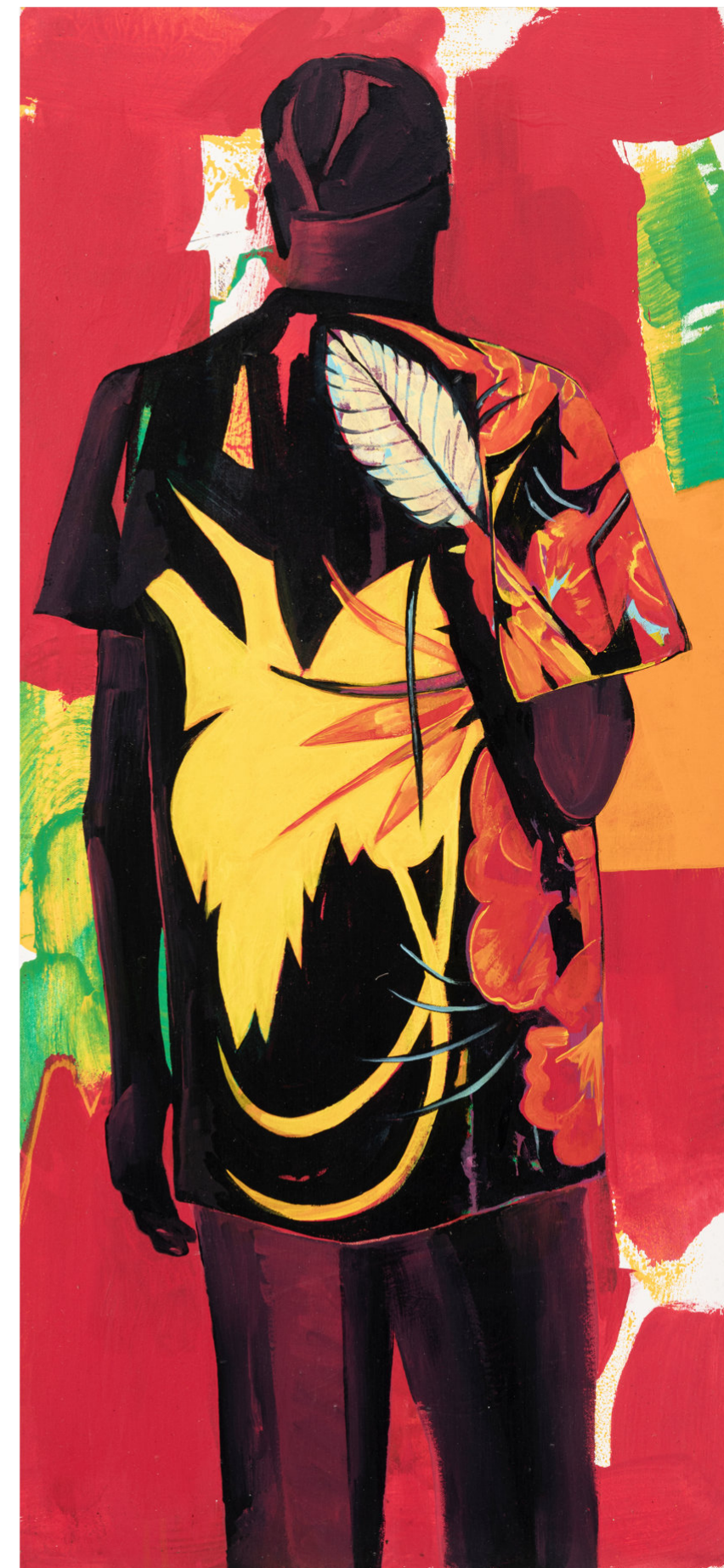
Good Friday's Outfit at Rusty's 2023 Acrylic on canvas, 103 x 47 cm