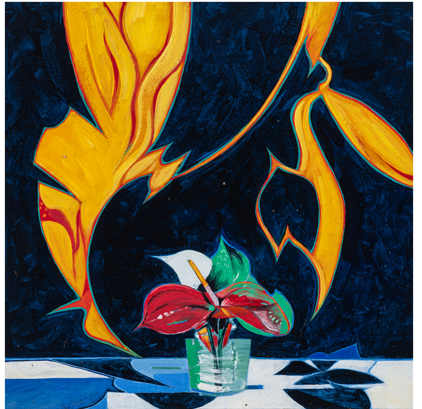
Anthuriums in a Glass Cup 2024, Acrylic on canvas, 50 x 50 cm