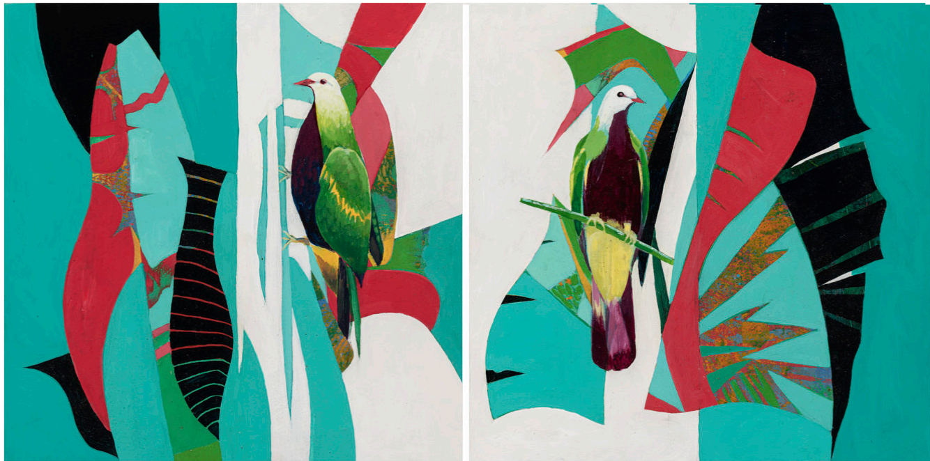
Wompoo Pigeon 1 & 2 2023, Acrylic on canvas, 47.5 x 47.5 cm each