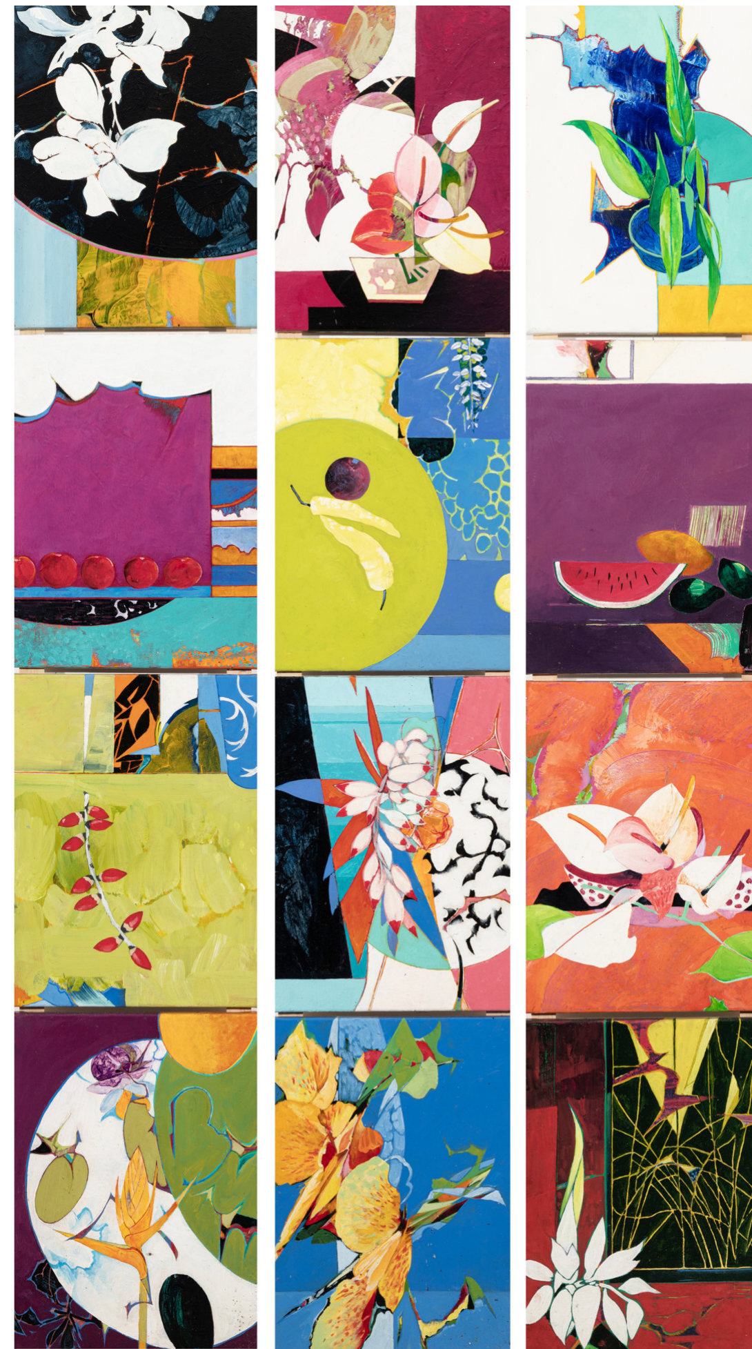
Sunday Painting Still Lifes 2024 , Acrylic on canvas, 40 x 30 cm each

Cover image: Local Birds Not Giving a Fig 1 – 12 2025 , Acrylic on PVC, dimensions variable