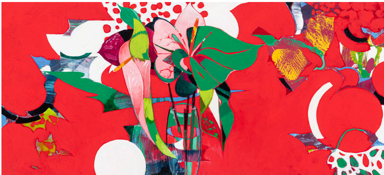
Anthurium 2024, Acrylic on canvas, 47 x 103 cm