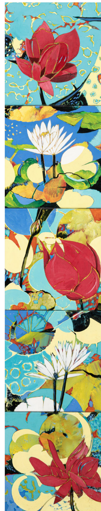
Lotus Lily 1 2023 Water Lily 1 2023 Lotus Lily 2 2023 Water Lily 2 2023 Lotus Lily 3 2023 Acrylic on canvas 30 x 30 cm each