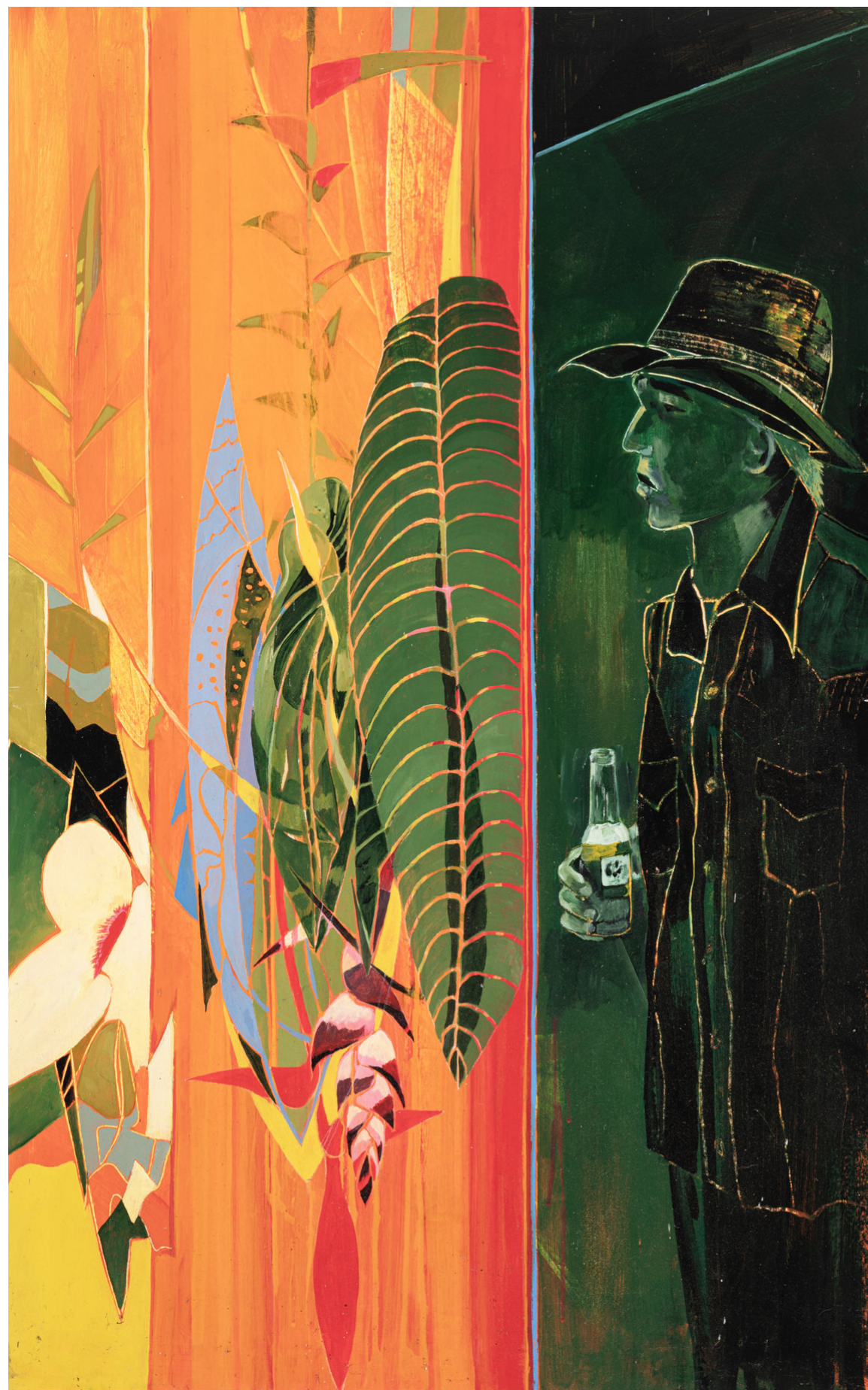
Flowers for Michael 2024, Acrylic on canvas, 114 x 72 cm