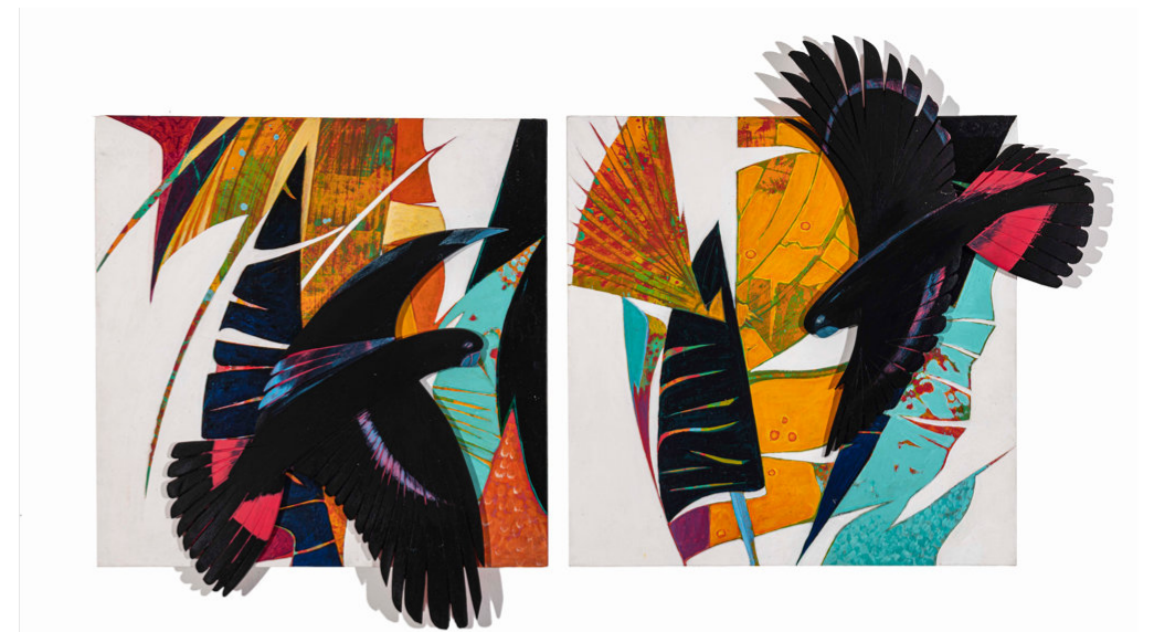
Red Tailed Black Cockatoo Flying 1 & 2 2024 , Acrylic on canvas and PVC, 46 x 46 cm