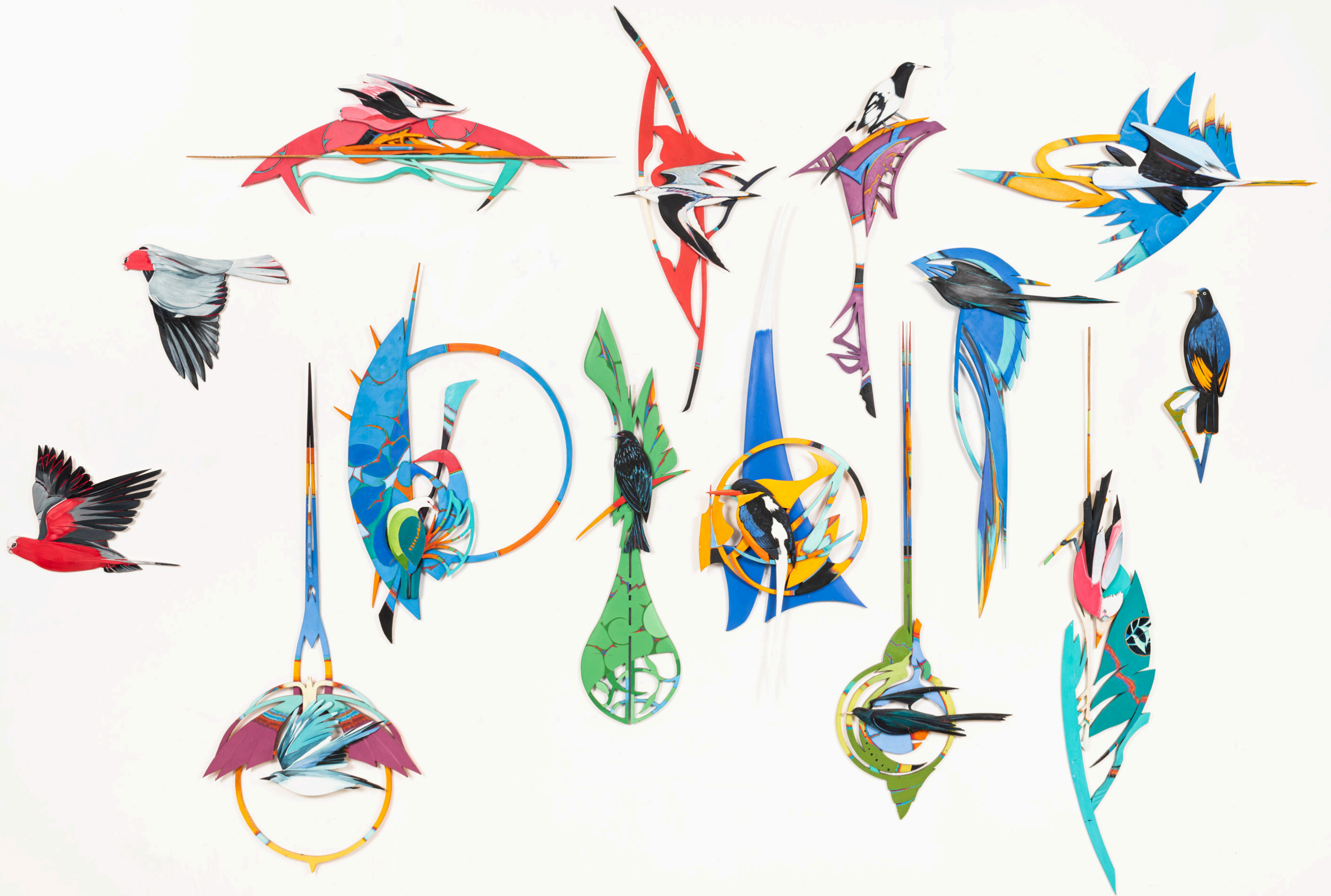
Local Birds Not Giving a Fig 1 – 14 2025, Acrylic on PVC, dimensions variable