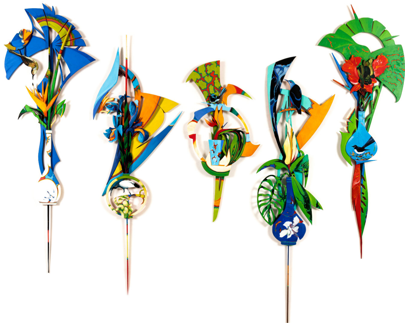
Still Life Suite 1 – 5 2025, Acrylic on PVC, dimensions variable