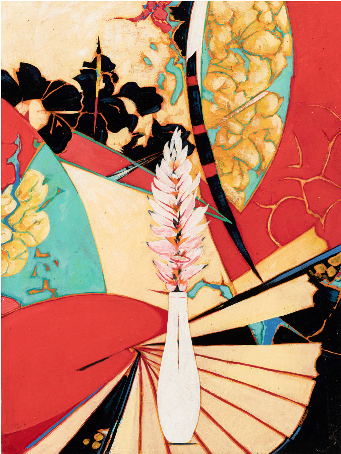
White Ginger in a White Vase 2024, Acrylic on canvas, 61 x 46 cm