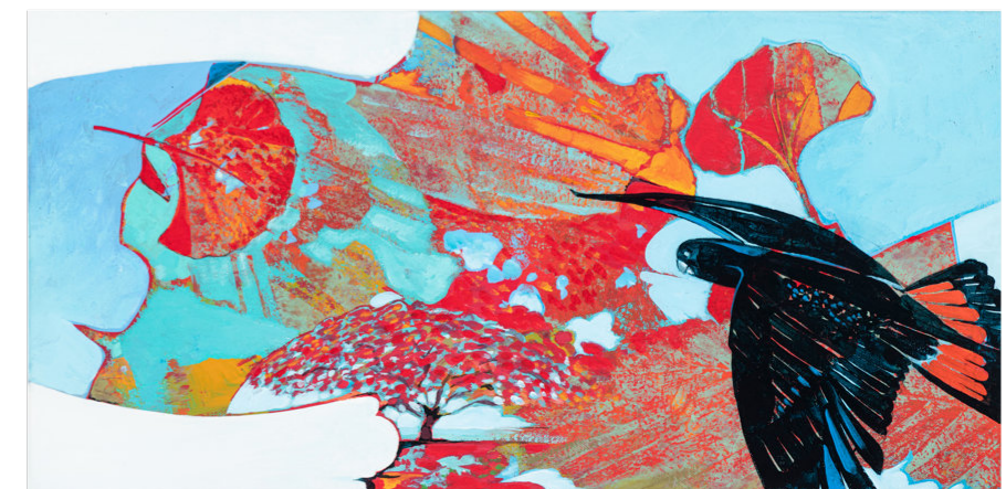
Red Tailed Black Cockatoo and Poinciana 2024 , Acrylic on canvas, 30 x 61 cm