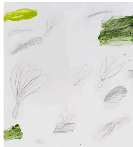
Garden II 2024, 87 x 78 cm