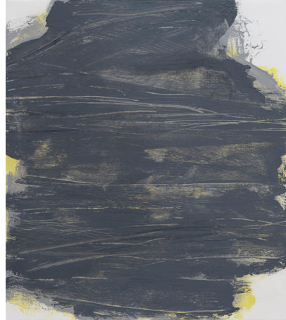
After Fire IV 2023, 50 x 44 cm