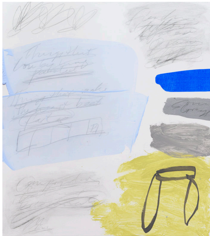
Two Lists 2024, 71 x 64 cm