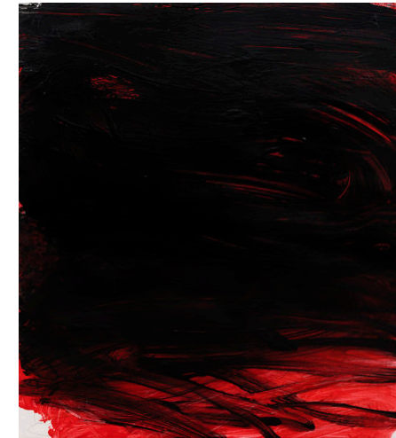
Warialda (Nightfall) 2025, 71 x 64 cm