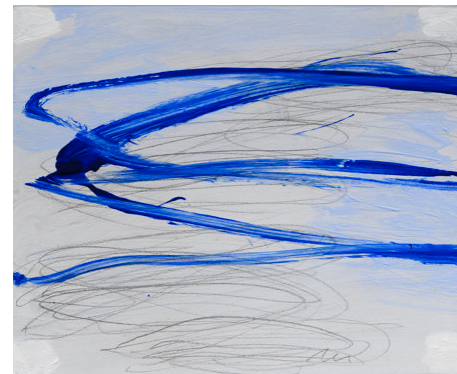
Anemoi III 2025, 32 x 39 cm