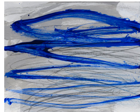
Aeolus 2025, 32 x 39 cm