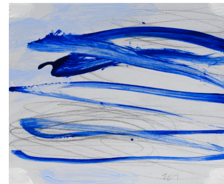
Anemoi IV 2025, 32 x 39 cm