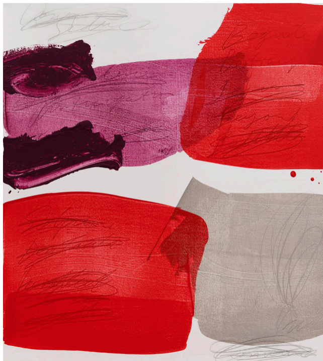
Beguile 2024, 71 x 64 cm