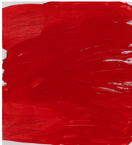
Studio List 2024, 71 x 64 cm