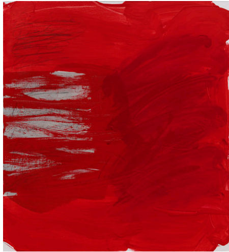
Phaistos 2024, 71 x 64 cm