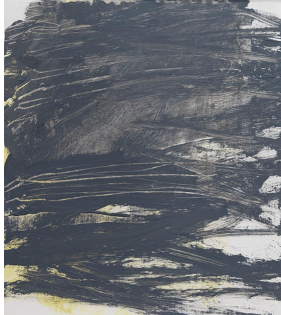
After Fire III 2023, 50 x 44 cm