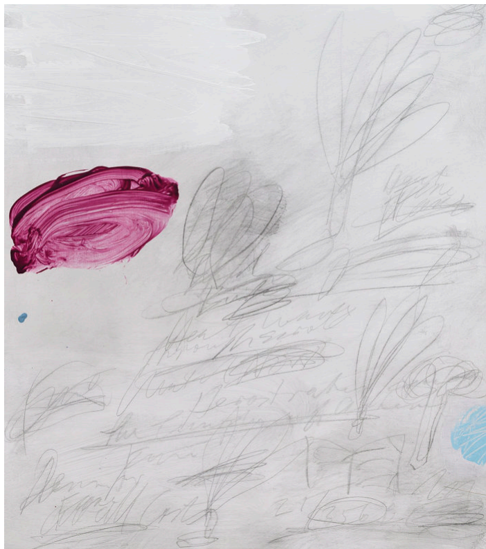
Temple 2024, 71 x 64 cm