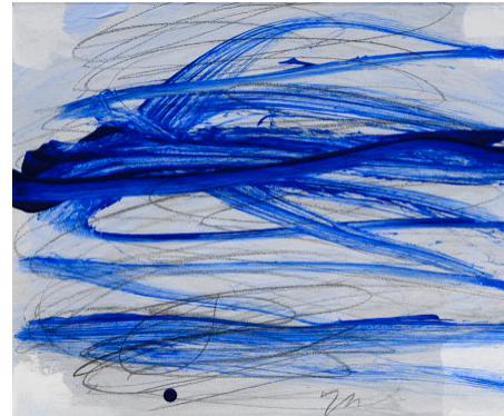
Anemoi I 2025, 32 x 39 cm