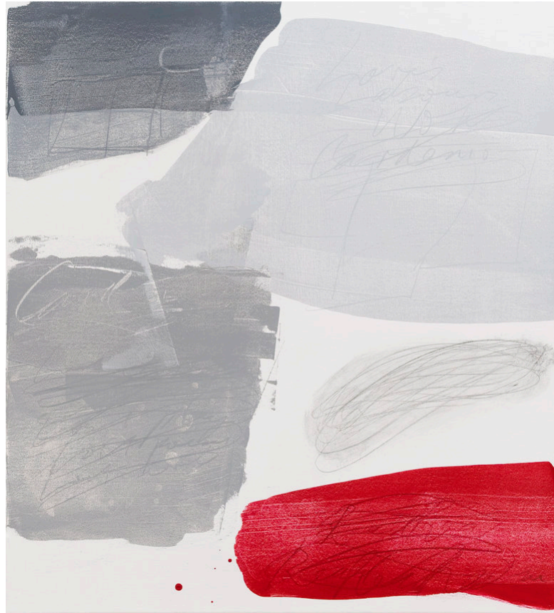
MOSTYN BRAMLEY-MOORE Stimming