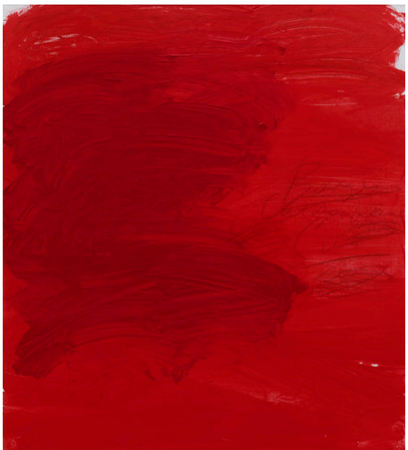
Sur 2023, 71 x 64 cm