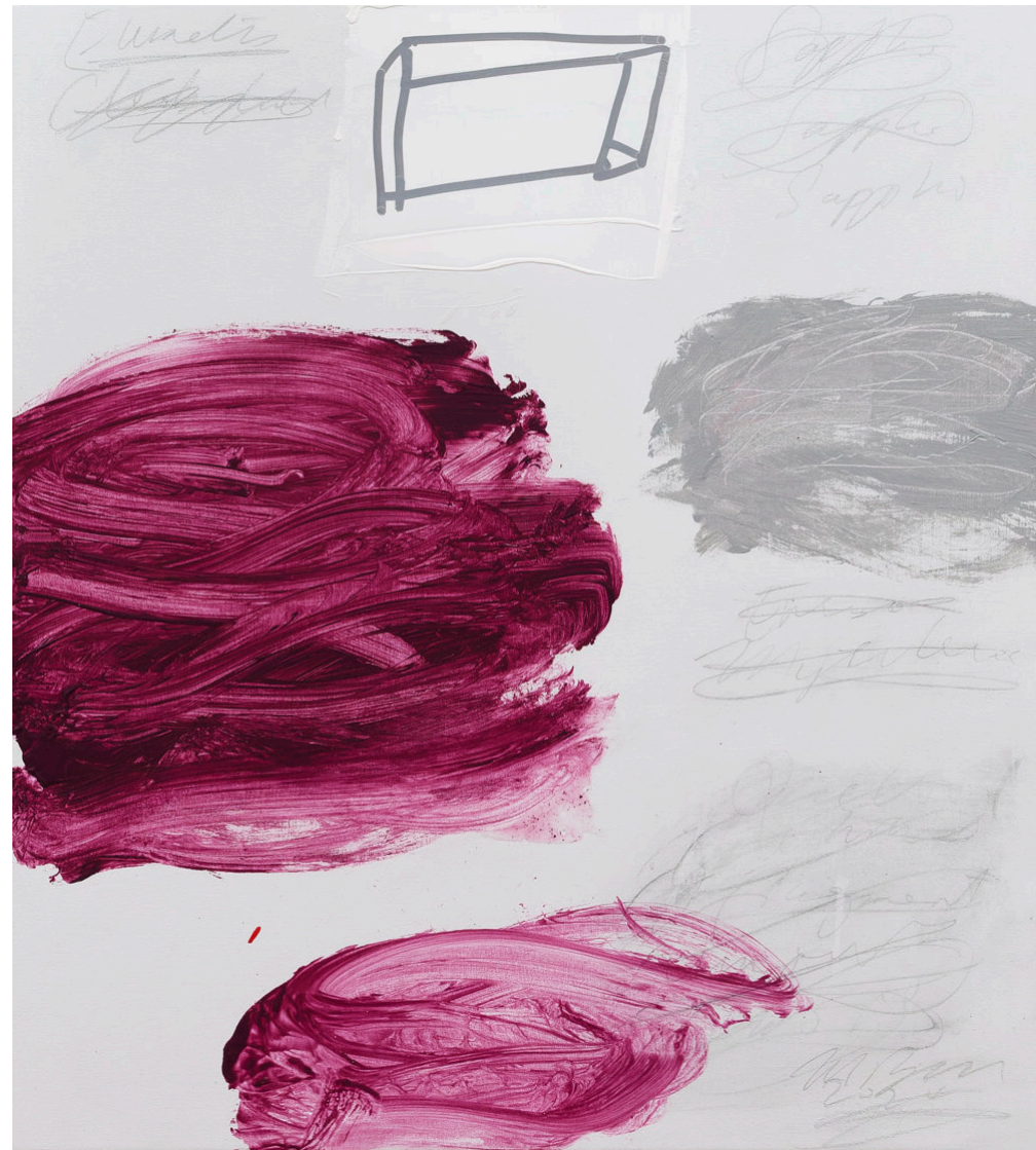
Sappho and Eumetis 2024, 71 x 64 cm