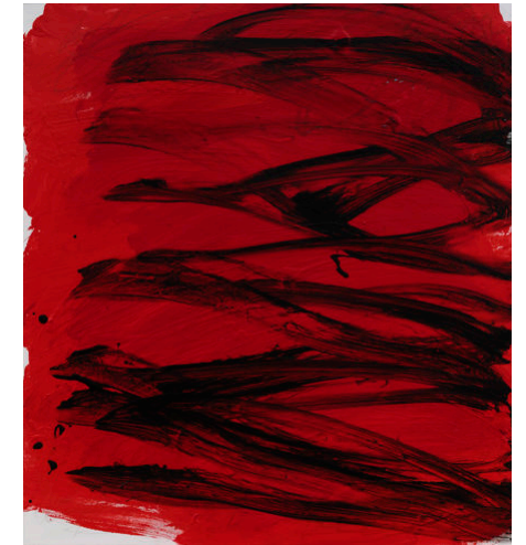
Warialda (Flag) 2025, 71 x 64 cm