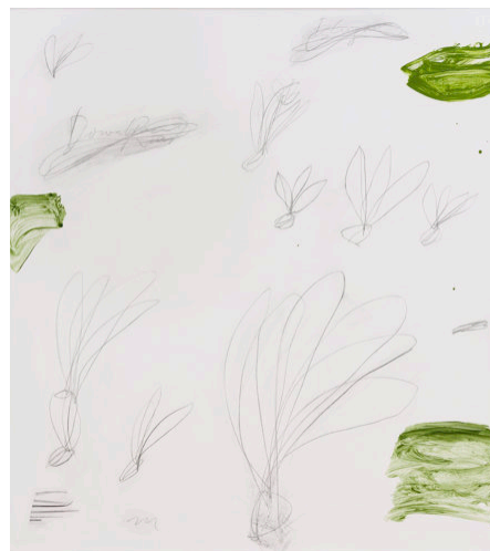
Garden I 2024, 87 x 78 cm