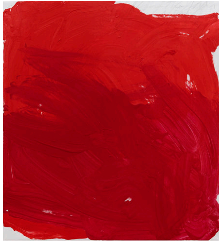
Kapulu 2023, 71 x 64 cm