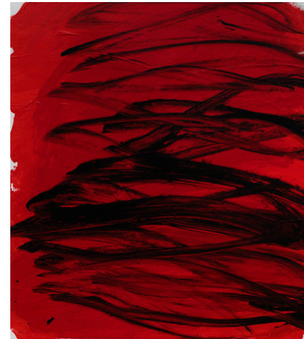
Warialda (Wave) 2025, 71 x 64 cm

Cover Image: Cardenio 2024, 71 x 64 cm All artworks are graphite & acrylic on canvas