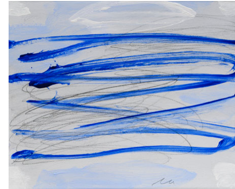
Anemoi II 2025, 32 x 39 cm