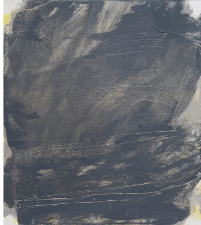
After Fire V 2023, 50 x 44 cm