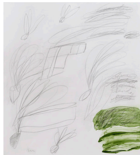
Allotment 2024, 71 x 64 cm