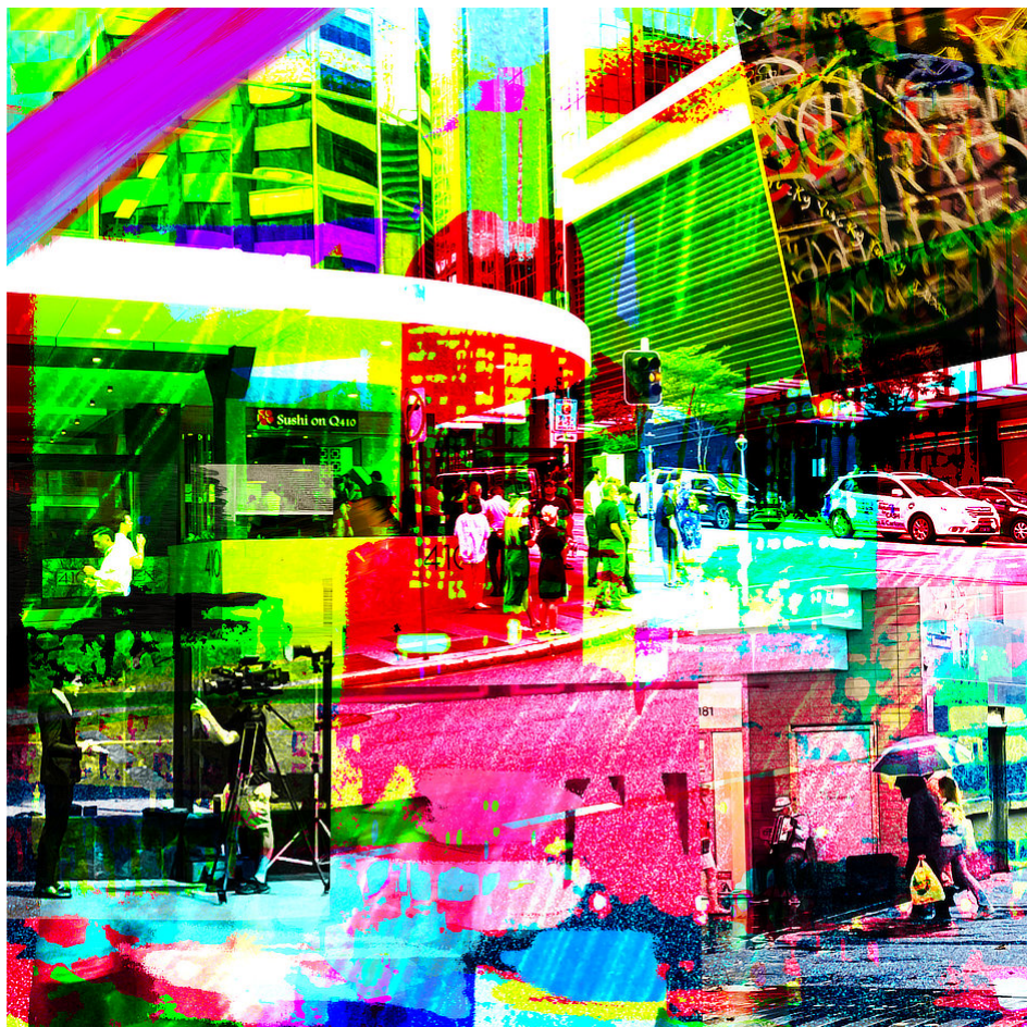
Lunch in the City 2025, Digital Print on Cotton Rag Paper, 42.0 x 59.4 cm