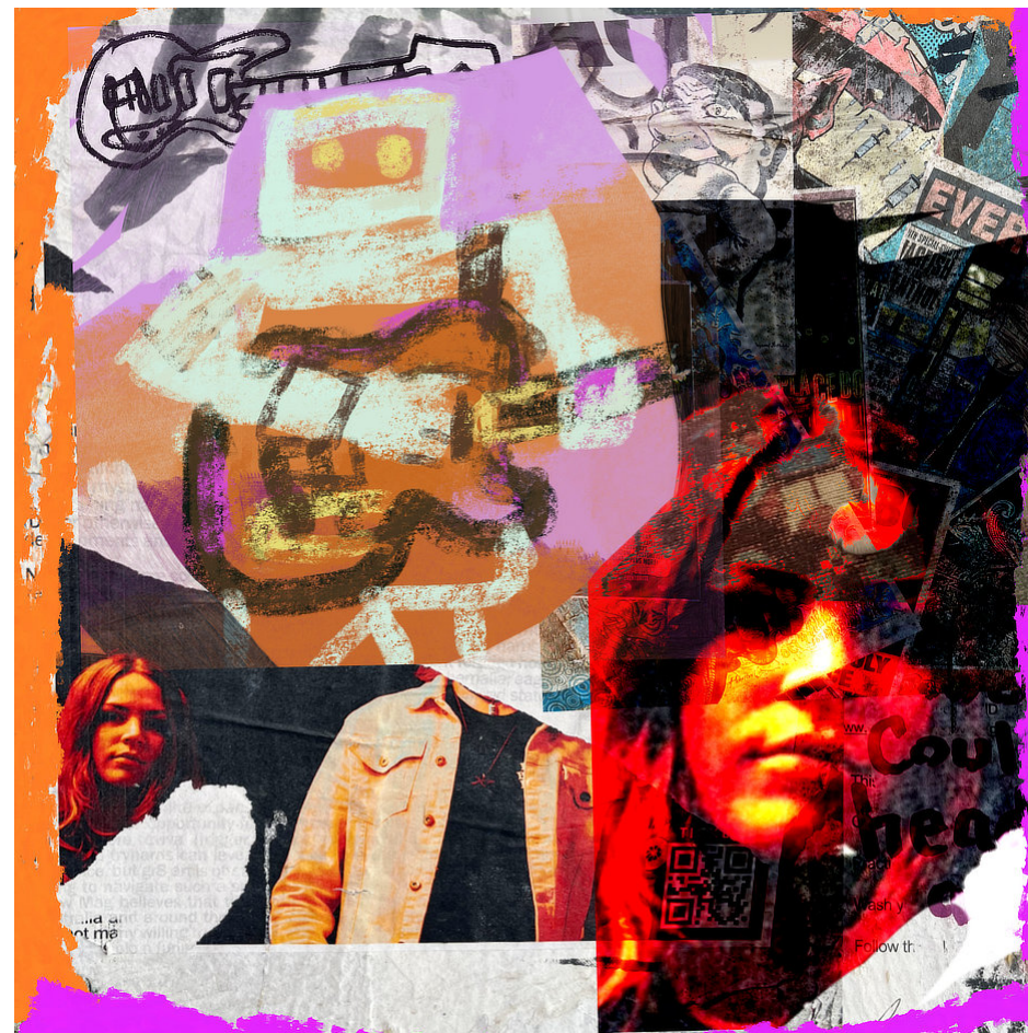
Peace Chaos 2025, Digital Print on Cotton Rag Paper, 42.0 x 59.4 cm