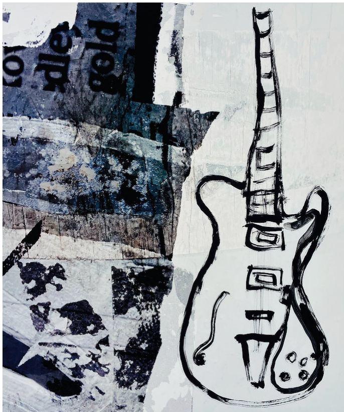
Turn it Up 2025, Digital Print on Cotton Rag Paper, 42.0 x 59.4 cm

A selection of artworks from the exhibition 'On Another Planet'