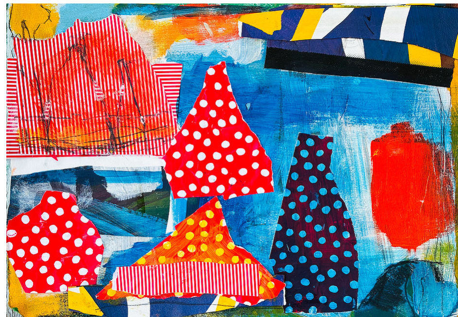
Communion 2025, Mixed Media on Paper, 21.0 x 29.7 cm