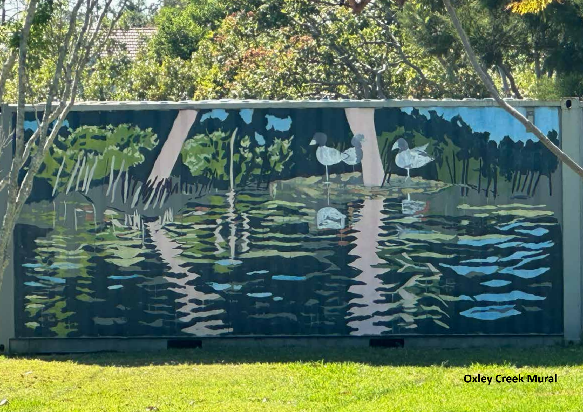
Oxley Creek Mural